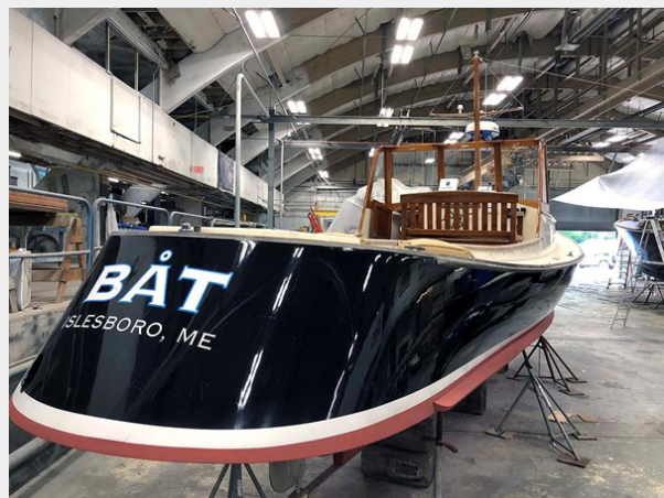
Sheer Line, Stbd. side