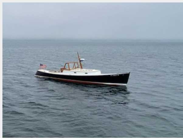
Stbd. Bow in Water