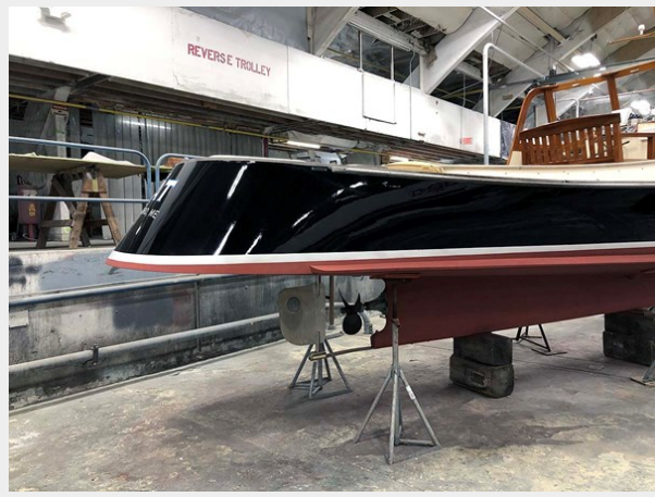
Aft Qtr., Hauled Out