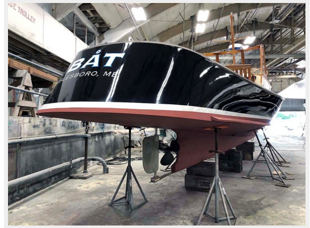
Stbd. Transom, Hauled Out