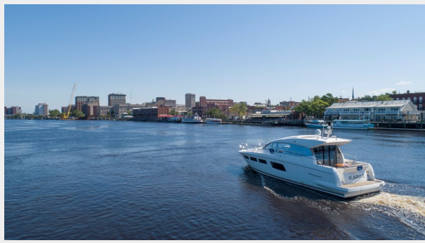
50' Prestige - 03