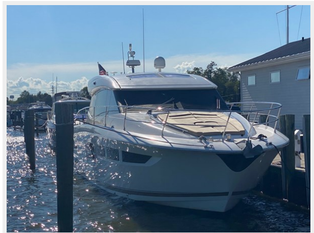
dennis prest 14