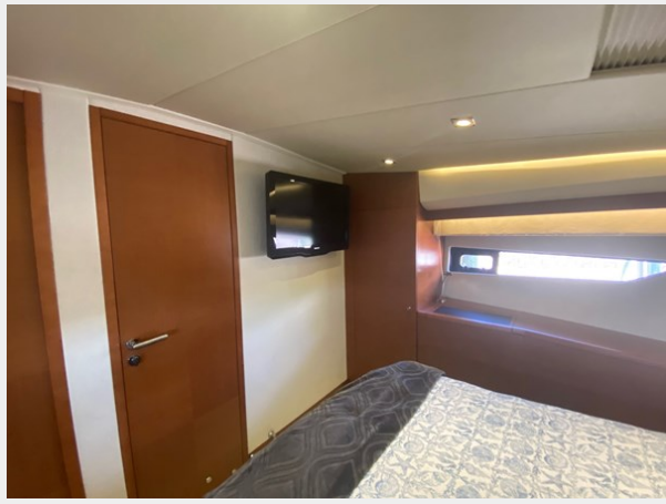
dennis prest 7