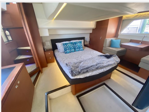
dennis prest 10