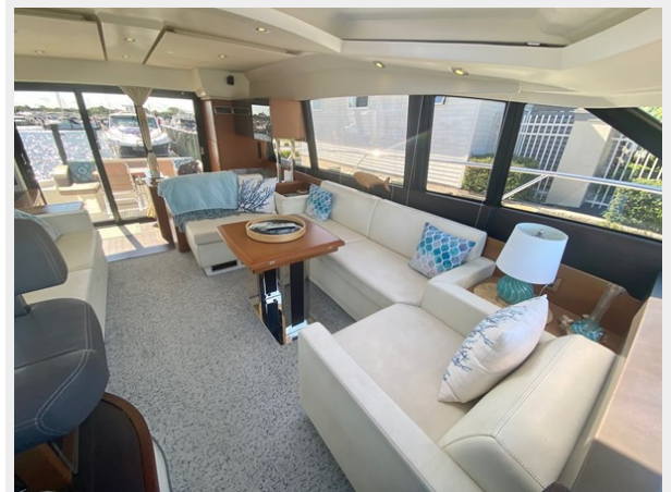
dennis prest 9