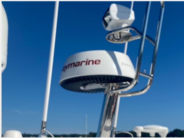
dennis prest 13