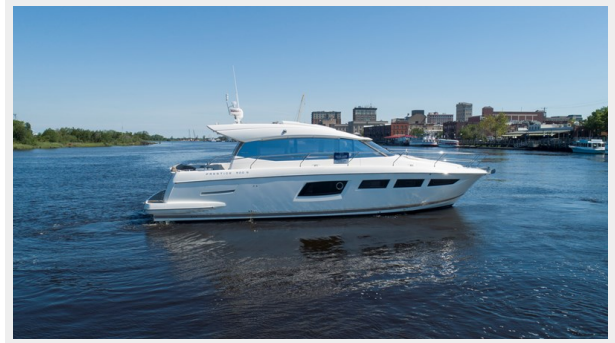
50' Prestige - 04