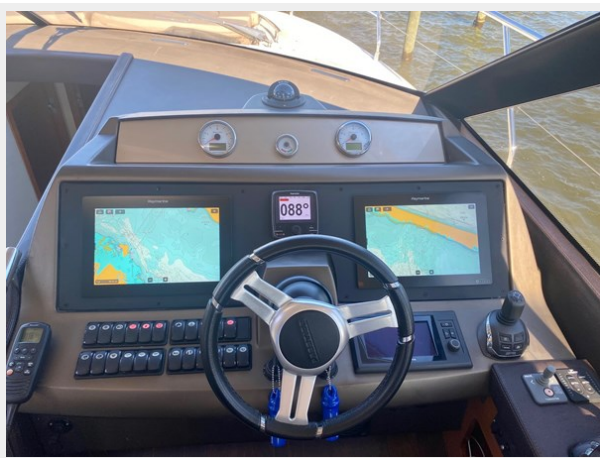
dennis prest 3