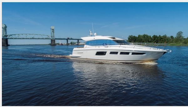
50' Prestige - 36