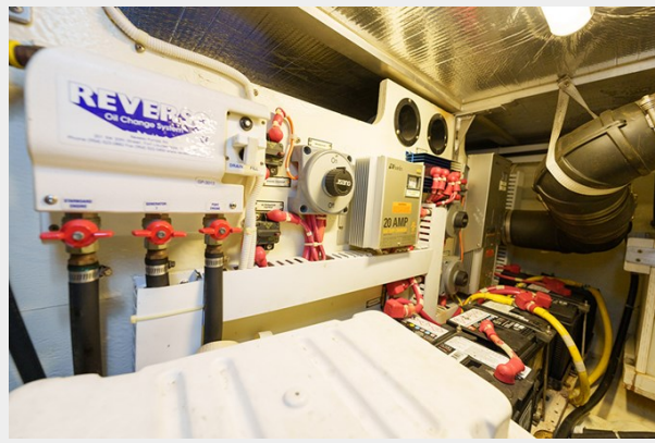
Engine room view 4