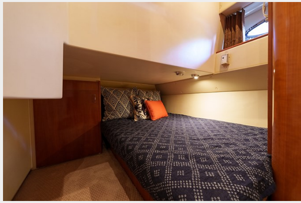
Port guest stateroom