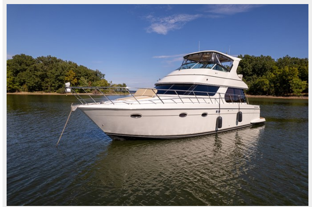
Port bow profile