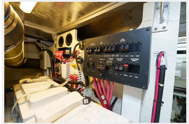
Engine room view 5