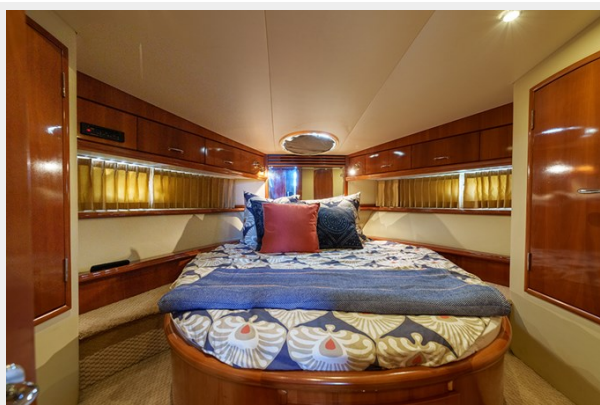
Master stateroom view 2