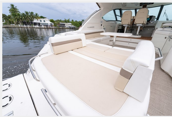
Transom sunpad view 2