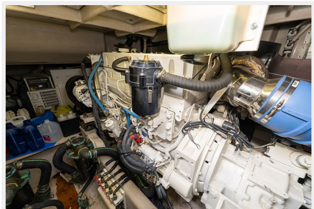
Engine room view 2