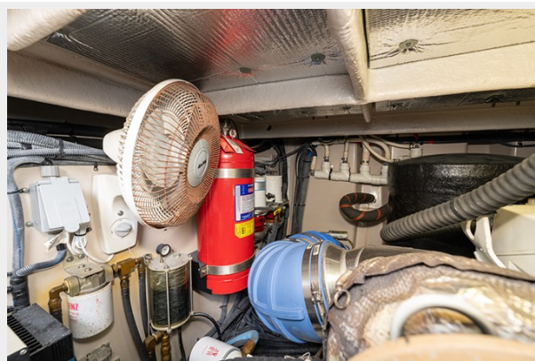
Engine room view 3