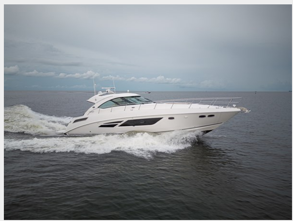
Stbd profile 4