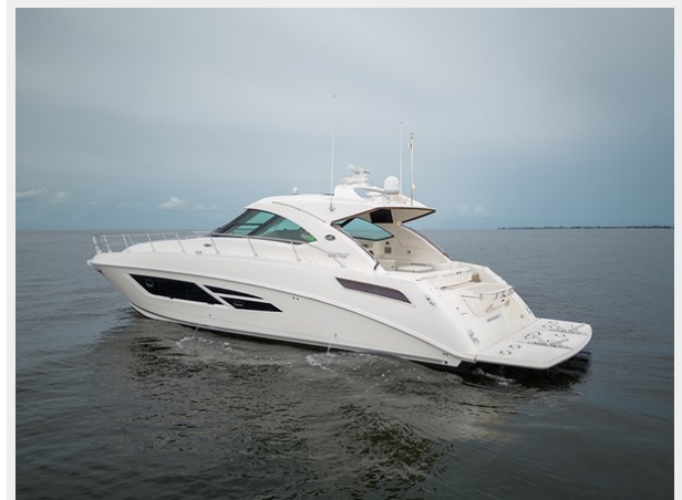
Port profile 2