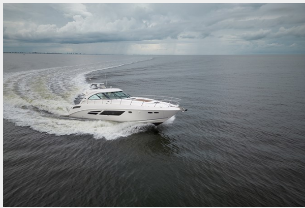
Stbd profile 7