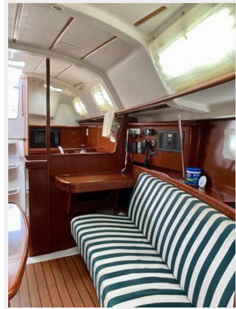
Port side interior facing aft