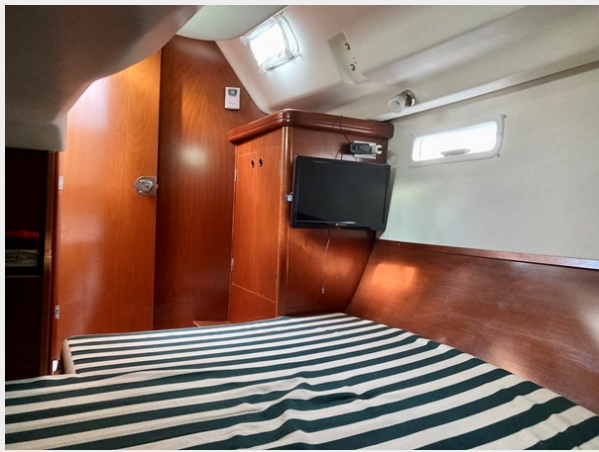
Starboard aft double-berth cabin with SmartTV