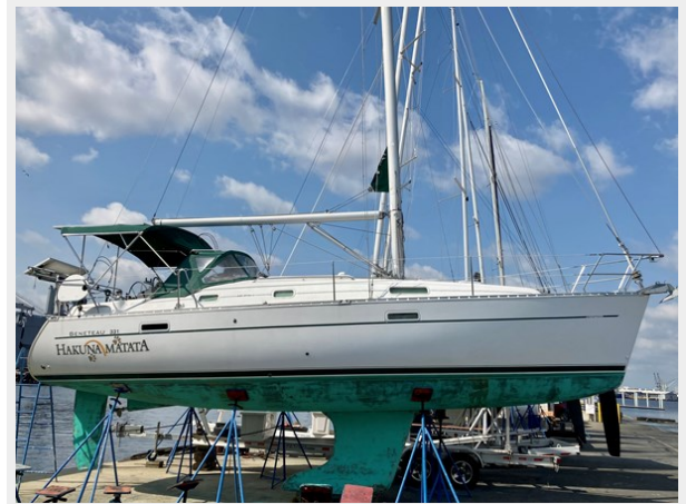
Starboard Hull side