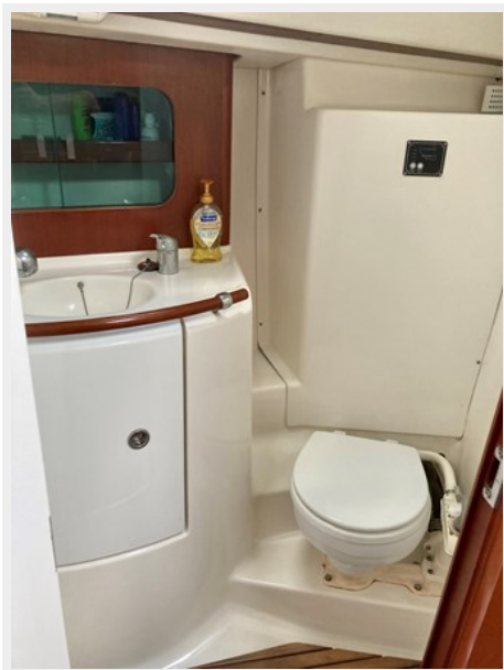
Bathroom Sink Marine Head with teak drain panIMG-3467