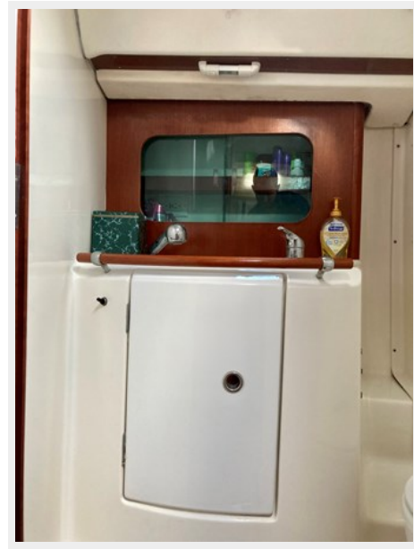
Bathroom Sink Marine Head with teak drain pan