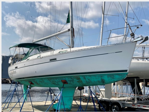
Starboard Bow Hull side