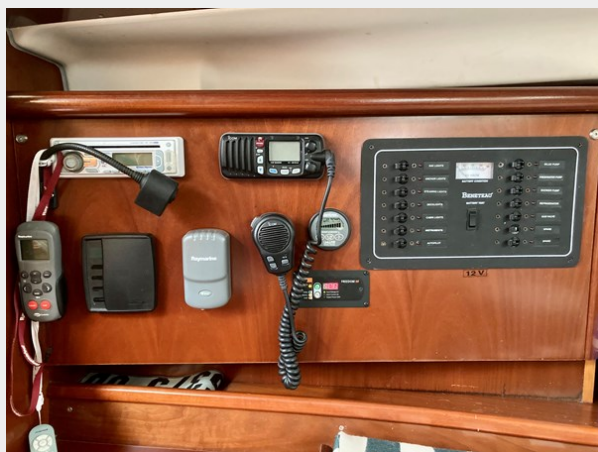
Nav Station Chart table and Breaker panel