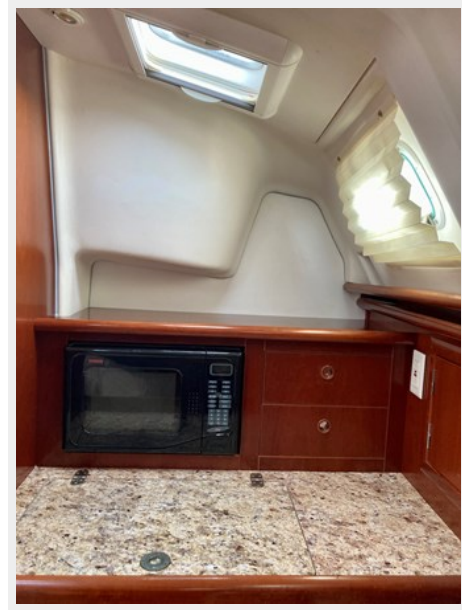
Deep Freezer and refrigerator