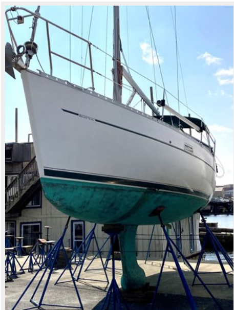
Port Bow Hull side