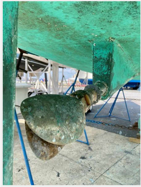
Two-blade folding propeller