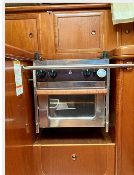
Propane gas stovetop and oven