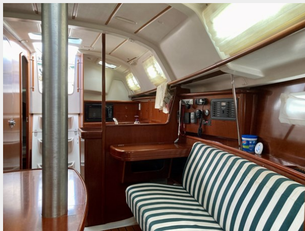
Main Salon facing aft