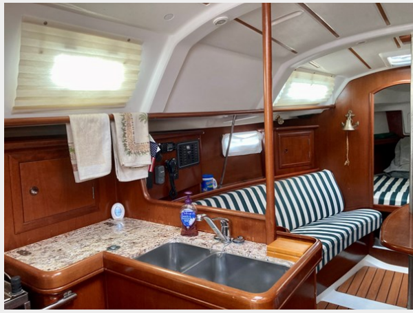
Galley and Nav Station