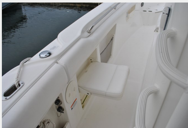
Walkaround Flip Down Seating