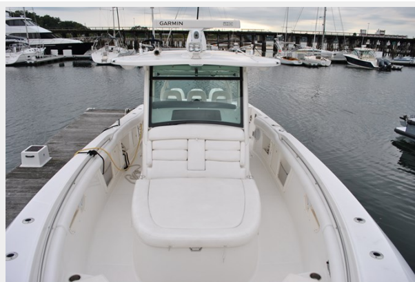
Console Lounge Seating