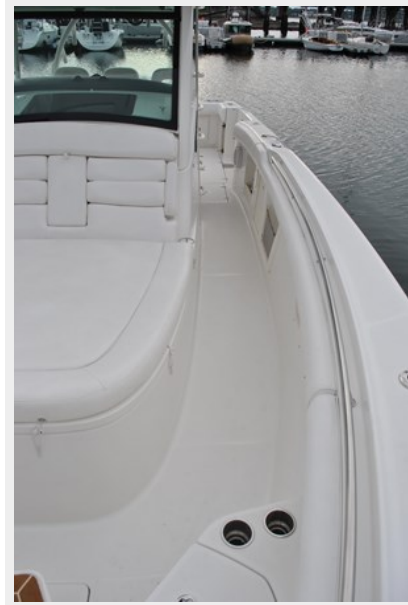
Port Side Walkaround