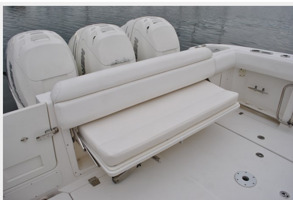
Cockpit Aft Seat