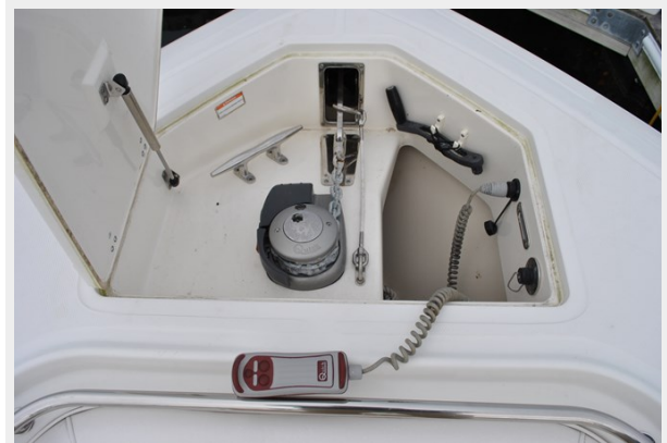
Bow Anchor Locker