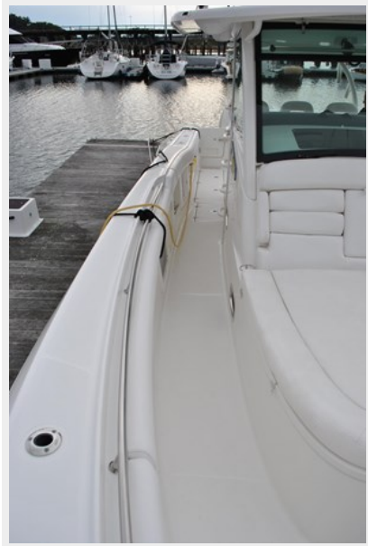
Starboard Side Walkaround