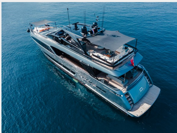
AERIAL SHOT IDLE