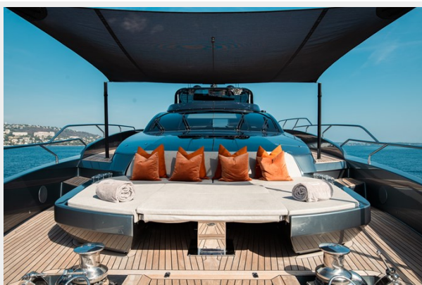
SUN LOUNGE FORWARD WITH CANOPY