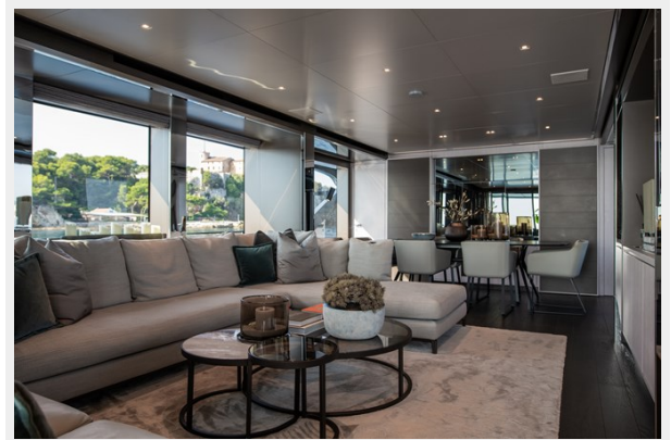
DETAIL MAIN SALON