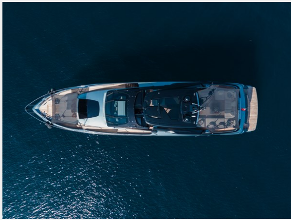
AERIAL SHOT BIRDS EYE VIEW