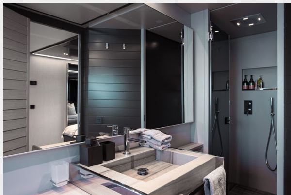
VIP CABIN BATHROOM