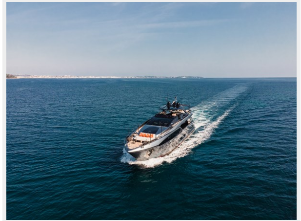
AERIAL RUNNING SHOT