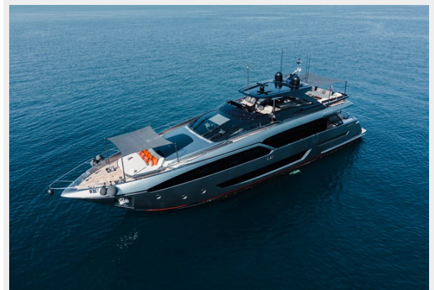
AERIAL PROFILE SHOT