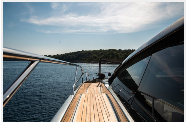
DECK DETAIL FORWARD