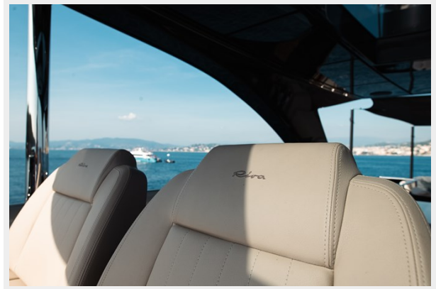
FLYBRIDGE SEAT DETAIL