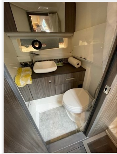
2022 SEA RAY SLX400 head picture for sale fresh water low hours