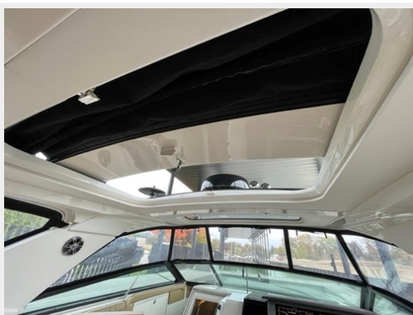
2022 SEA RAY SLX400 opening picture for sale fresh water low hours