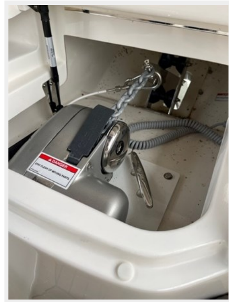
2022 SEA RAY SLX400 windlass picture for sale fresh water low hours