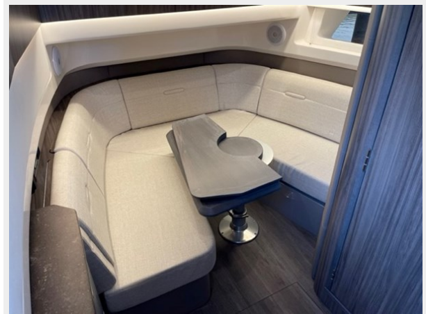
2022 SEA RAY SLX400 cabin picture for sale fresh water low hours