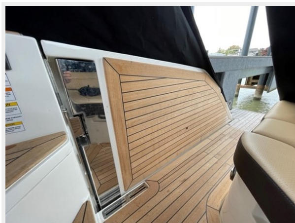
2022 SEA RAY SLX400 side deck up picture for sale fresh water low hours