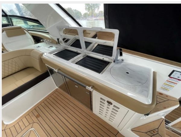
2022 SEA RAY SLX400 double grill picture for sale fresh water low hours