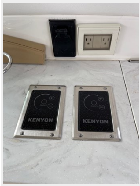
2022 SEA RAY SLX400 grill control picture for sale fresh water low hours