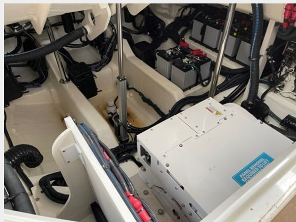
2022 SEA RAY SLX400 seakeeper picture for sale fresh water low hours