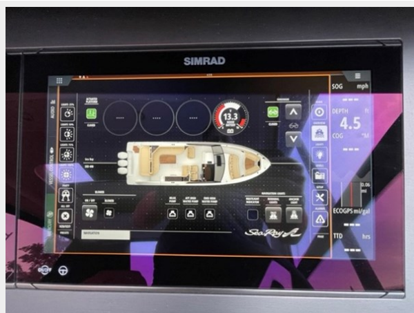
2022 SEA RAY SLX400 nav screen picture for sale fresh water low hours