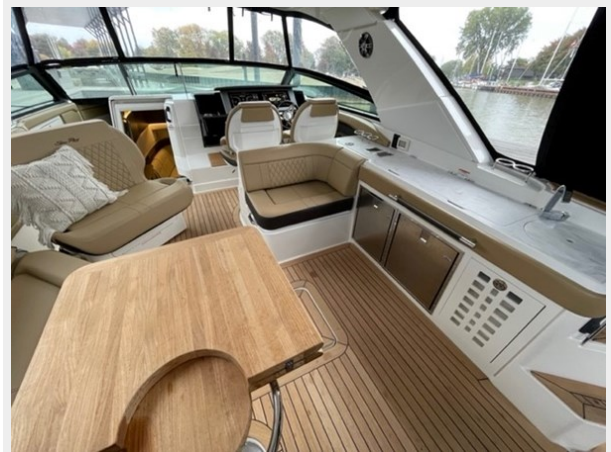
2022 SEA RAY SLX400 full cockpit picture for sale fresh water low hours