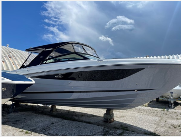
2022 SEA RAY SLX400 profile picture out of water for sale fresh water low hours