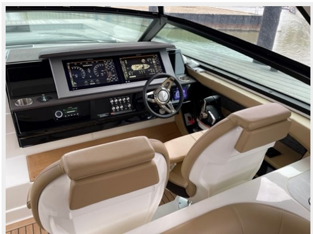
2022 SEA RAY SLX400 helm picture for sale fresh water low hours