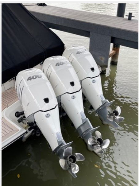
2022 SEA RAY SLX400 triple mercury 400 picture for sale fresh water low hours