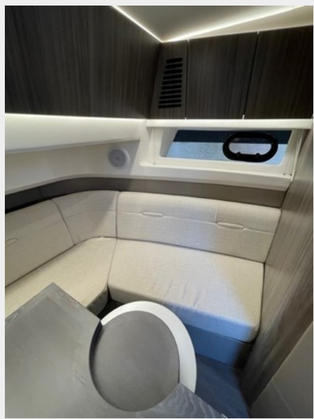
2022 SEA RAY SLX400 seating picture for sale fresh water low hours