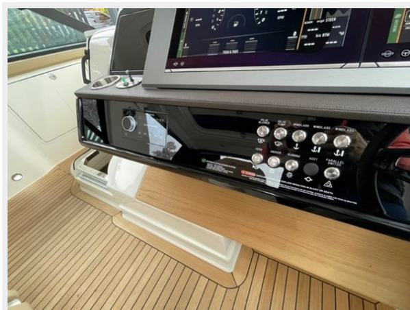
2022 SEA RAY SLX400 dash buttons picture for sale fresh water low hours