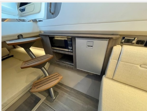
2022 SEA RAY SLX400 cabin fridge picture for sale fresh water low hours