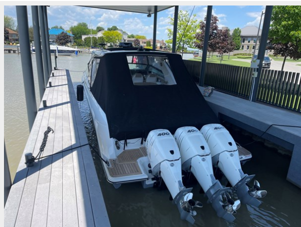
2022 SEA RAY SLX400 stern picture for sale fresh water low hours