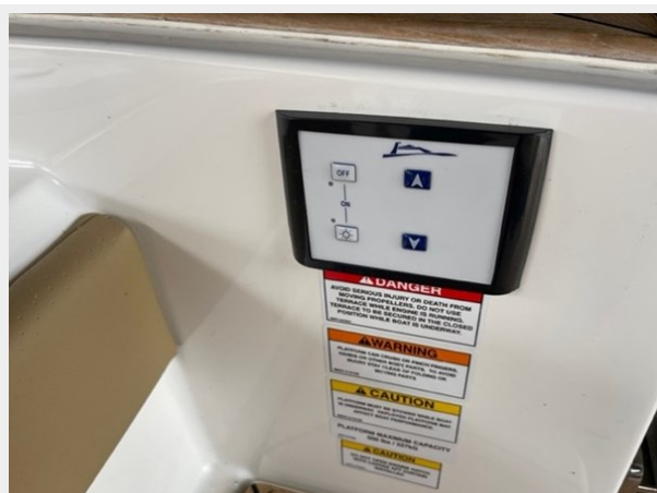
2022 SEA RAY SLX400 side deck control picture for sale fresh water low hours