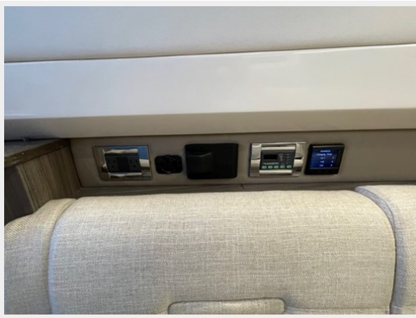
2022 SEA RAY SLX400cabin controls picture for sale fresh water low hours