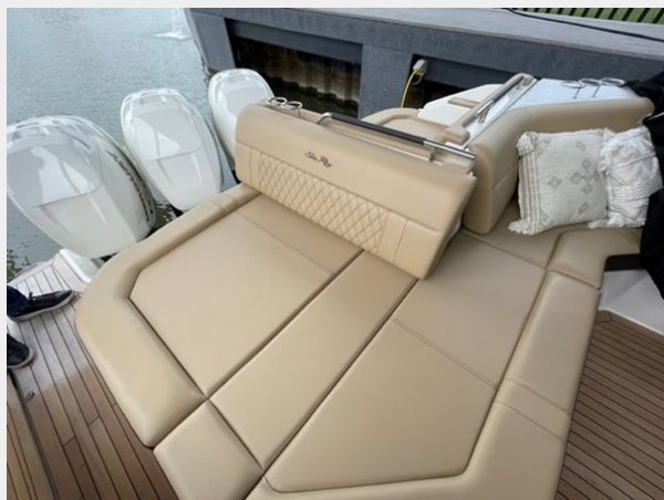
2022 SEA RAY SLX400 aft swing seat picture for sale fresh water low hours