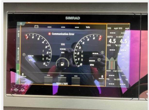
2022 SEA RAY SLX400 engine instruments picture for sale fresh water low hours