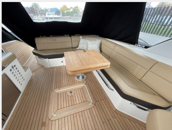
2022 SEA RAY SLX400 cockpit picture for sale fresh water low hours