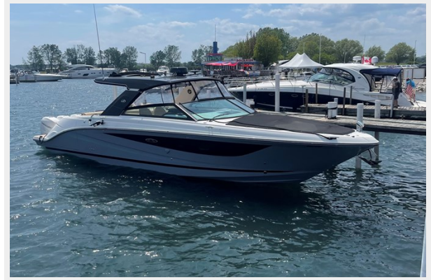
2022 SEA RAY SLX400 profile picture in water for sale fresh water low hours