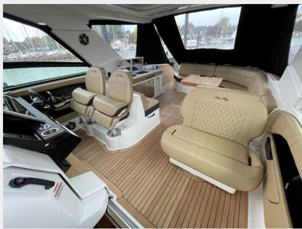
2022 SEA RAY SLX400 cockpit helm seat picture for sale fresh water low hours