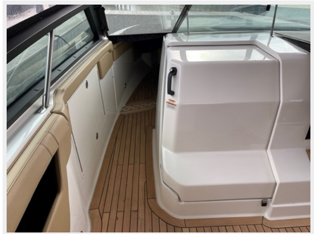
2022 SEA RAY SLX400 bow access picture for sale fresh water low hours