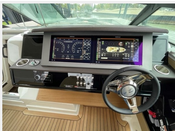
2022 SEA RAY SLX400 full helm dash picture for sale fresh water low hours