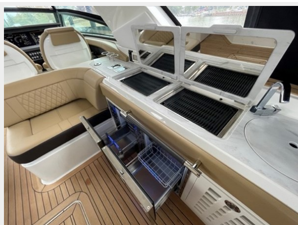
2022 SEA RAY SLX400 grill and fridge picture for sale fresh water low hours