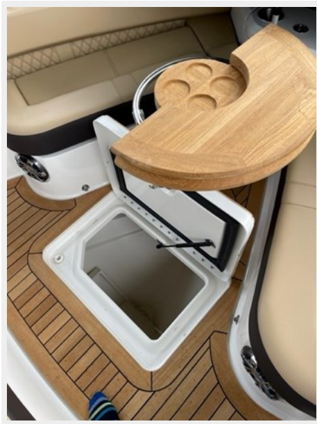
2022 SEA RAY SLX400 bow floor storage picture for sale fresh water low hours