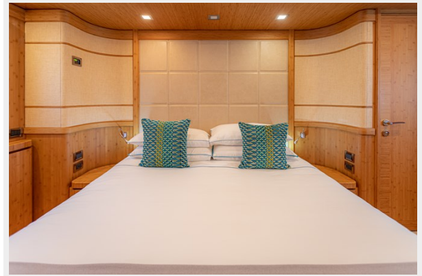
Owner Cabin 4