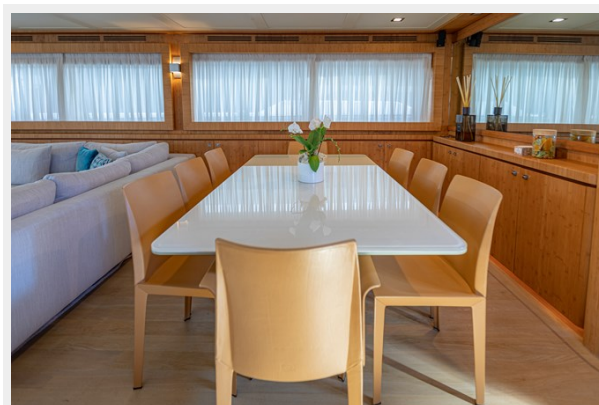
Main Salon 4