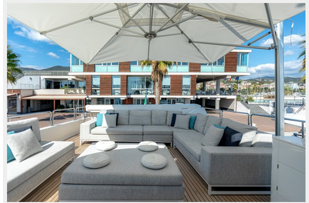
External Upper Deck 1