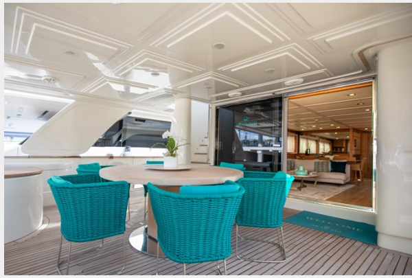
External Main Deck