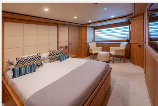
Vip Stateroom 1