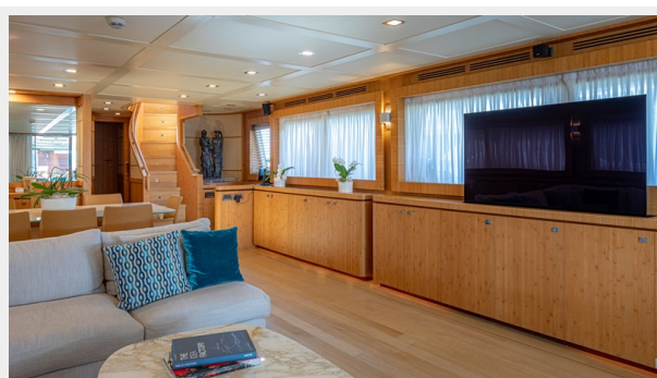
Main salon 3