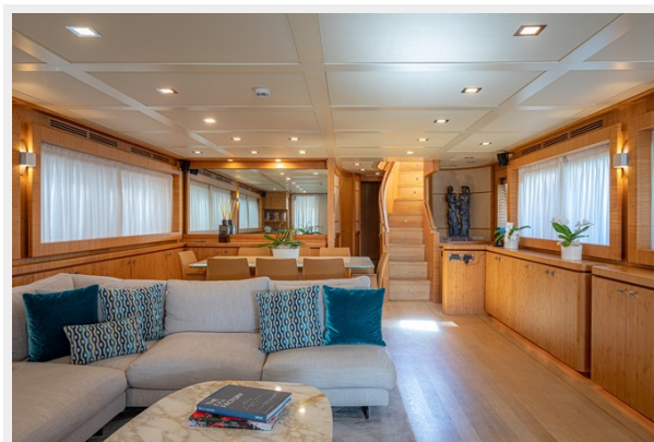
Main Salon 2