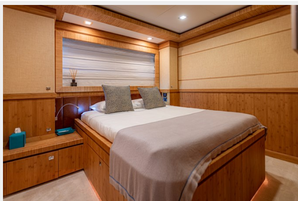
Guest Stateroom 1