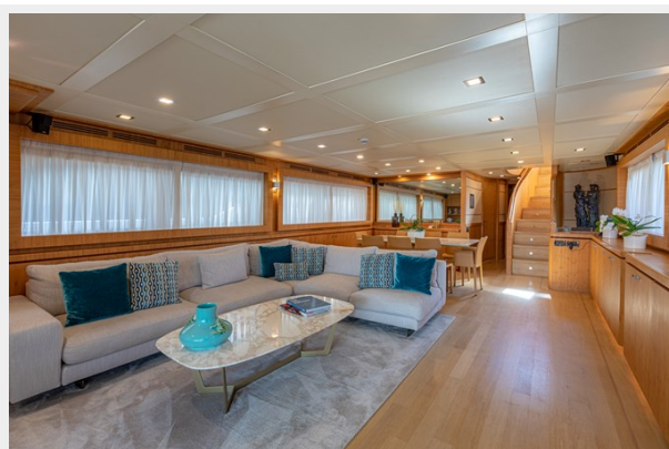
Main salon 1