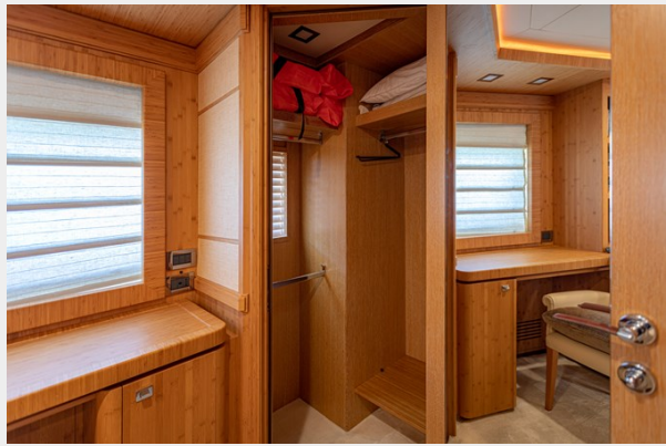
Owner Cabin 3