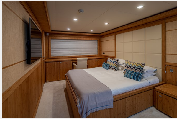
Vip Stateroom 1/3