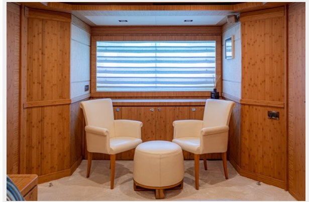
Vip Stateroom 1/4