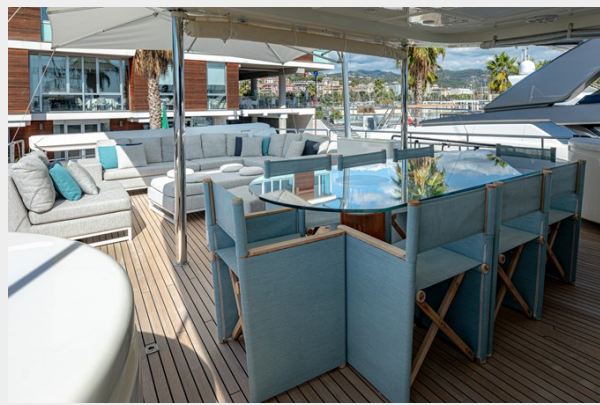
External Upper Deck 2