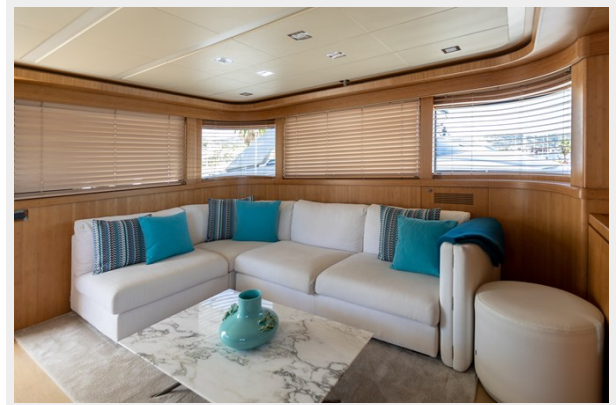
Upper Deck Salon 1