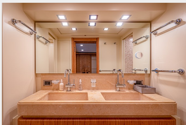
Vip Stateroom 1 Head