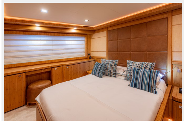
Vip Stateroom 3