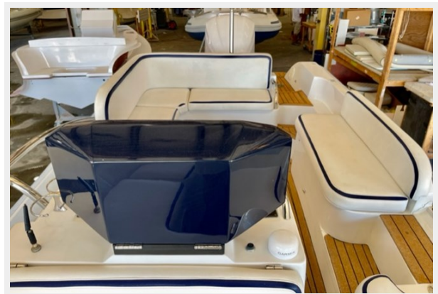
Aft Seating 1