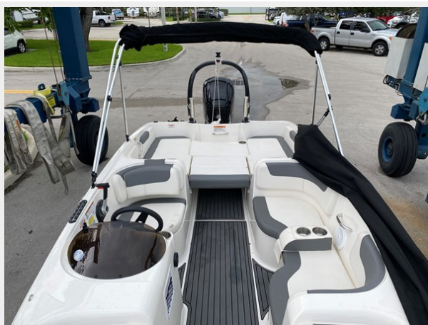
12-COCKPIT RUBBER FLOORING