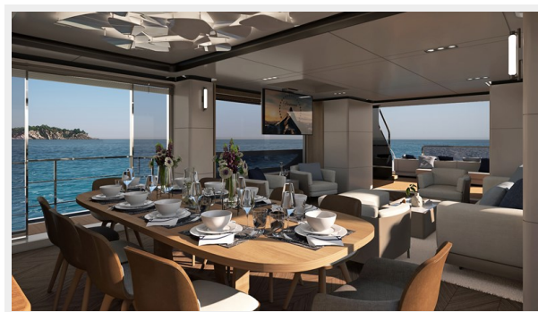
Vittoria Veloce 105 (4)