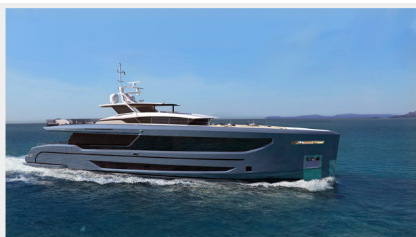
32mt Motor Yacht RPH Veloce (1)