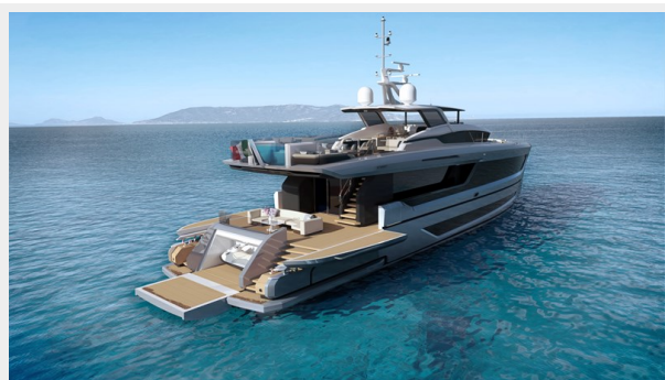
32mt Motor Yacht RPH Veloce (9)