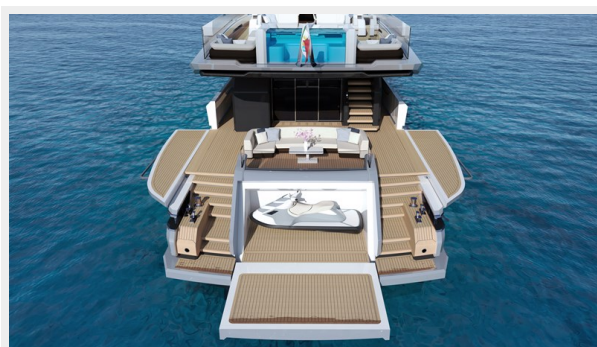
32mt Motor Yacht RPH Veloce (6)