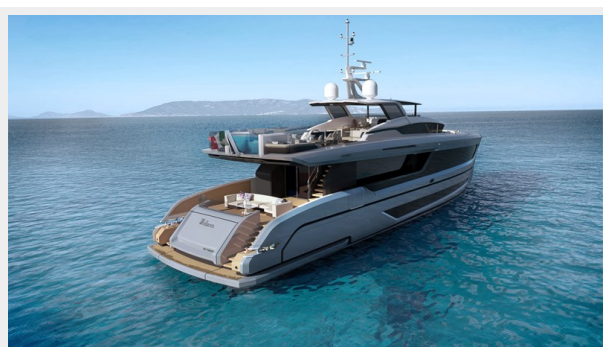
32mt Motor Yacht RPH Veloce (7)