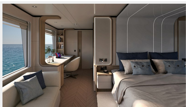
Vittoria Veloce 105 (5)