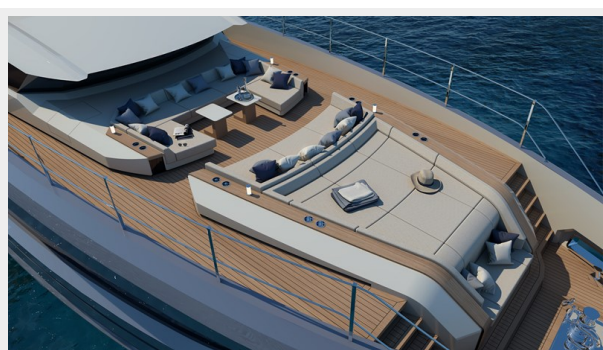
Vittoria Veloce 105 (01)