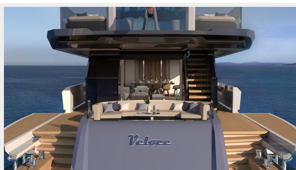
32mt Motor Yacht RPH Veloce (5)