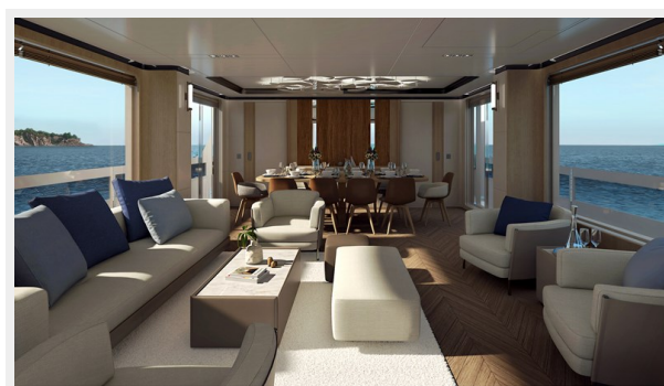
Vittoria Veloce 105 (2)