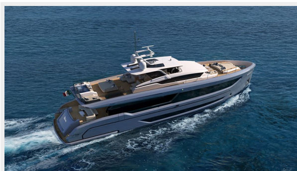
32mt Motor Yacht RPH Veloce (3)