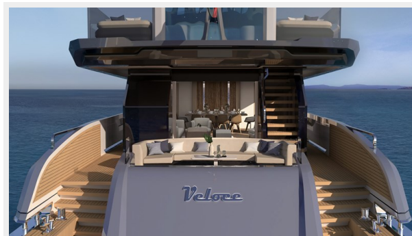
32mt Motor Yacht RPH Veloce (4)