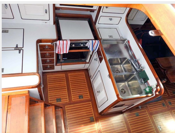
Galley, from Above