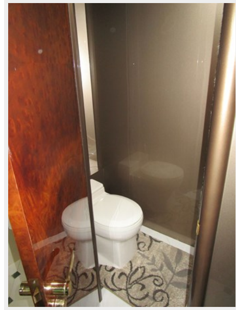
Private Toilet Room