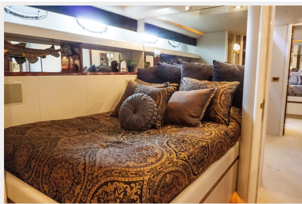
Stbd Side Cabin