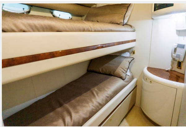
Forward Guest Room