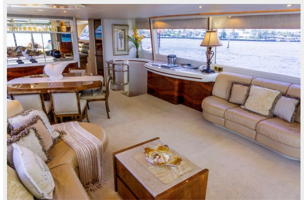
Salon Looking to Stbd