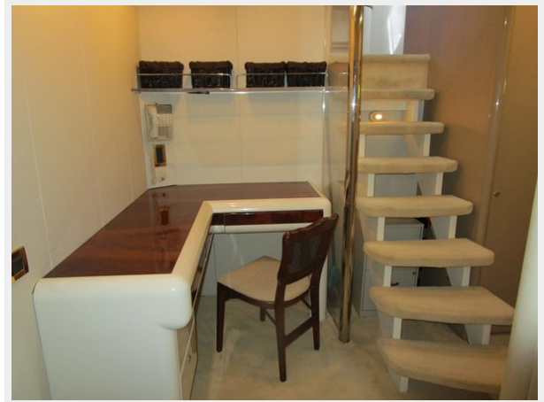
Office Area Forward forward