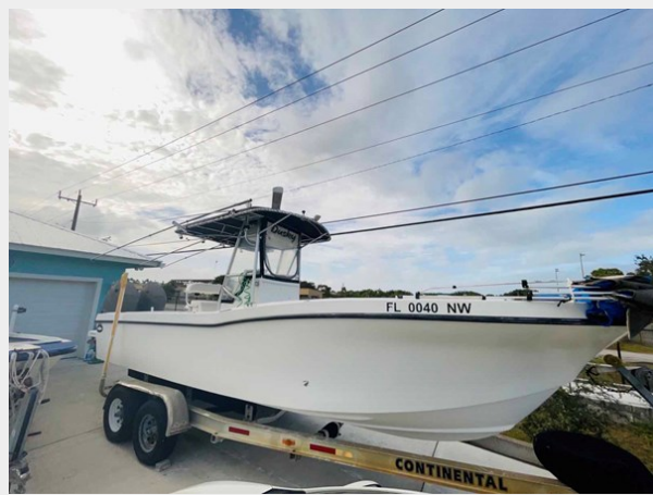
Out of water