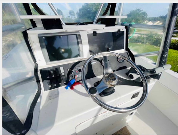
Helm port view