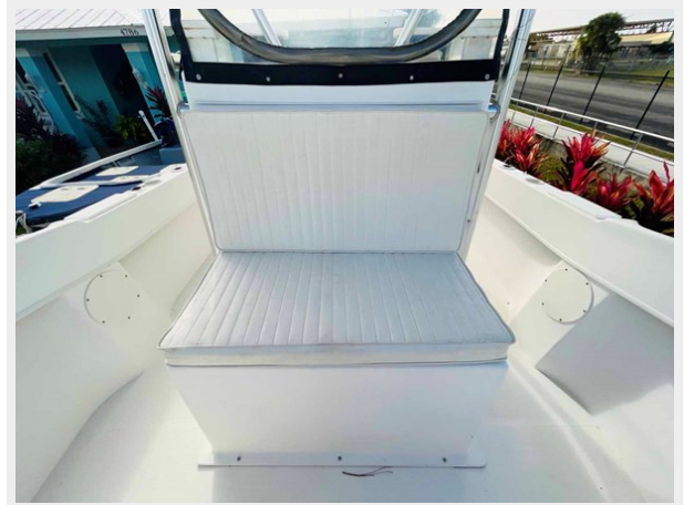
Forward console seat