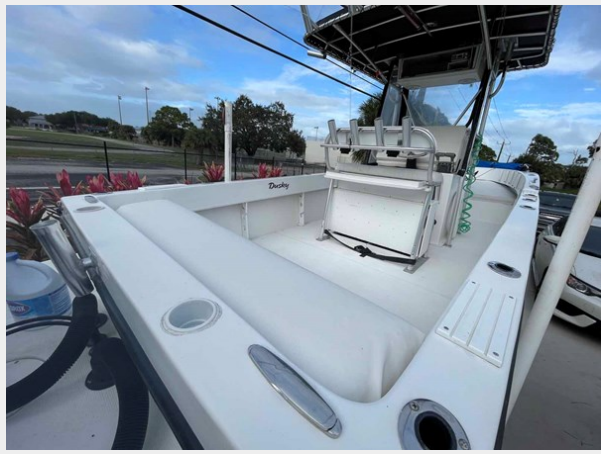
Cockpit looking forward