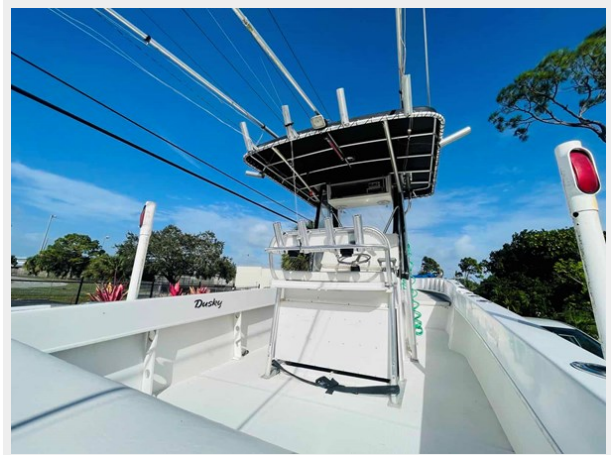
Cockpit looking forward