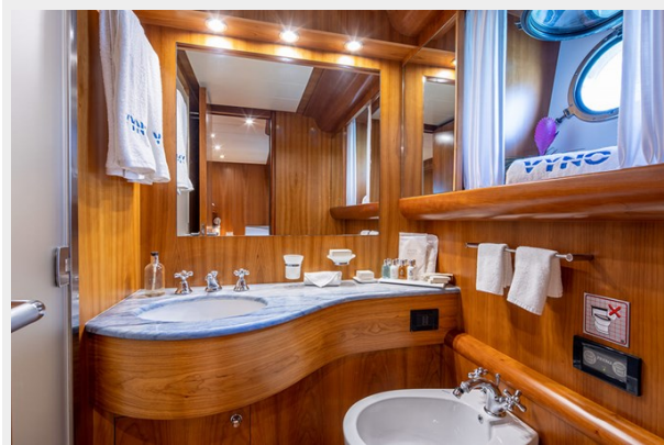
Twin Cabin 1