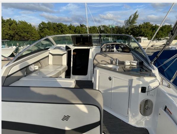
3. Cockpit 1