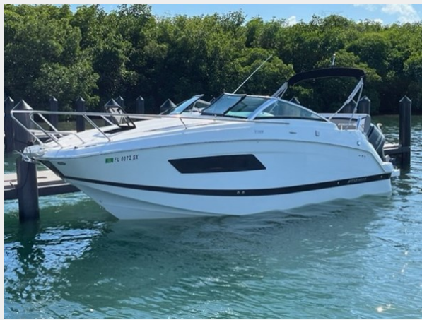
41. Dockside port