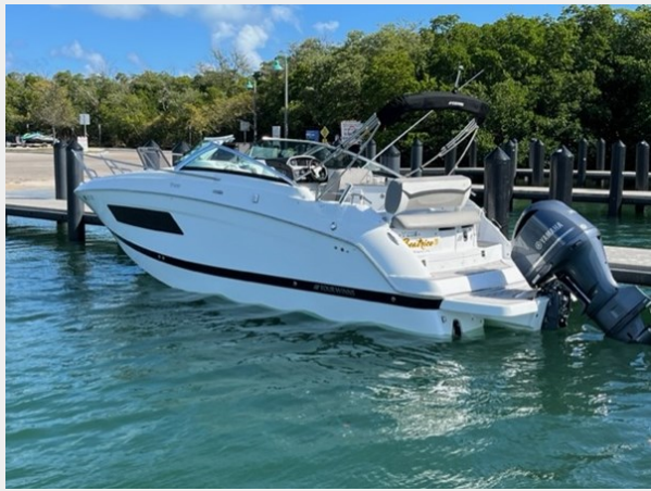
48. Port transom dockside