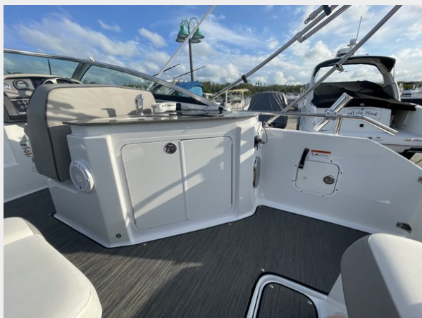
6. Cockpit Starboard Side