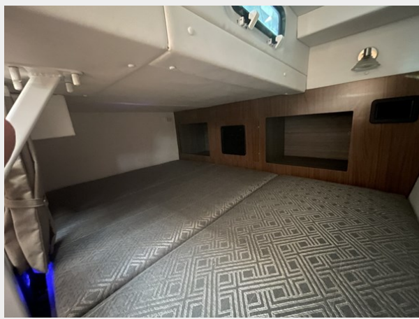
22. Mid Cabin