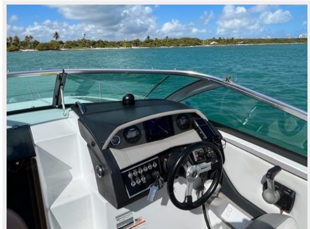
46. Helm afloat