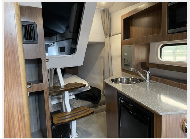
21. Cabin Steps