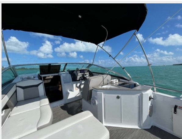
44. Cockpit OS