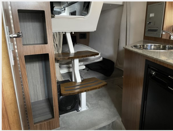
20. Cabin Steps