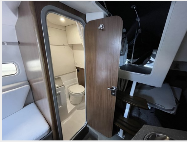
18. Head Compartment