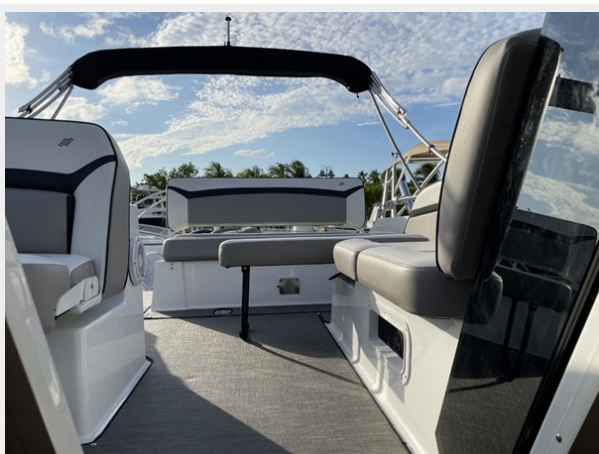
8. Cockpit 2