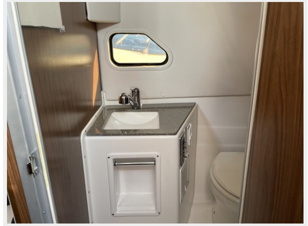
19 Head Compartment Sink