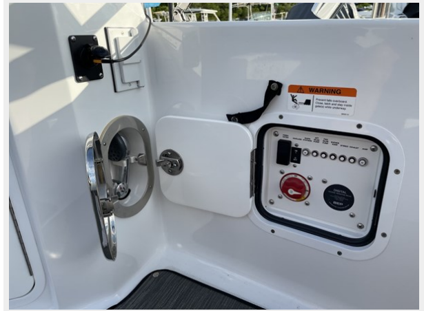
5. Cockpit Shower