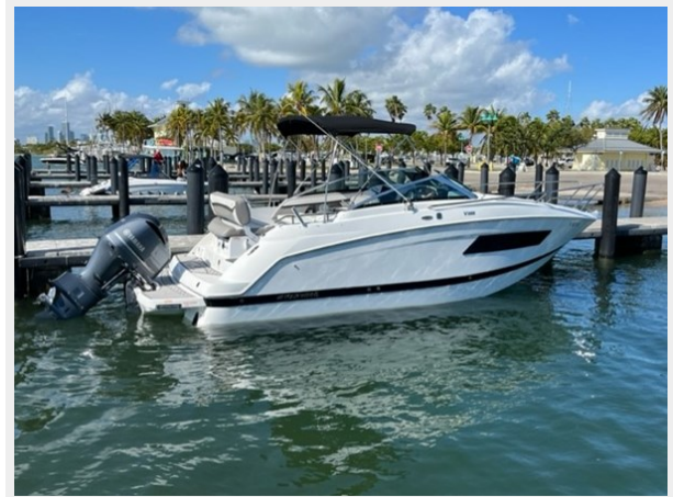
42. Dockside stb