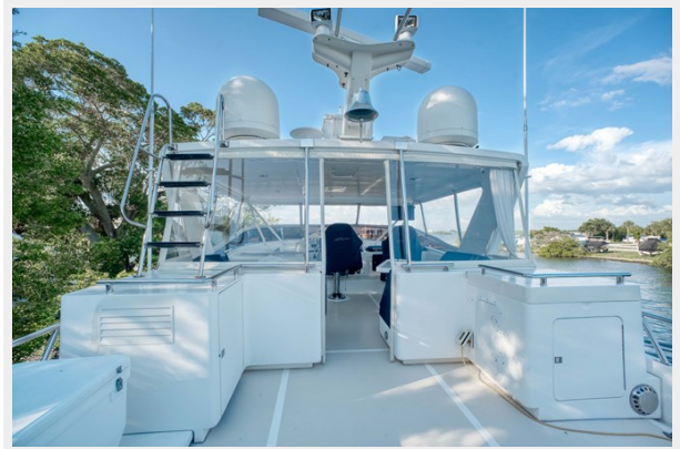
FB Looking Forward