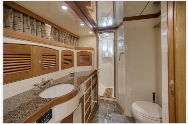
Master Head and Shower