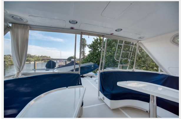
FB Aft Seating