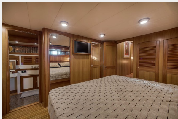
Master Looking at TV and Head