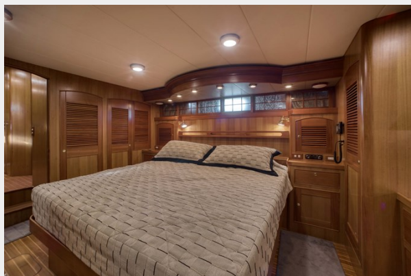
Master Looking Stbd.