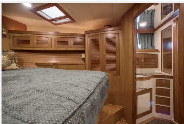
VIP Looking into Head