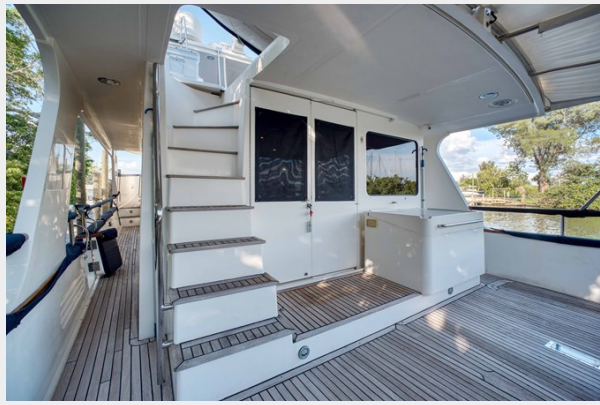
Salon Aft Doors