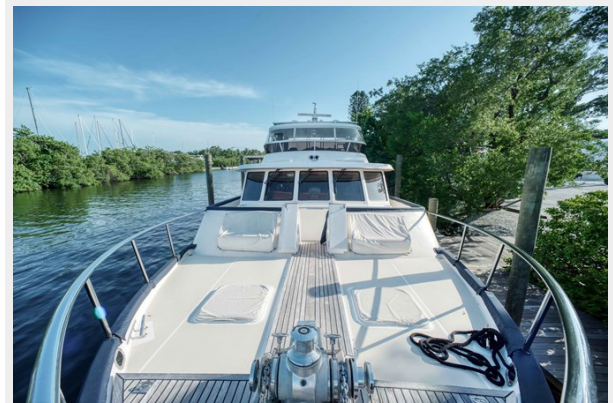
Bow Facing Aft