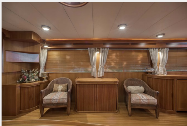
Salon Port Side