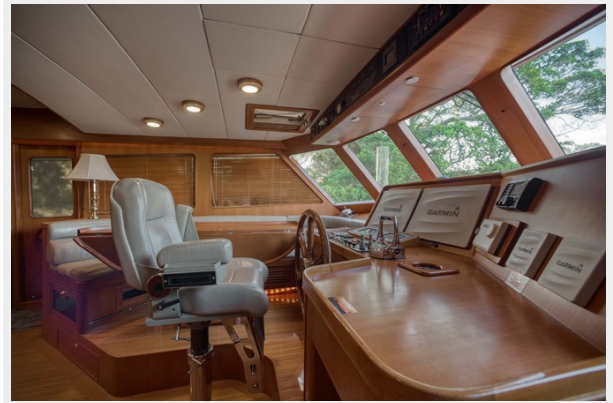
Pilot House Helm Chair