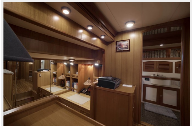
Master Laundry and Deck