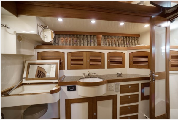
Master Head view 1