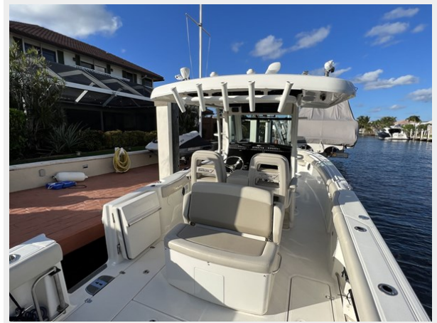
Aft Facing Seat