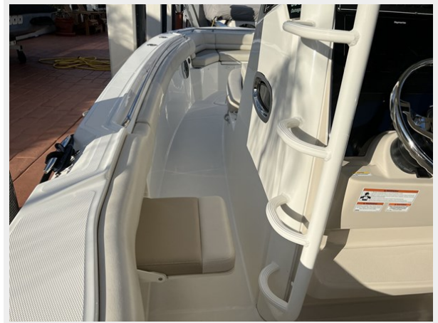
Port Side Trolling Seat