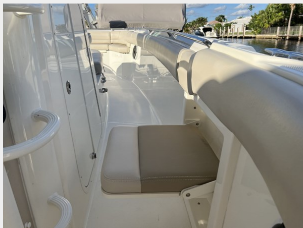
Stbd Side Trolling Seat