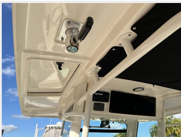
Hardtop Access Hatch