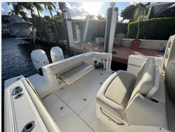
Aft Cockpit Area