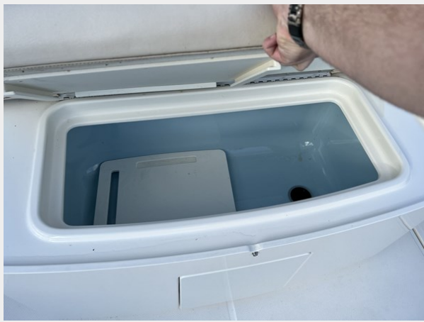
Storage Under Aft Seat