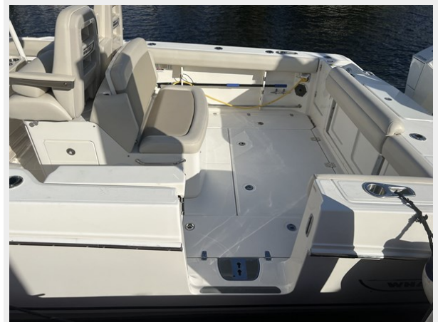
Hull Side Door