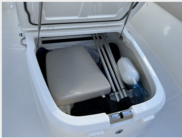
Storage Under Sun Lounge