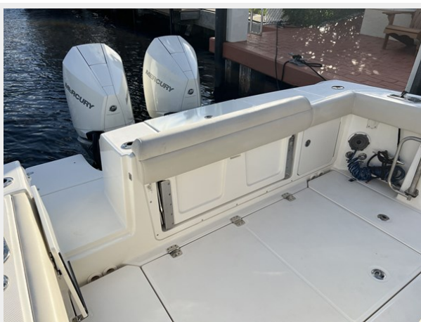
Aft Seat Stowed