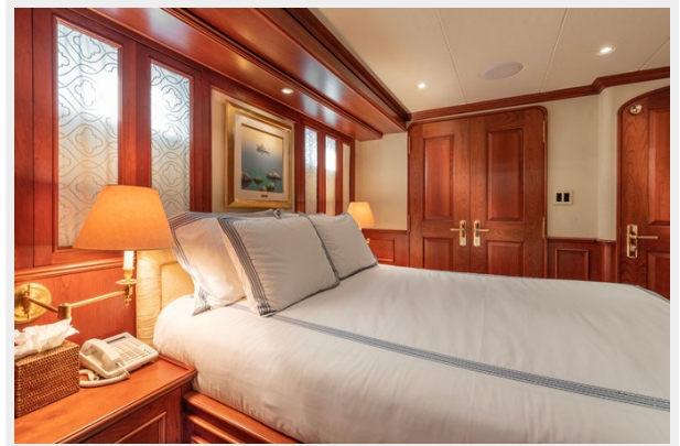
Guest VIP 2