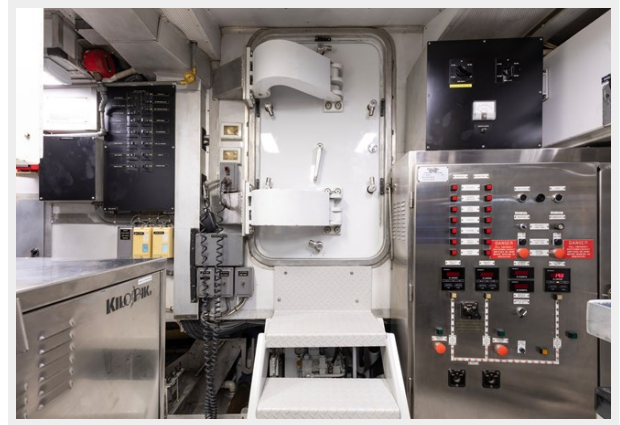
Engine room 6