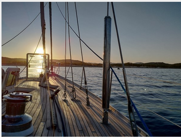
Anchor sunset 1