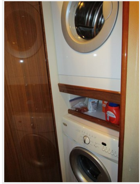
Companionway Laundry Center