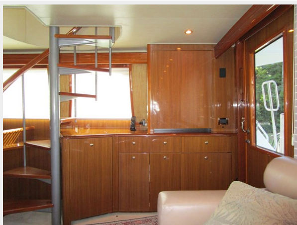
Salon to Stbd.