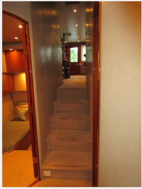
Companionway Looking Aft