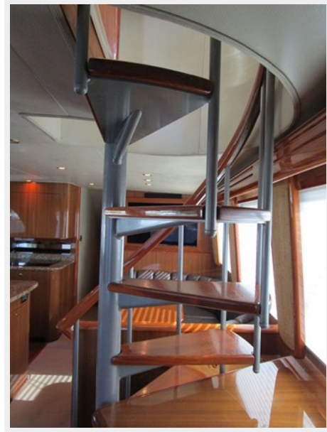
Enclosed Flybridge Steps