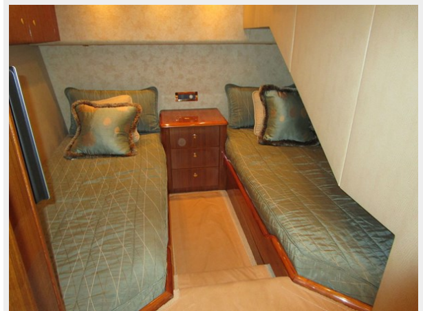
Stbd. Side Twin Looking Aft