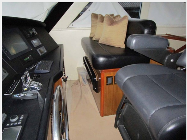
Starboard Helm Seat