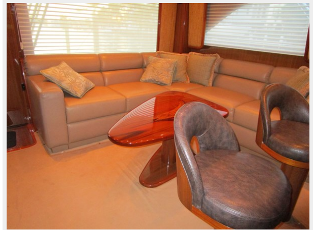
Salon to Port