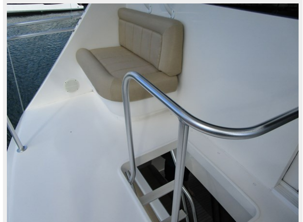
Bridge Deck Seating