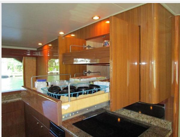
Ample Pull Out Storage