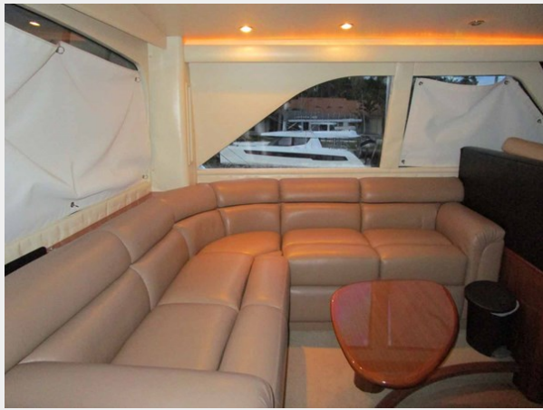
Enclosed Bridge Settee