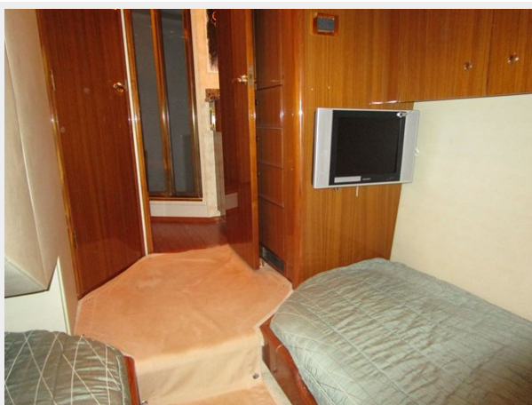
Stbd. Side Twin Looking Forward