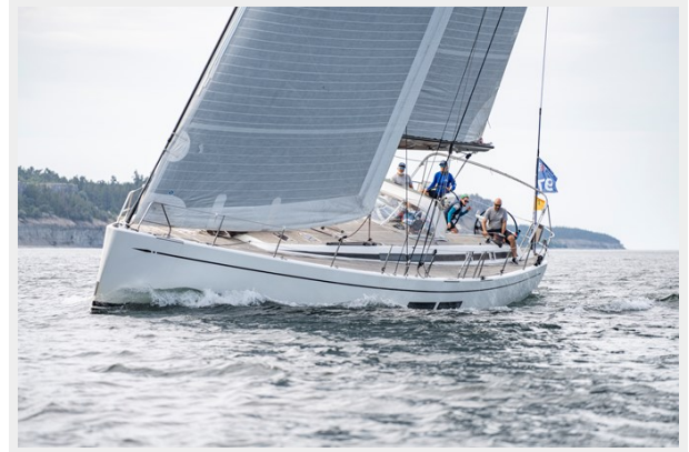
WhatsApp Image 2020-11-08 at 1.12.35 AM