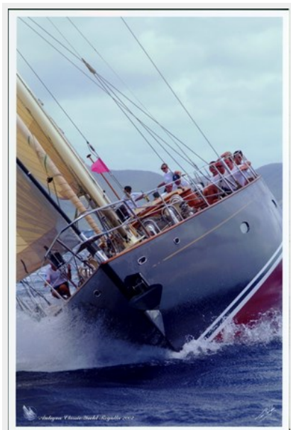
braveheart onder zeil van voor