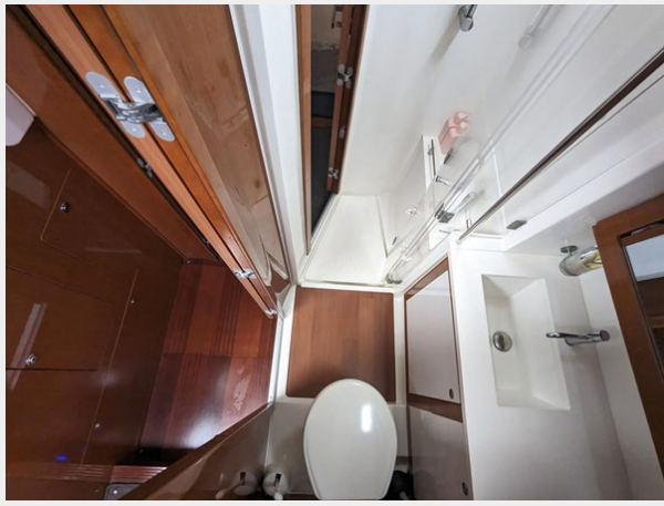
Aft Port Head