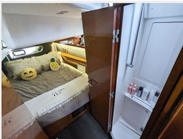
Aft Port Cabin