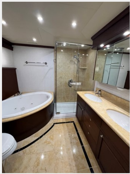
65 Master Head