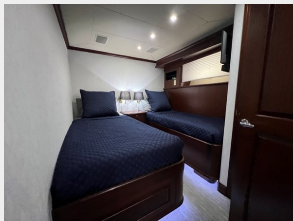
70 Guest Port