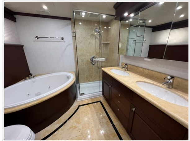
66 Master Head