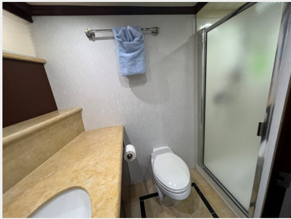
44 VIP Port Head