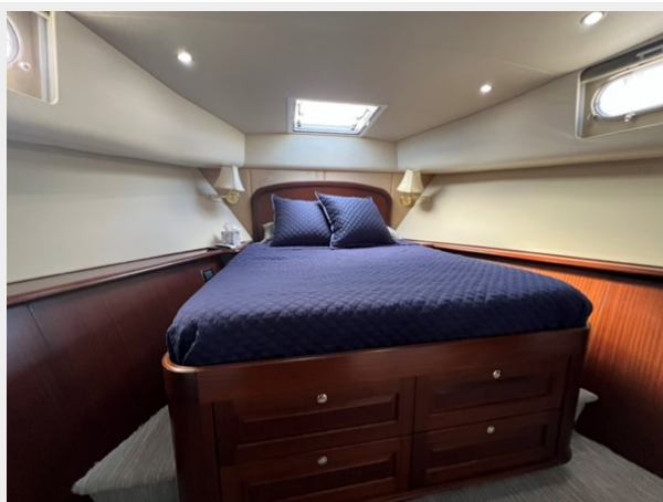
42 Forward VIP