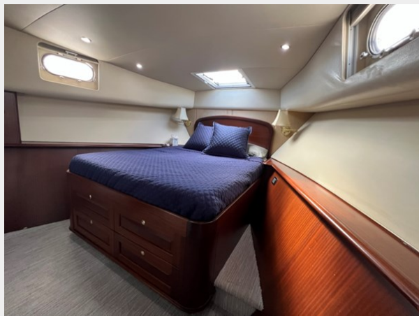
40 VIP Forward