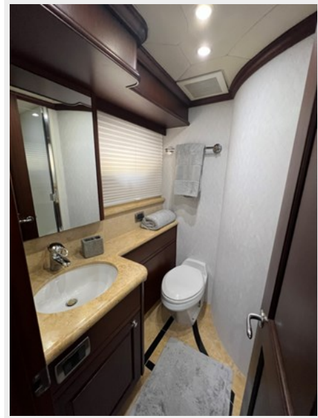
41 VIP Foward Head