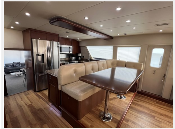
34 Galley Dinette