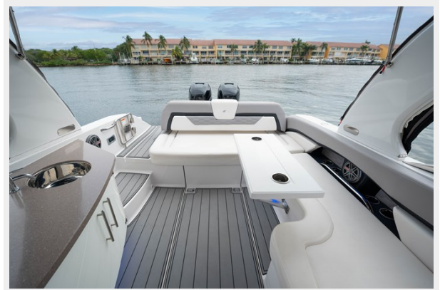
23. h290 aft seat and sunpad with trunk