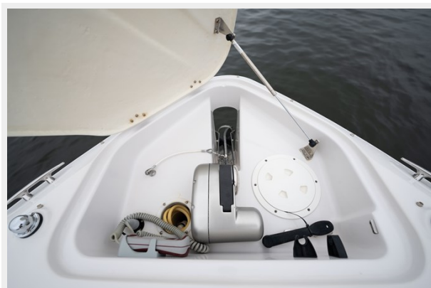
06. h290 windless