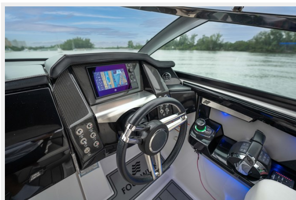
16. h290 gps