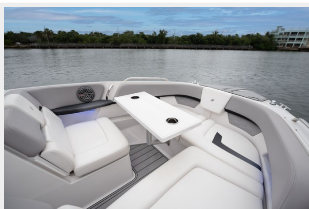
10. h290 port bow table