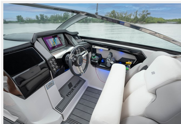
15. h290 helm