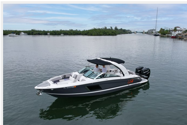
02. port side