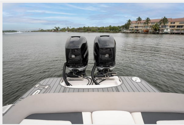
28. h290 T- Mercury 250