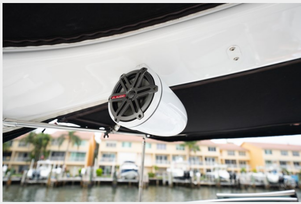
20. h290 JL sound system