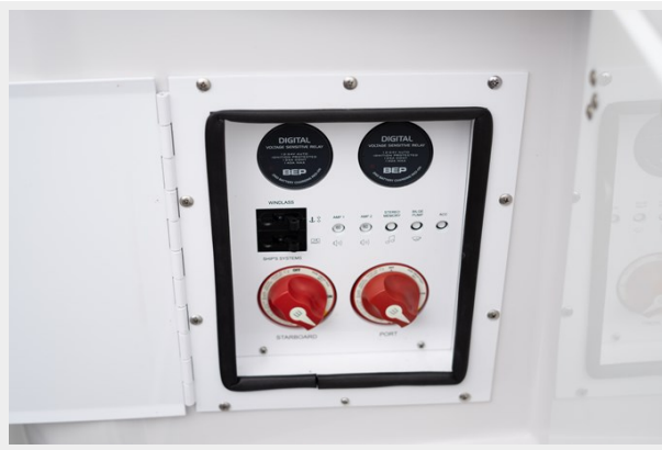
26. h290 battery switches