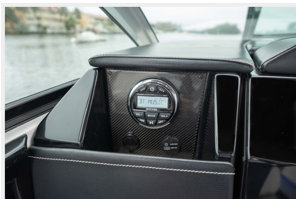
18. stereo remote port