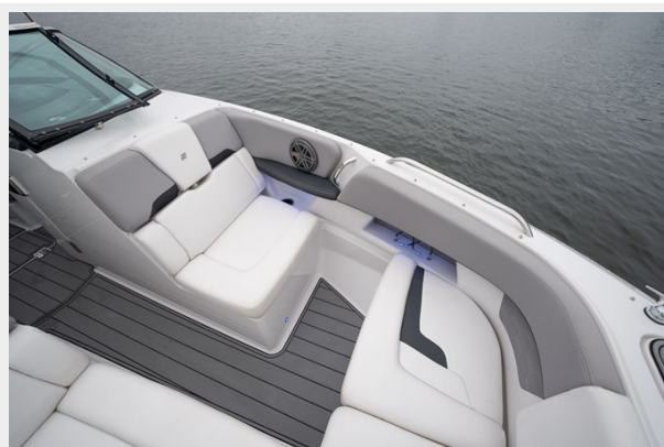
08. h290 port bow