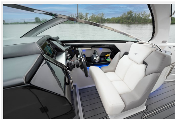
17. h290 Mercury 250 JPO