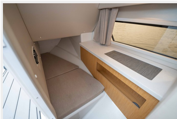
14. h290 cabin stbr