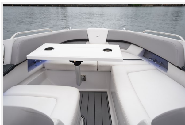
11. h290 bow table straight view