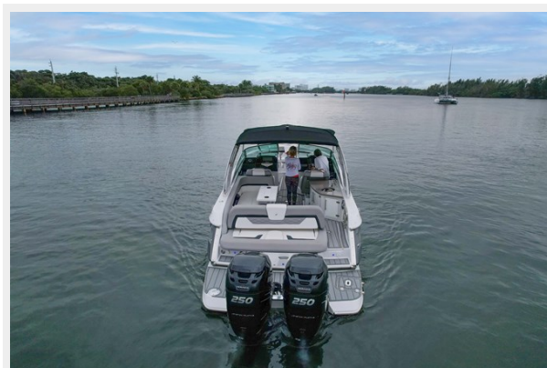
05. h290 aft view