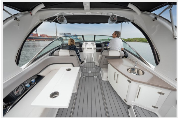
27. h290 wake tower light deck from swim platform to bow