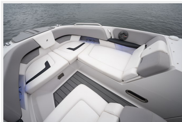
09. h290 stbr bow