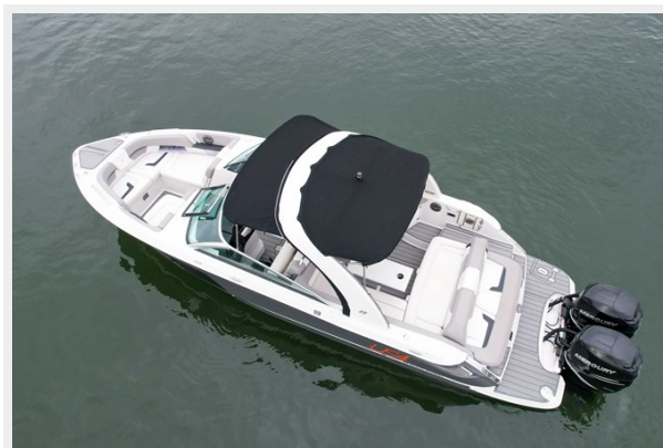
03. h290 top