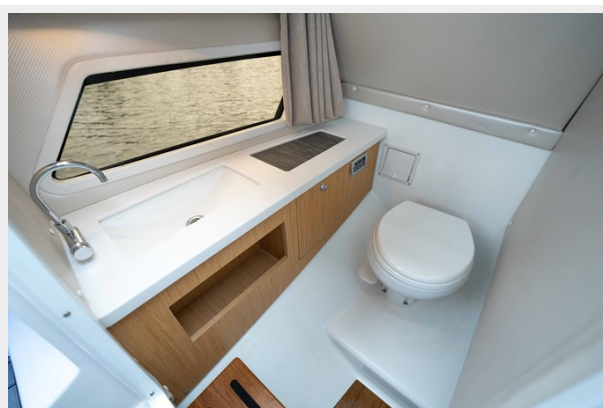
12. h290 port head overboard discharge