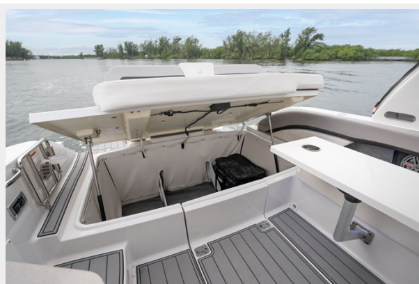
24. h290 trunk