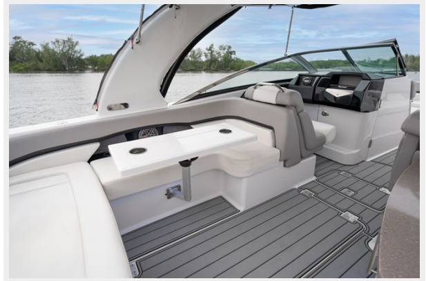
21. h290 cockpit table