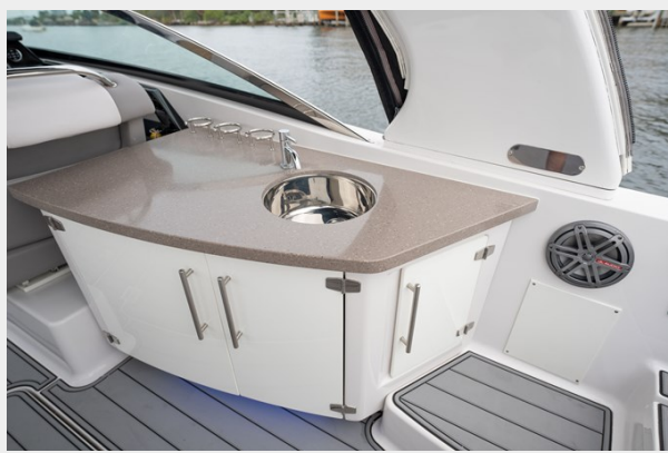
22. h290 cockpit galley