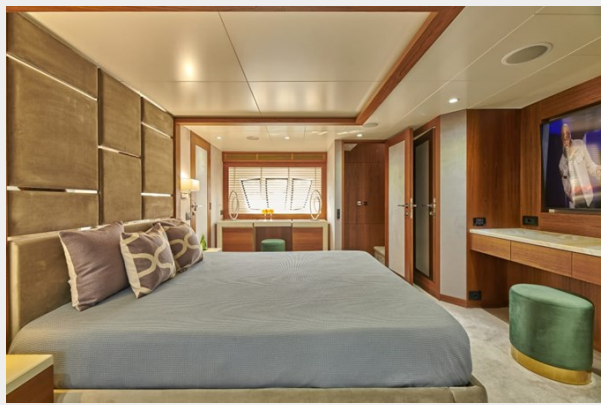
WhatsApp Image 2022-10-19 at 4.52.41 PM (1)