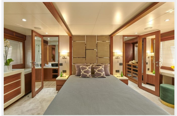
WhatsApp Image 2022-10-19 at 4.52.50 PM