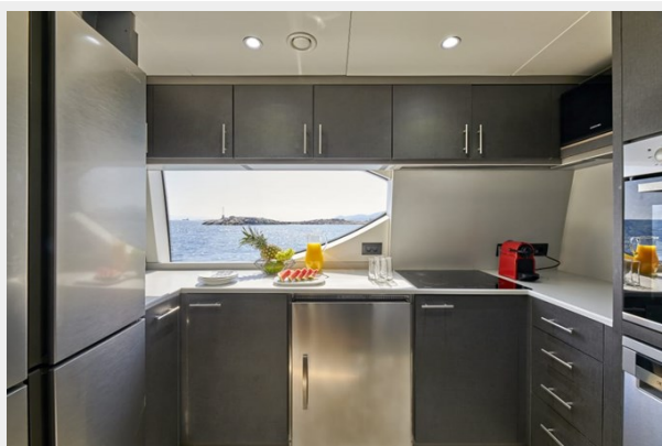
WhatsApp Image 2022-10-19 at 4.52.44 PM (1)