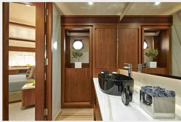
WhatsApp Image 2022-10-19 at 4.52.52 PM (1)