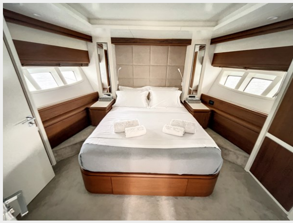
WhatsApp Image 2022-10-19 at 4.52.49 PM