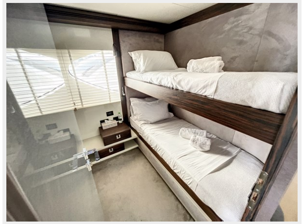
WhatsApp Image 2022-10-19 at 4.52.49 PM (1)