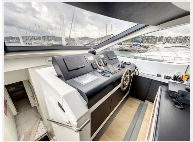
WhatsApp Image 2022-10-19 at 4.52.52 PM