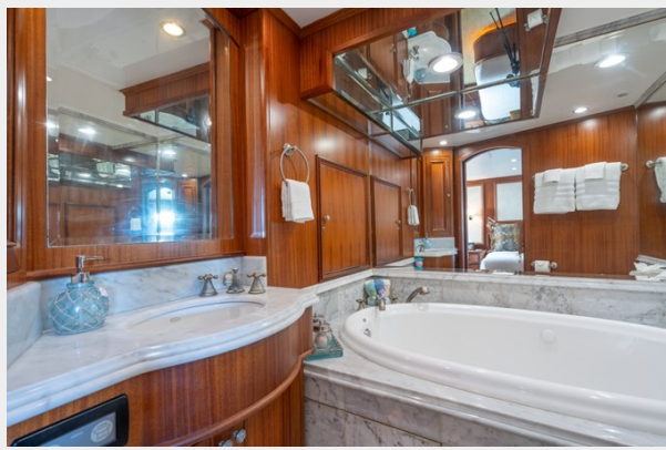
Owner's En-Suite Head