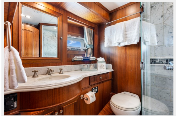
VIP En-Suite Head