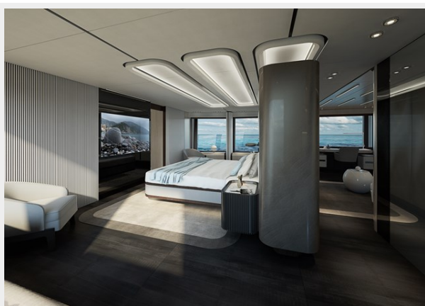
T604 Crossover42 Int F0025br