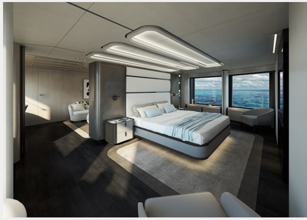
T604 Crossover42 Int F0028br