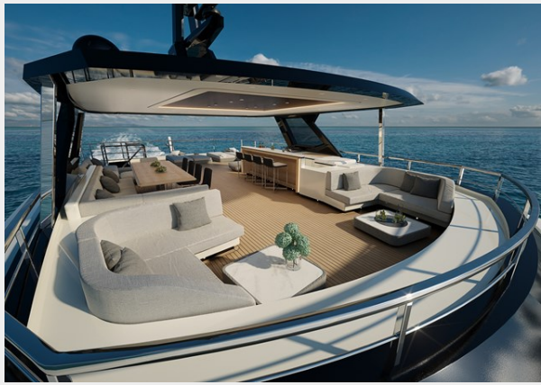
T604 Crossover42 F0180br