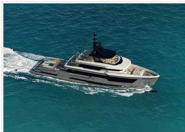
T604 Crossover42 F0005br