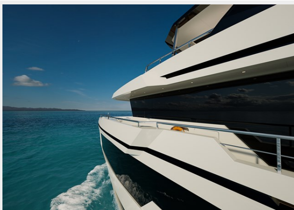
T604 Crossover42 F0186br