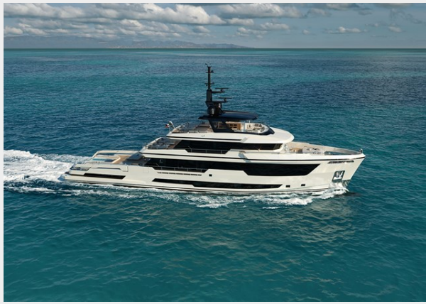
T604 Crossover42 F0108br