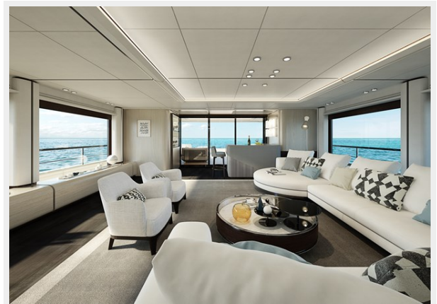
T604 Crossover42 Int F0200br