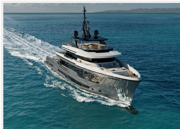
T604 Crossover42 F0002br