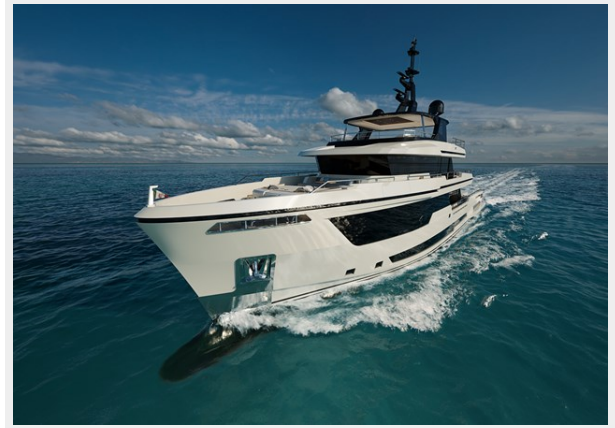
T604 Crossover42 F0163br