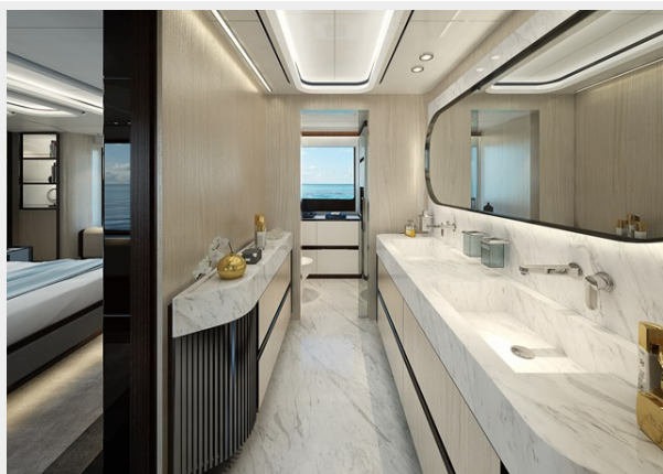
T604 Crossover42 Int F0030br