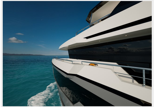
T604 Crossover42 F0086br