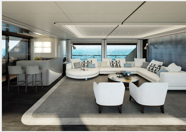
T604 Crossover42 Int F0209br