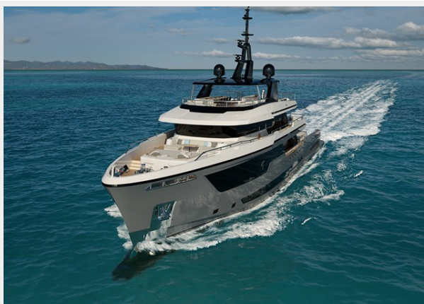
T604 Crossover42 F0043br