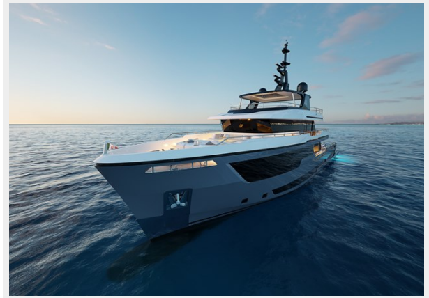
T604 Crossover42 F0337br