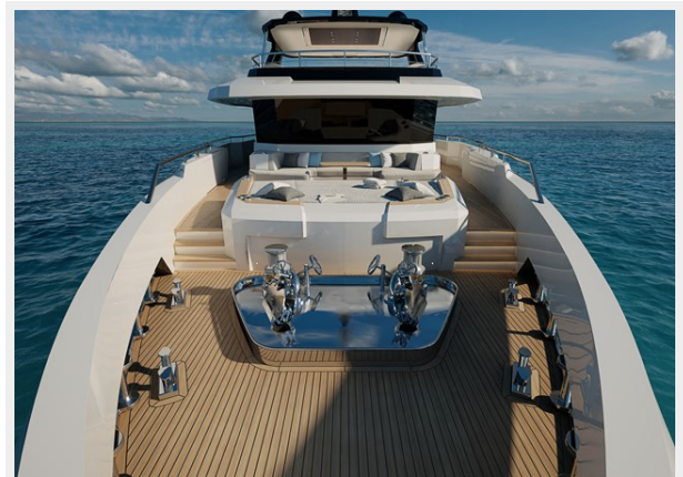
T604 Crossover42 F0047br