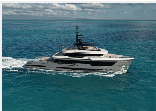
T604 Crossover42 F0008br