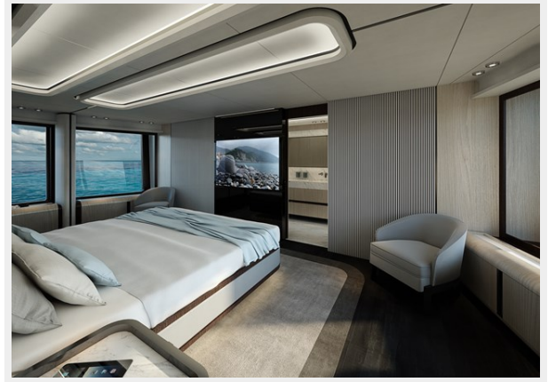
T604 Crossover42 Int F0029br