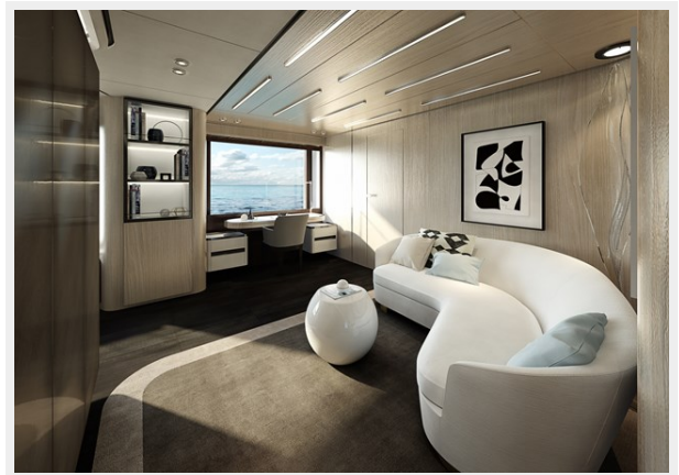
T604 Crossover42 Int F0024br