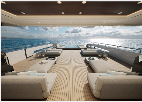
T604 Crossover42 F0059br