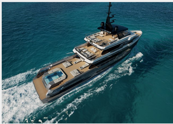
T604 Crossover42 F0020br