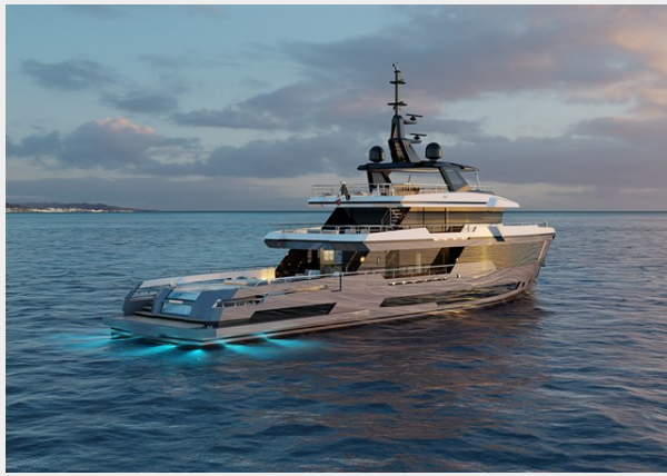
T604 Crossover42 F0316br