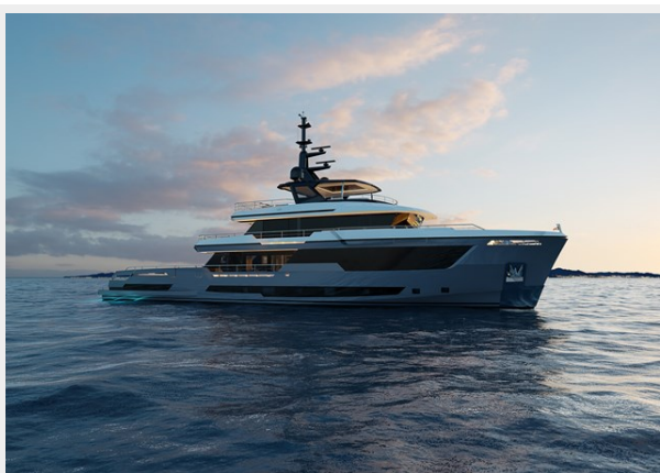
T604 Crossover42 F0309br