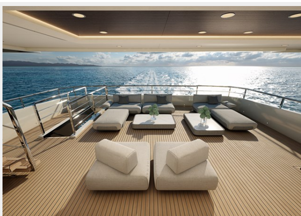
T604 Crossover42 F0170br