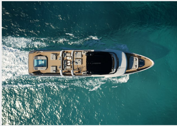
T604 Crossover42 F0011br