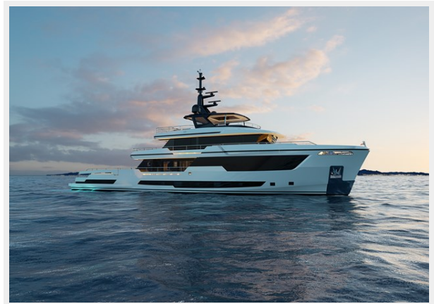
T604 Crossover42 F0409br