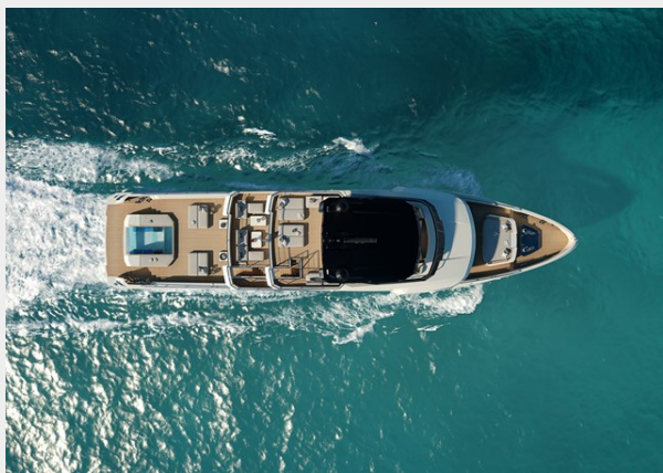
T604 Crossover42 F0111br