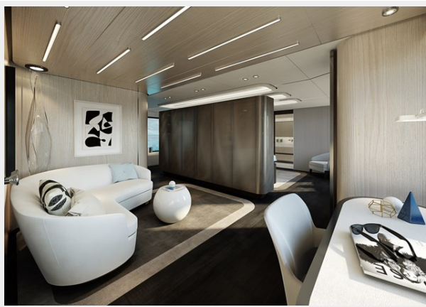
T604 Crossover42 Int F0022br