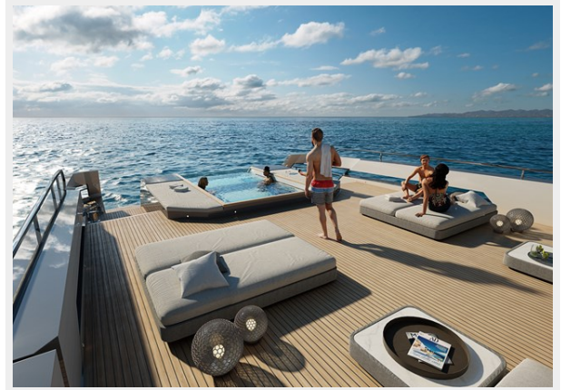
T604 Crossover42 F0061br