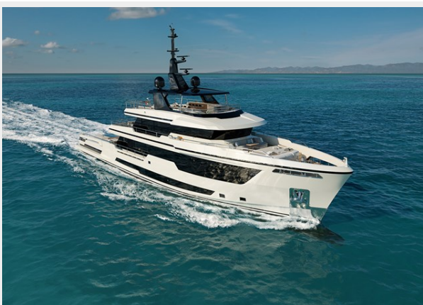
T604 Crossover42 F0104br