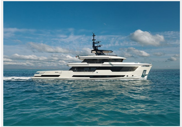
T604 Crossover42 F0110br