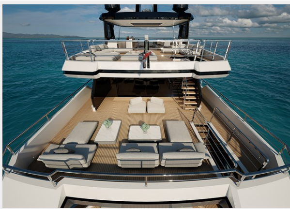
T604 Crossover42 F0067br