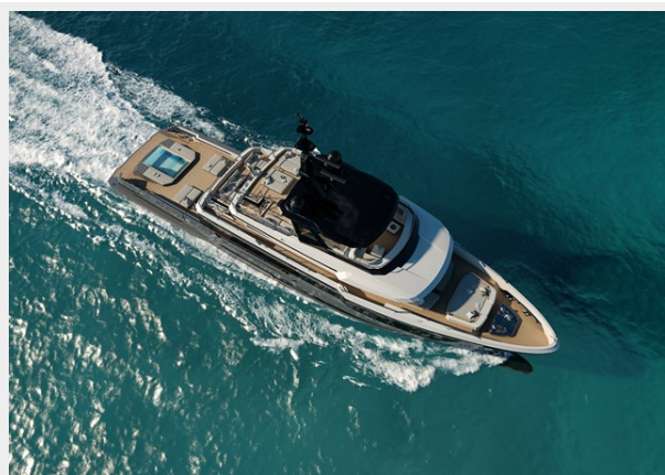
T604 Crossover42 F0000br