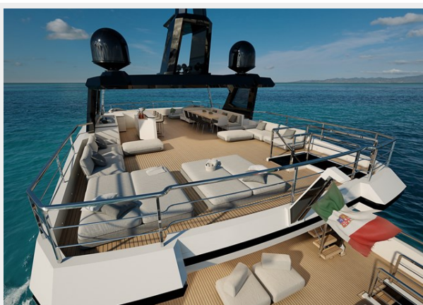
T604 Crossover42 F0075br