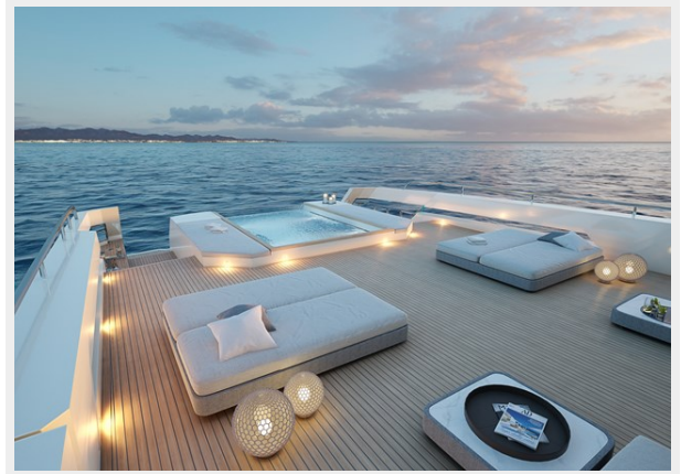
T604 Crossover42 F0461br