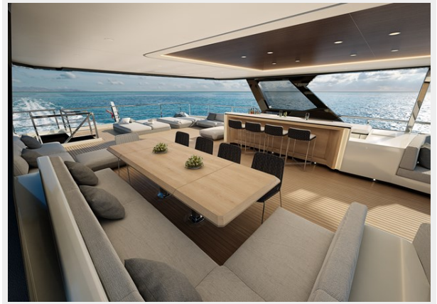
T604 Crossover42 F0182br