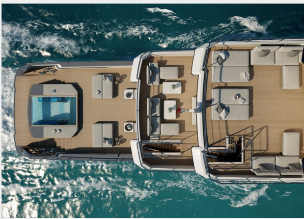
T604 Crossover42 F0090br