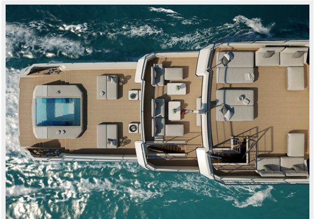
T604 Crossover42 F0190br