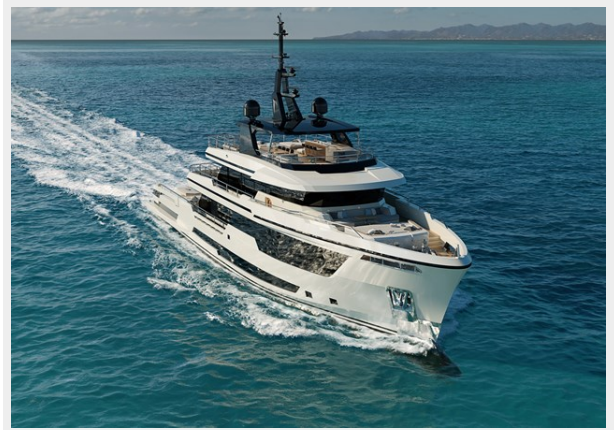
T604 Crossover42 F0102br