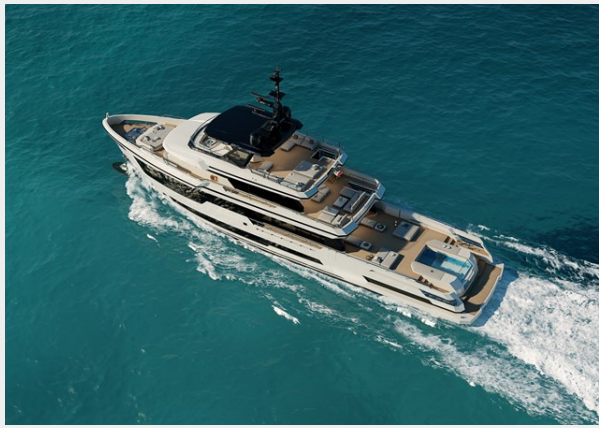
T604 Crossover42 F0134br