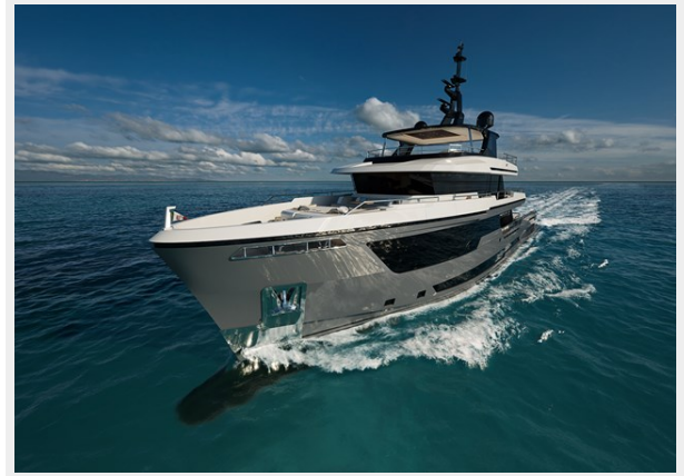
T604 Crossover42 F0037br