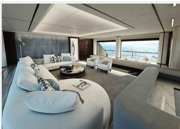
T604 Crossover42 Int F0203br