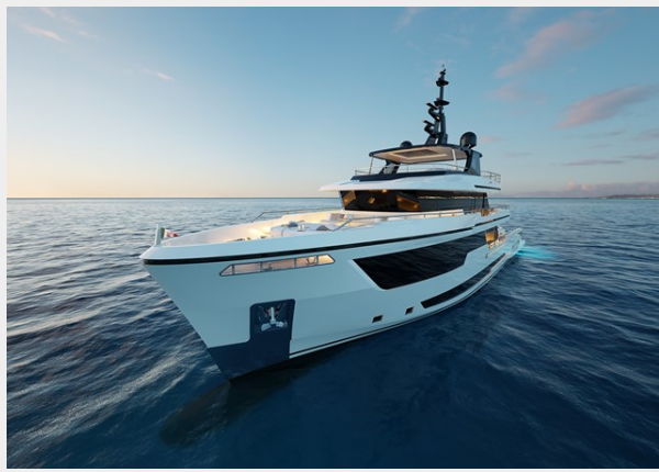
T604 Crossover42 F0437br