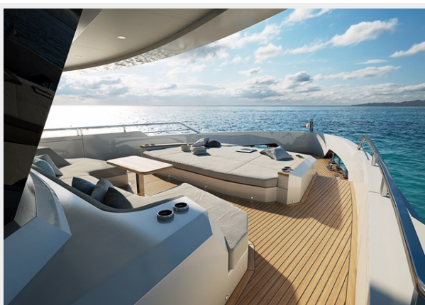
T604 Crossover42 F0050br