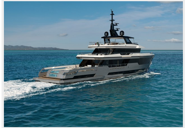
T604 Crossover42 F0016br