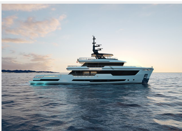
T604 Crossover42 F0410br