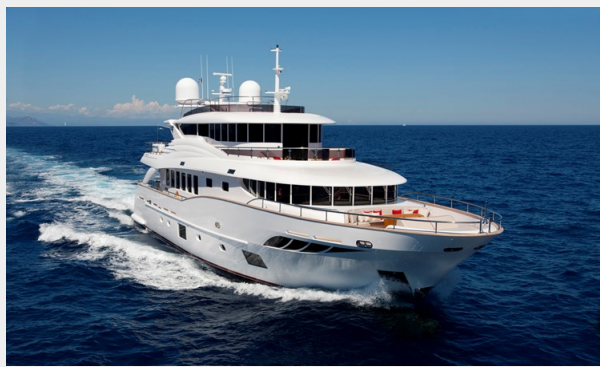
Filippetti Navetta 30- Cruising (6)