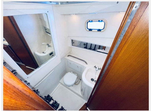
16_1999 31ft Cabo 31 Open SEA SQUIRREL 17_1999 31ft Cabo 31 Open SEA SQUIRREL