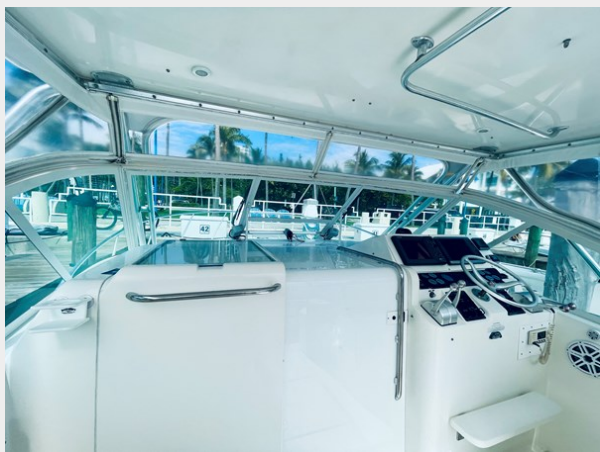
10_1999 31ft Cabo 31 Open SEA SQUIRREL