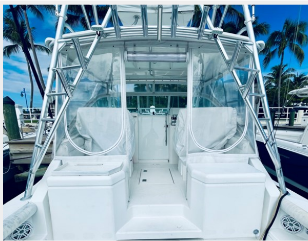
4_1999 31ft Cabo 31 Open SEA SQUIRREL