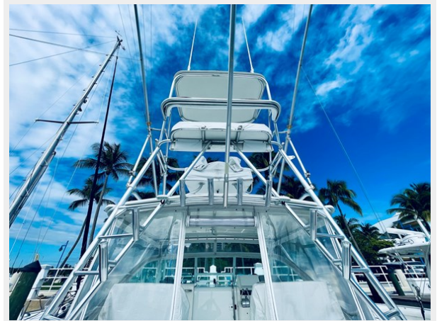
3_1999 31ft Cabo 31 Open SEA SQUIRREL