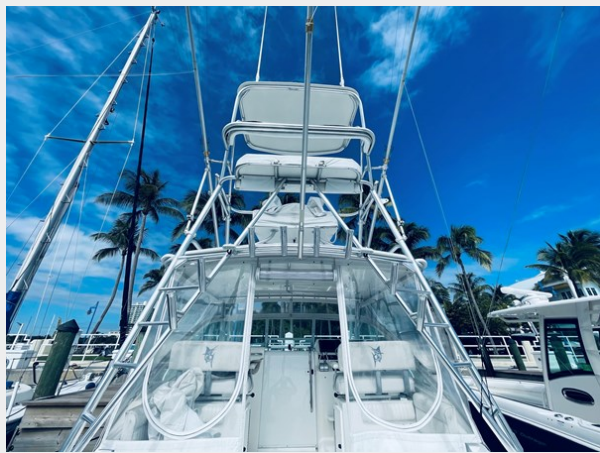
2_1999 31ft Cabo 31 Open SEA SQUIRREL