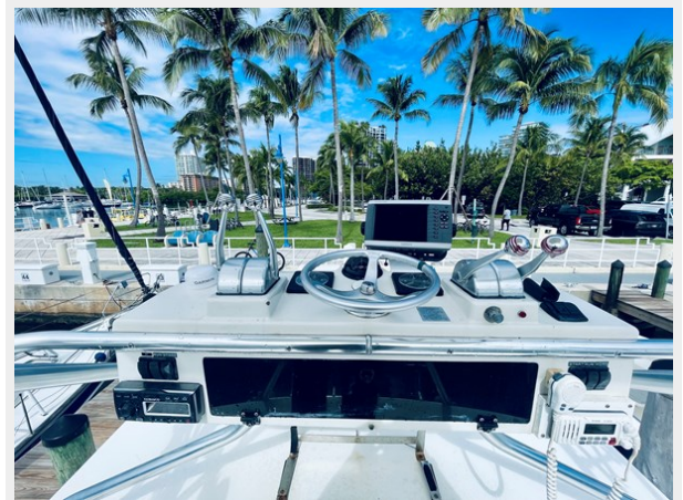
11_1999 31ft Cabo 31 Open SEA SQUIRREL