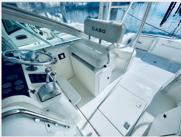
8_1999 31ft Cabo 31 Open SEA SQUIRREL