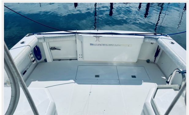
5_1999 31ft Cabo 31 Open SEA SQUIRREL