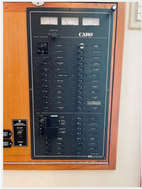
20_1999 31ft Cabo 31 Open SEA SQUIRREL