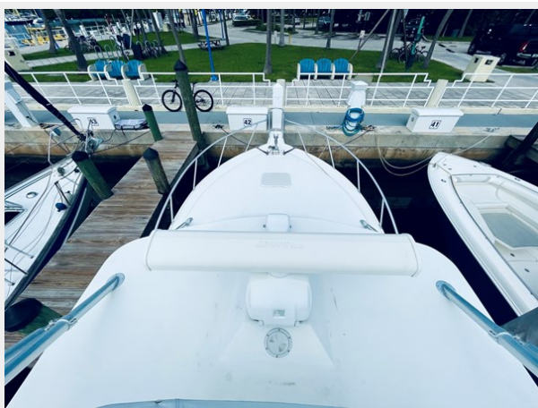
12_1999 31ft Cabo 31 Open SEA SQUIRREL