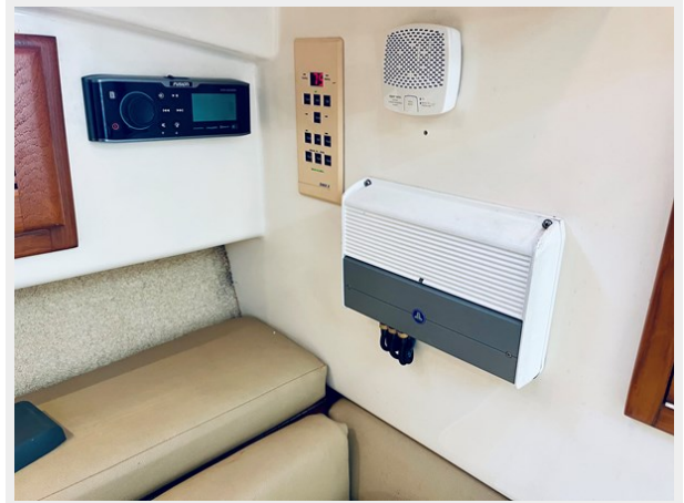
21_1999 31ft Cabo 31 Open SEA SQUIRREL