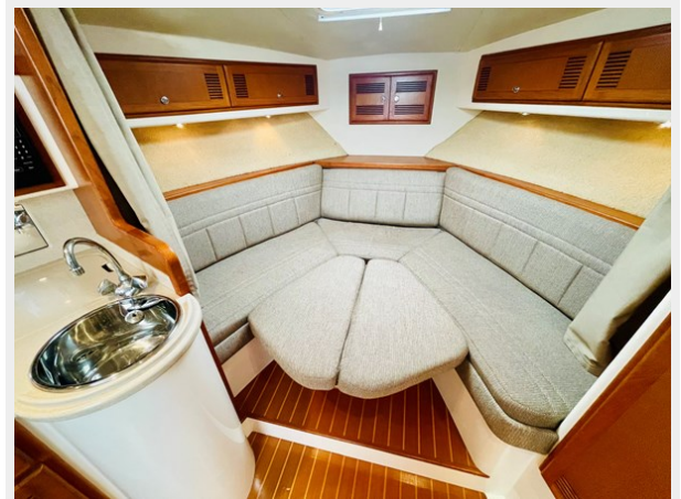
18_1999 31ft Cabo 31 Open SEA SQUIRREL 19_1999 31ft Cabo 31 Open SEA SQUIRREL