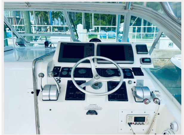
9_1999 31ft Cabo 31 Open SEA SQUIRREL