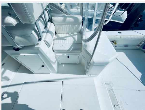
6_1999 31ft Cabo 31 Open SEA SQUIRREL