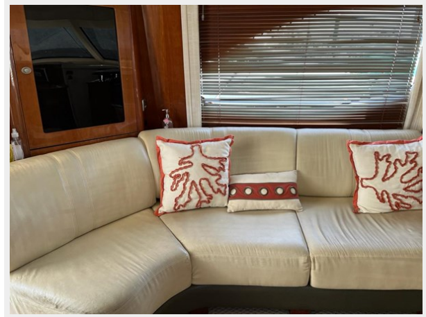
WhatsApp Image 2022-12-28 at 12.50.05 PM WhatsApp Image 2022-12-28 at 12.50.04 PM