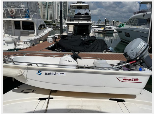
WhatsApp Image 2022-12-28 at 12.50.25 PM