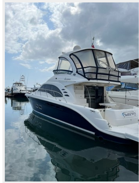
WhatsApp Image 2022-12-28 at 12.51.48 PM (2)