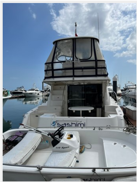
WhatsApp Image 2022-12-28 at 12.51.48 PM (1)