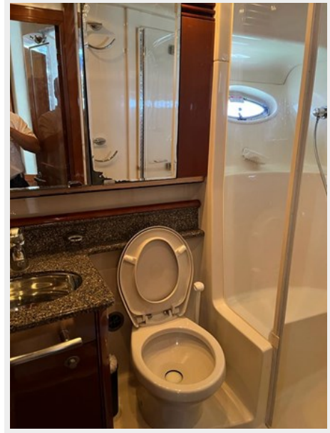
WhatsApp Image 2022-12-28 at 12.50.10 PM WhatsApp Image 2022-12-28 at 12.50.11 PM