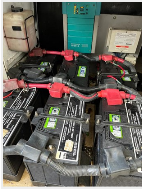
WhatsApp Image 2022-12-28 at 12.51.47 PM