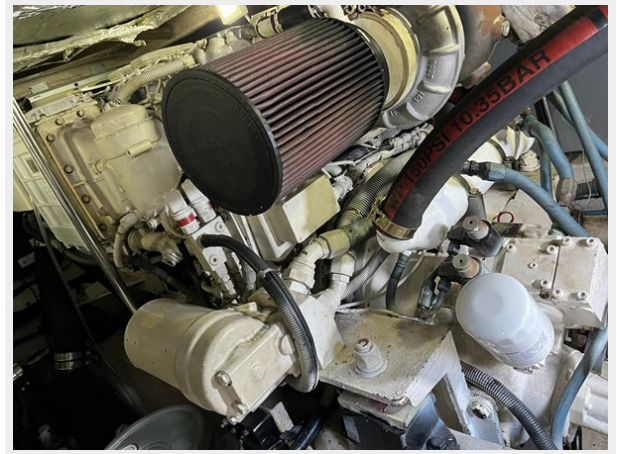
WhatsApp Image 2022-12-28 at 12.51.46 PM (1)