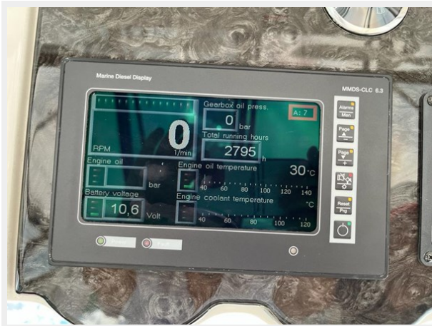
WhatsApp Image 2022-12-28 at 12.50.13 PM