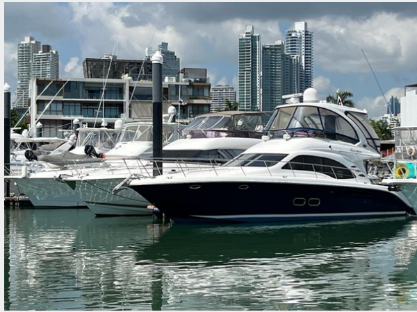
WhatsApp Image 2022-12-23 at 3.59.36 PM