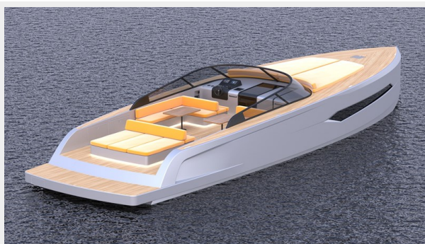
BEYAZ - TURUNCU