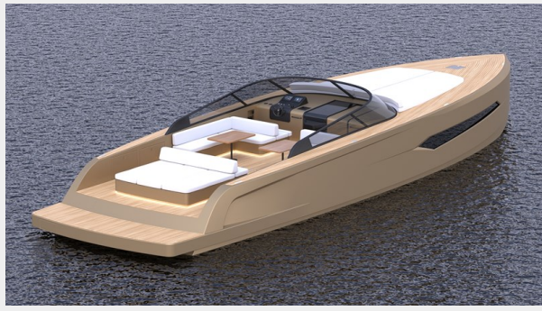
BEJ - BEYAZ