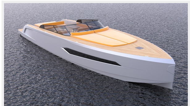
BEYAZ - TURUNCU 2