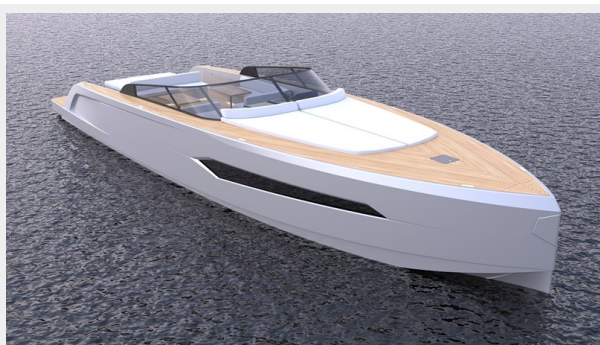
BEYAZ - BEYAZ 2