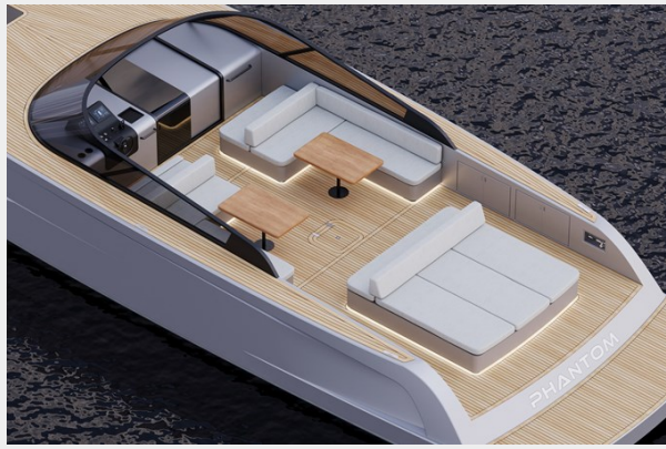
DMR62 Birdview bow port