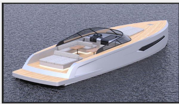
DMR 62 White & grey