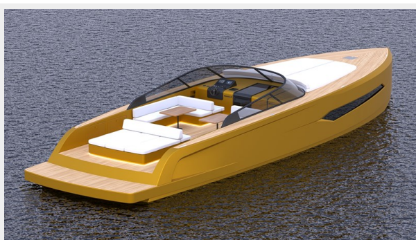
TURUNCU - BEYAZ 2