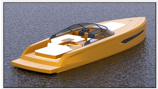
DMR 62 Orange & white