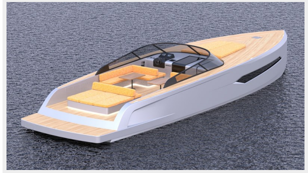
DMR 62 White & Orange