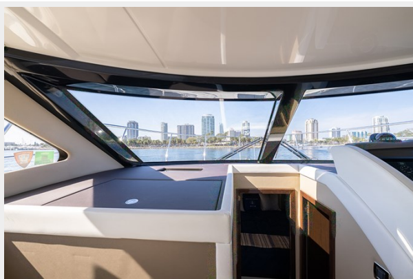
View from companion seat area