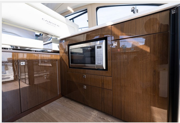
Galley storage area with convection microwave oven and grill