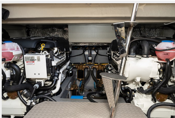
Engine room view 2