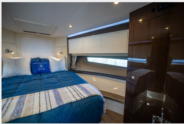
Stbd storage area in the master stateroom