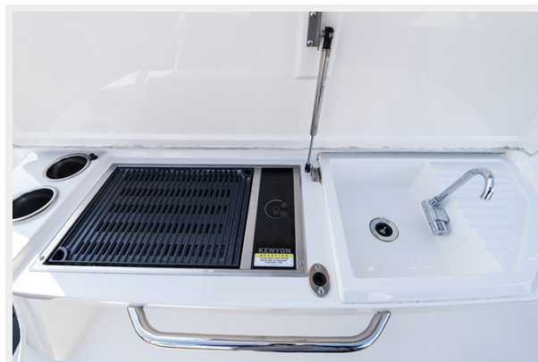
Grill with sink