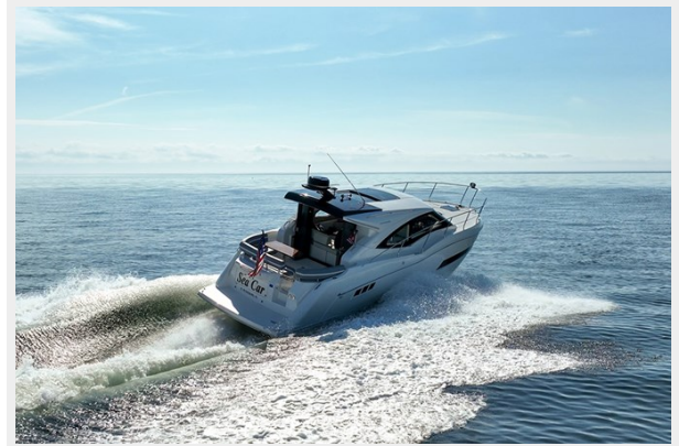
Stbd quarter profile underway