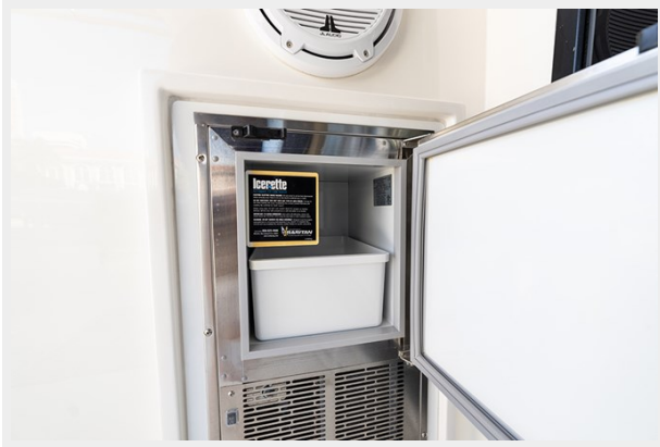
Cockpit ice maker view 2