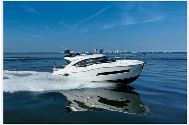
Stbd profile underway