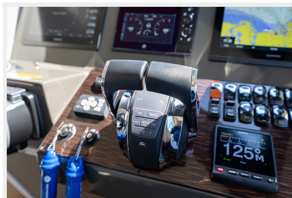
Mercury control console