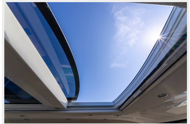
Retractable sunroof at the salon/galley area