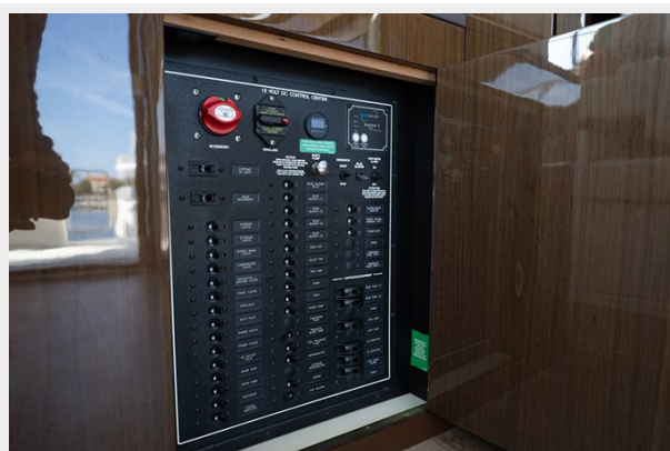
DC Control Center