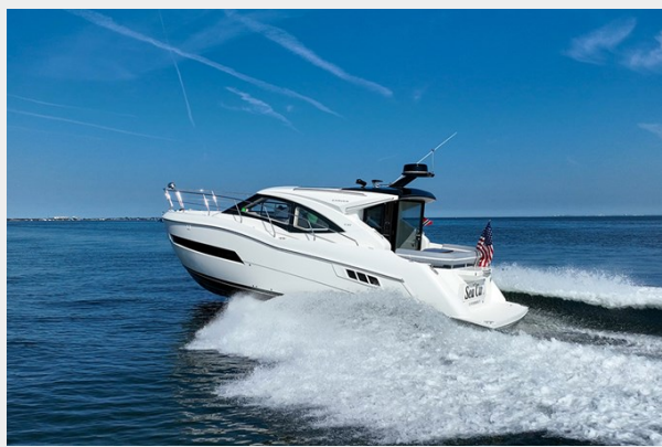
Port profile underway