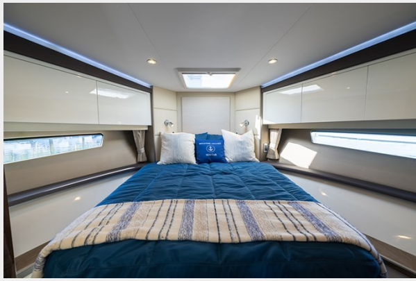
Master stateroom view 2