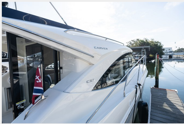
Stbd side deck