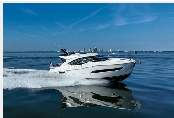
Stbd profile underway