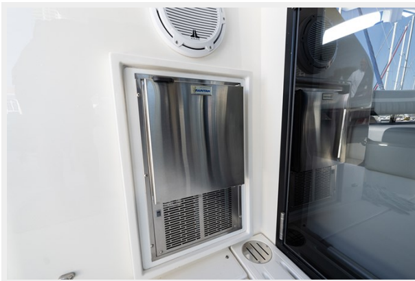
Cockpit ice maker