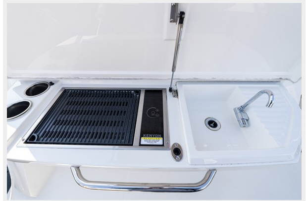
Grill with sink