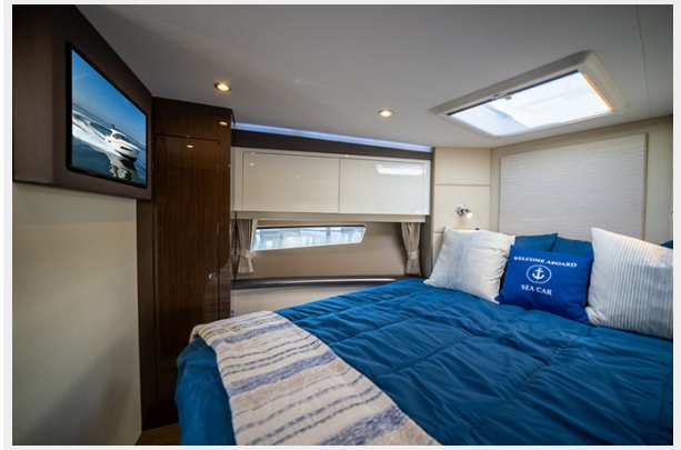
Port storage area in the master stateroom