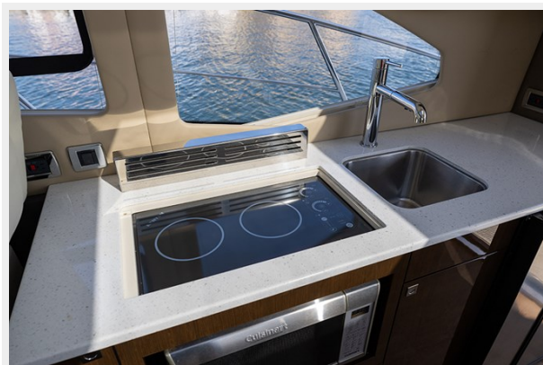
Kenyon stove top