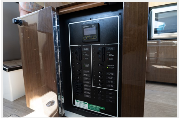
AC Control Center