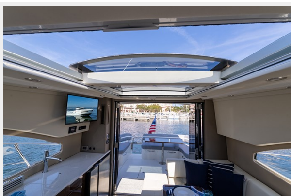
Retractable sunroof view 2