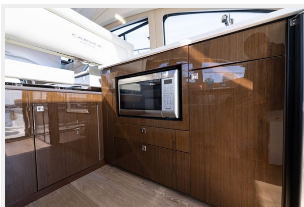
Galley storage area with convection microwave oven and grill