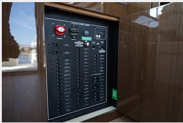
DC Control Center