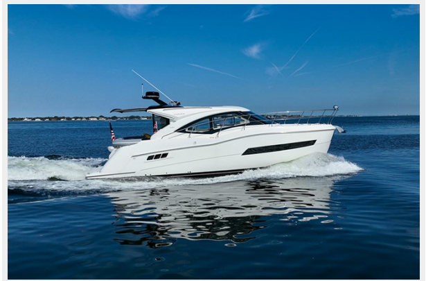
Stbd profile 4