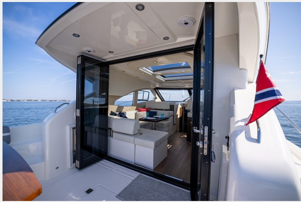
Entry to the salon/galley area