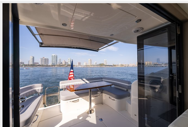
Cockpit view 2