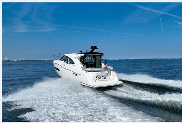
Port quarter profile underway