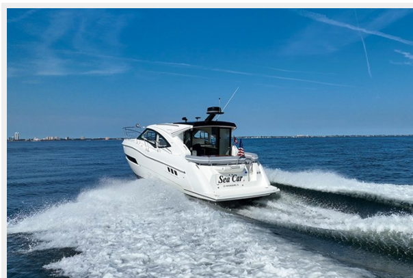
Port quarter profile underway