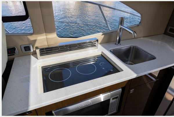
Kenyon stove top