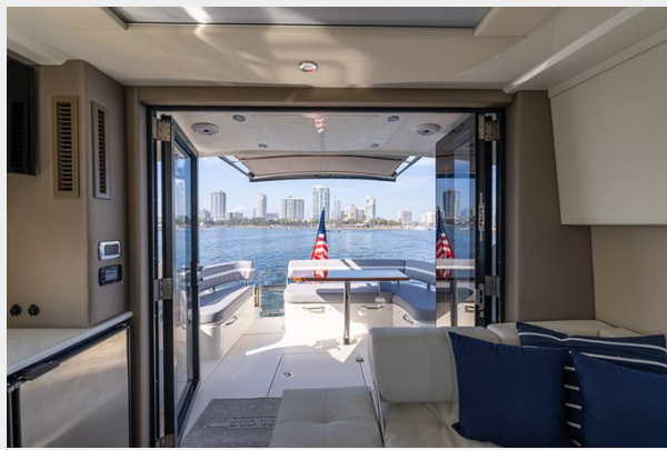
Cockpit view from salon