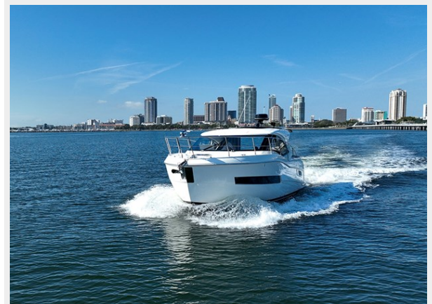
Port bow profile underway