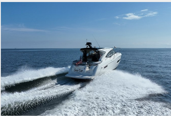
Stbd quarter profile