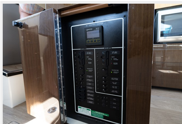
AC Control Center