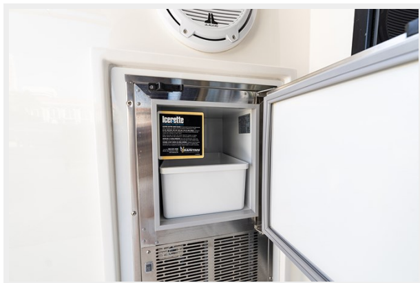
Cockpit ice maker view 2