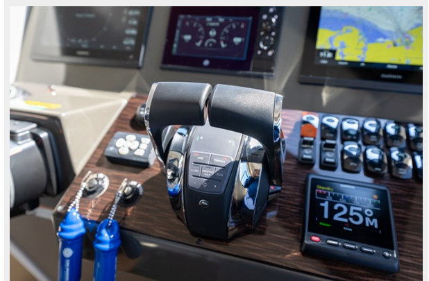
Mercury control console