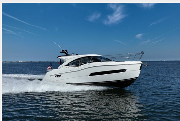
Stbd profile underway 2