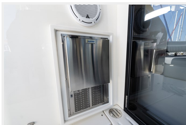
Cockpit ice maker