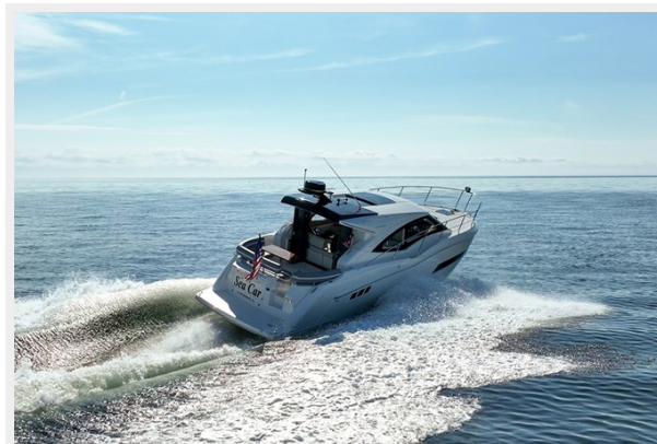
Stbd quarter profile underway