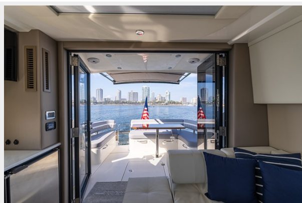
Cockpit view from salon