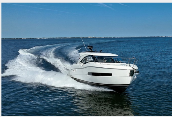
Stbd bow profile