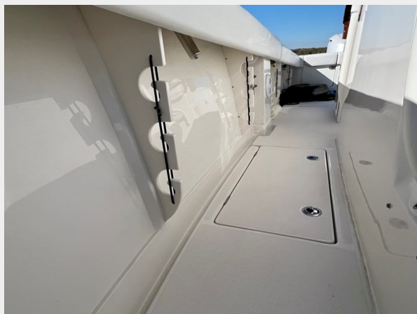
2020-JUPITER-32 HFS-West Palm Beach- FL-B61621-950973