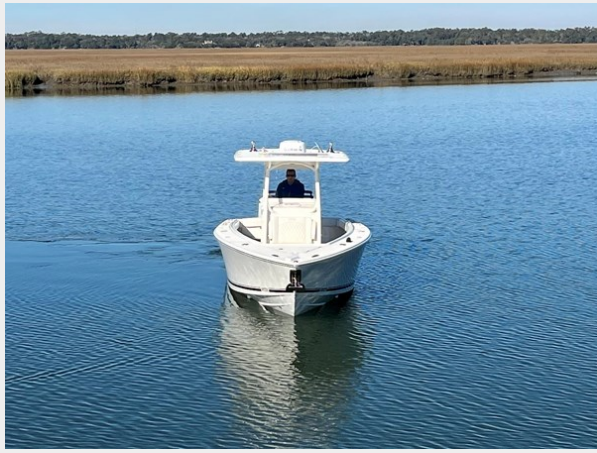
2020-JUPITER-32 HFS-West Palm Beach- FL-B61621-950953