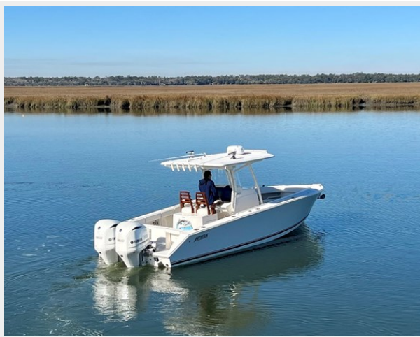
2020-JUPITER-32 HFS-West Palm Beach- FL-B61621-950959