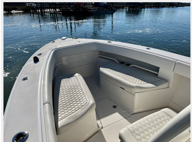
2020-JUPITER-32 HFS-West Palm Beach- FL-B61621-950970