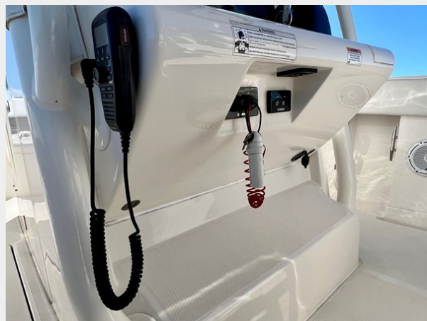
2020-JUPITER-32 HFS-West Palm Beach- FL-B61621-950960