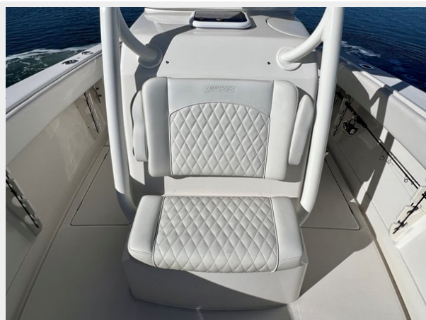
2020-JUPITER-32 HFS-West Palm Beach- FL-B61621-950961