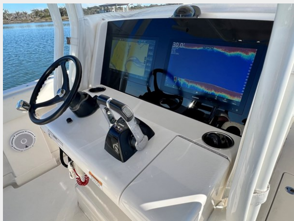
2020-JUPITER-32 HFS-West Palm Beach- FL-B61621-950988