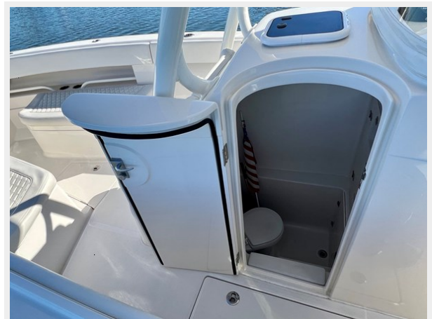
2020-JUPITER-32 HFS-West Palm Beach- FL-B61621-950987