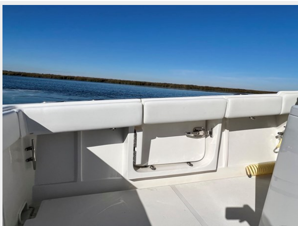
2020-JUPITER-32 HFS-West Palm Beach- FL-B61621-950979