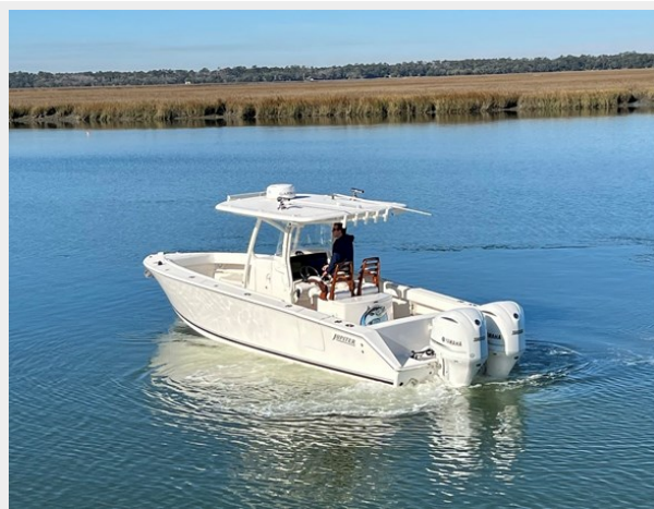
2020-JUPITER-32 HFS-West Palm Beach- FL-B61621-950955