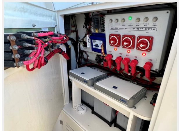
2020-JUPITER-32 HFS-West Palm Beach- FL-B61621-950990