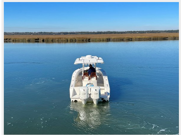
2020-JUPITER-32 HFS-West Palm Beach- FL-B61621-950958