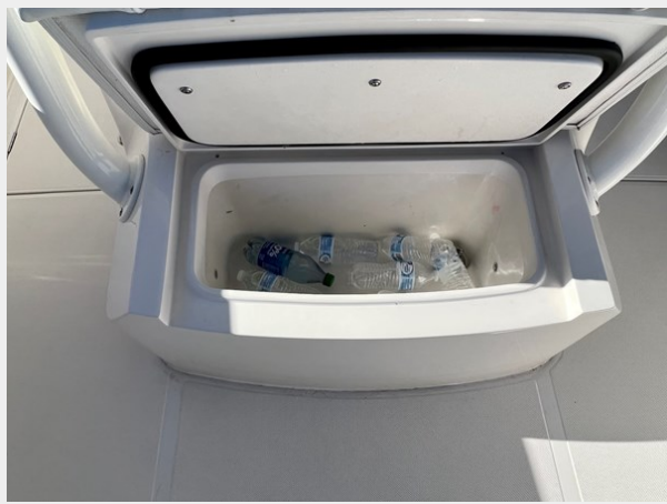
2020-JUPITER-32 HFS-West Palm Beach- FL-B61621-950967