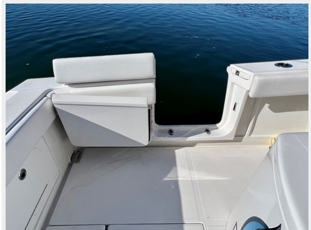
2020-JUPITER-32 HFS-West Palm Beach- FL-B61621-950980