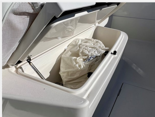
2020-JUPITER-32 HFS-West Palm Beach- FL-B61621-950964