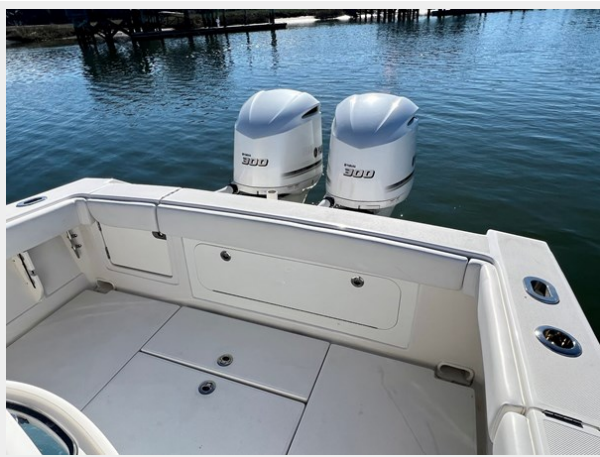
2020-JUPITER-32 HFS-West Palm Beach- FL-B61621-950986