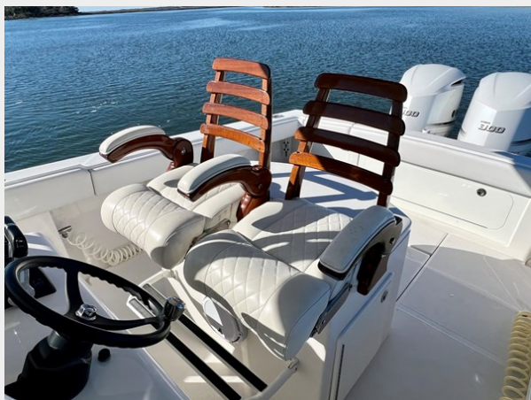
2020-JUPITER-32 HFS-West Palm Beach- FL-B61621-950972