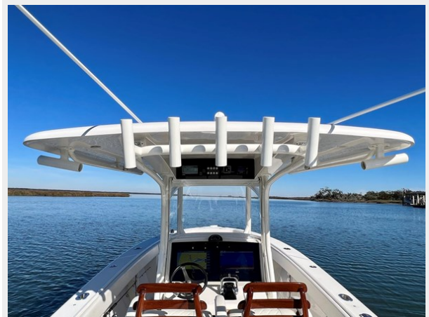
2020-JUPITER-32 HFS-West Palm Beach- FL-B61621-950962