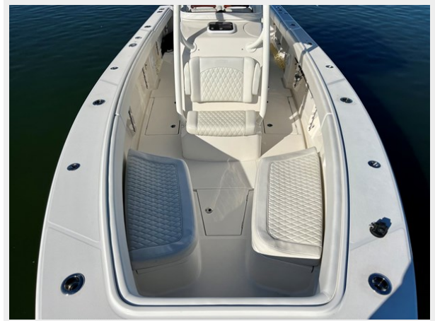
2020-JUPITER-32 HFS-West Palm Beach- FL-B61621-950969