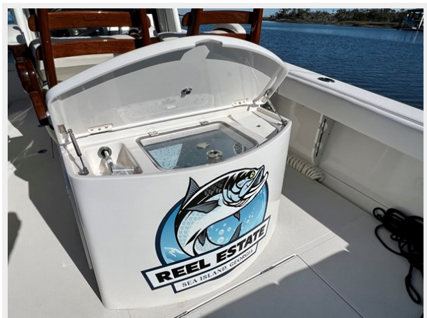
2020-JUPITER-32 HFS-West Palm Beach- FL-B61621-950975