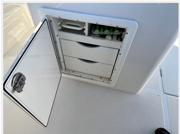
2020-JUPITER-32 HFS-West Palm Beach- FL-B61621-950978