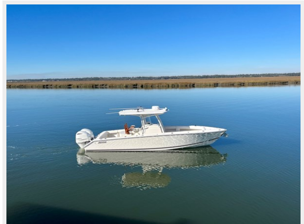
2020-JUPITER-32 HFS-West Palm Beach- FL-B61621-950985