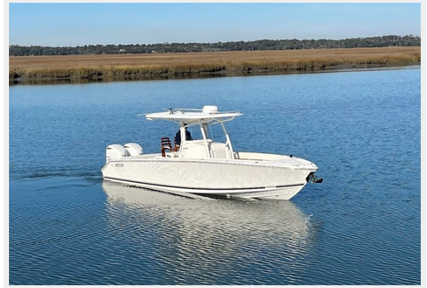
2020-JUPITER-32 HFS-West Palm Beach- FL-B61621-950954