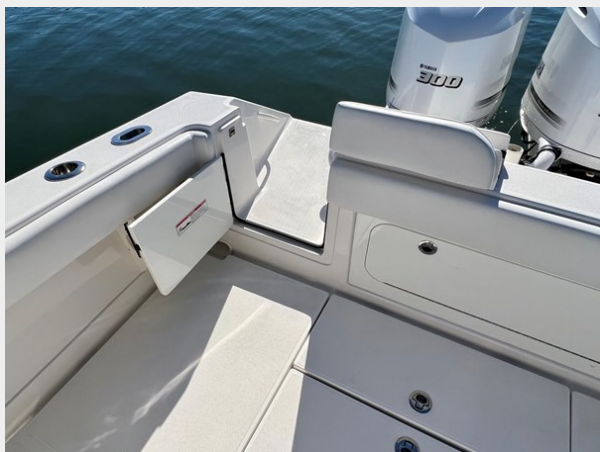
2020-JUPITER-32 HFS-West Palm Beach- FL-B61621-950981