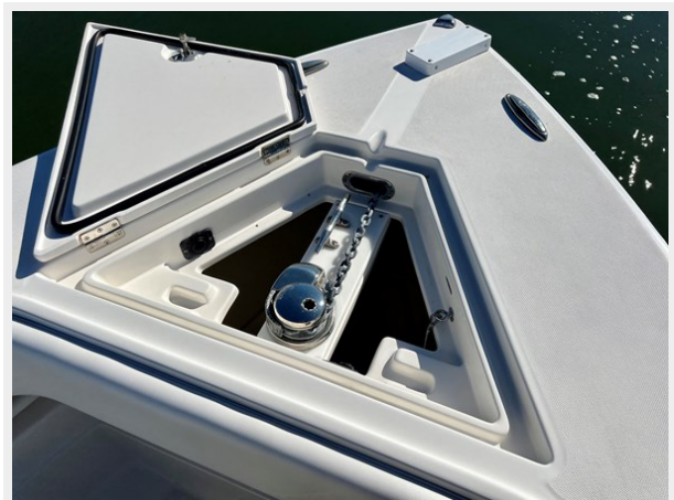
2020-JUPITER-32 HFS-West Palm Beach- FL-B61621-950963