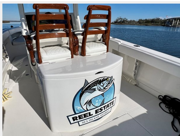
2020-JUPITER-32 HFS-West Palm Beach- FL-B61621-950982