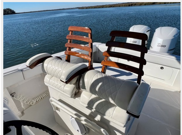
2020-JUPITER-32 HFS-West Palm Beach- FL-B61621-950983