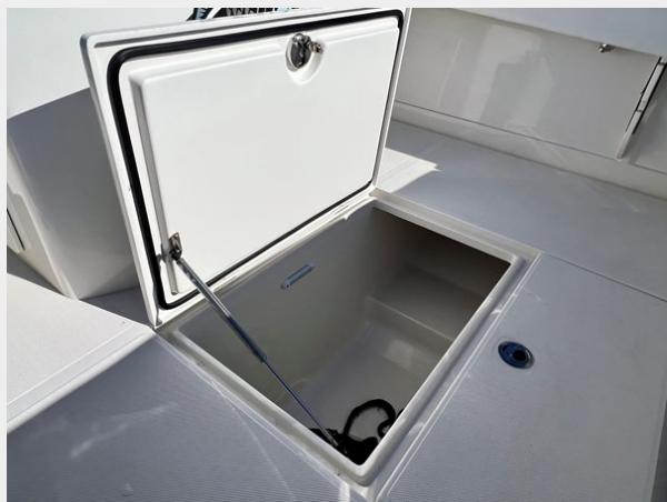
2020-JUPITER-32 HFS-West Palm Beach- FL-B61621-950993