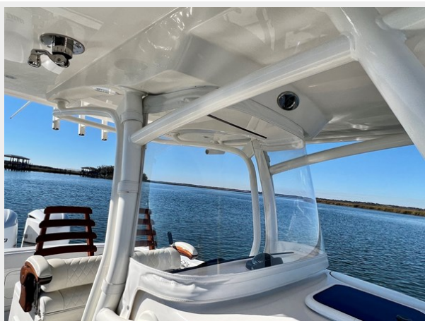
2020-JUPITER-32 HFS-West Palm Beach- FL-B61621-950991