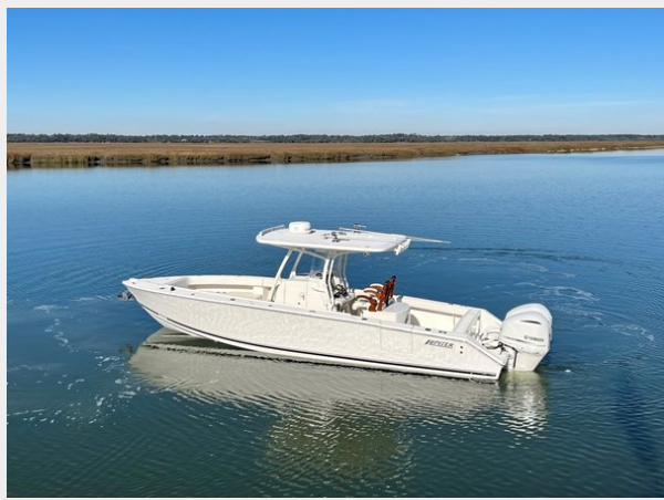
2020-JUPITER-32 HFS-West Palm Beach- FL-B61621-950957