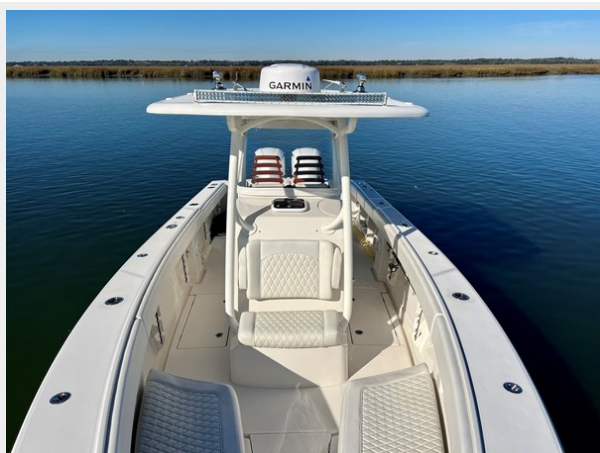
2020-JUPITER-32 HFS-West Palm Beach- FL-B61621-950992