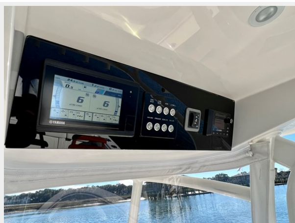
2020-JUPITER-32 HFS-West Palm Beach- FL-B61621-950974