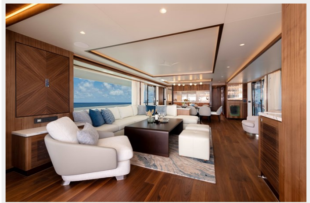
Forward facing salon with detailed custom wood work.