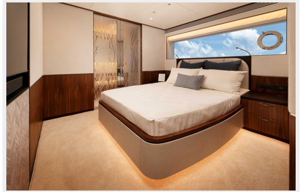
Mirror VIP with etched glass pocket doors to head.