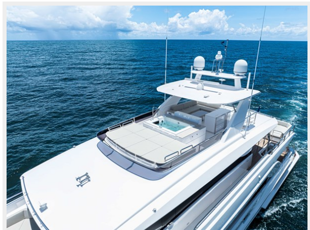
Tri deck with hot tub and sunpad