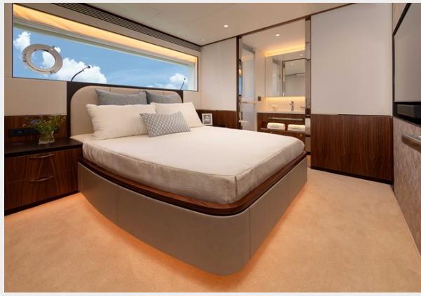
Mirror VIP with larger windows.