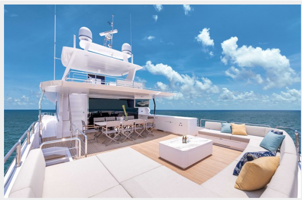
Boat deck with U shaped seating and blue decor pillows.