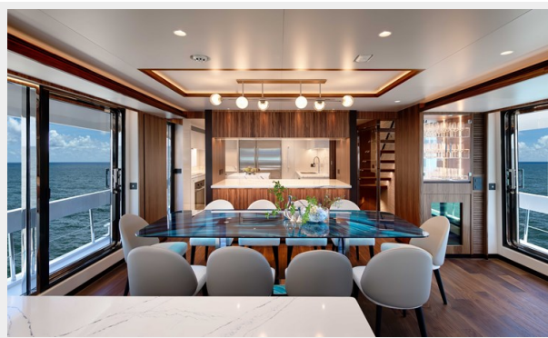
Dining area with featured lighting and open galley.