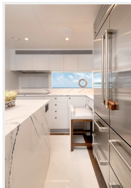
Hidden chefs chair in galley.