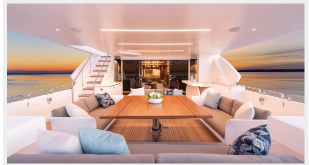
Aft deck facing forward into salon with large entertaining space.