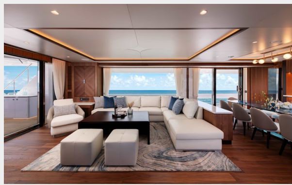
Salon with couch, coffee table and custom rug.