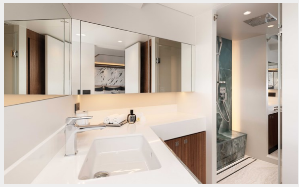
His and hers master bath with walkin shower.