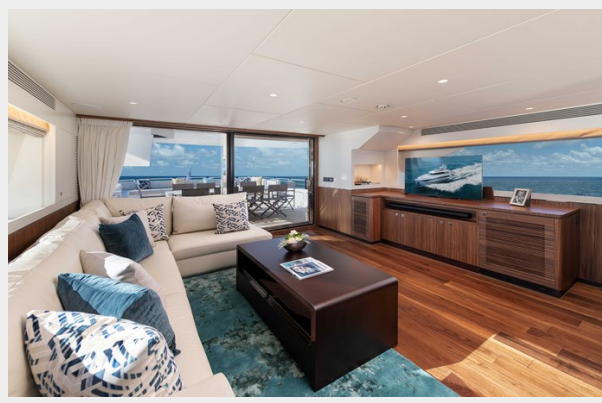
Pilothouse with high low TV and coffee table.