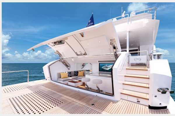
Beach club with bar, seating and TV.