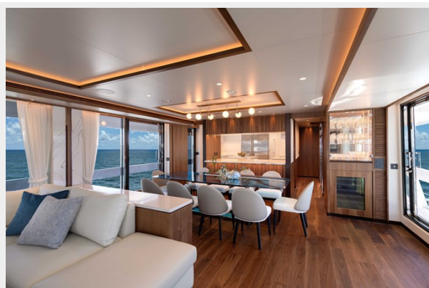
Dining area with open galley.