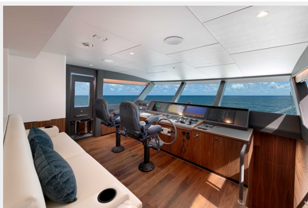
Pilothouse with sofa and large windows.