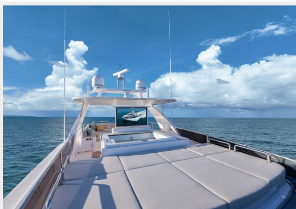
Large tri-deck with 55 inch TV and entertaining space.