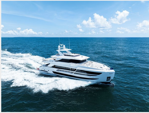
Aerial photo of FD100 Hull 11 running over the open ocean.