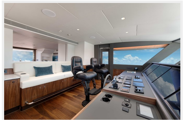
Pilothouse with two STIDD chairs and full helm.