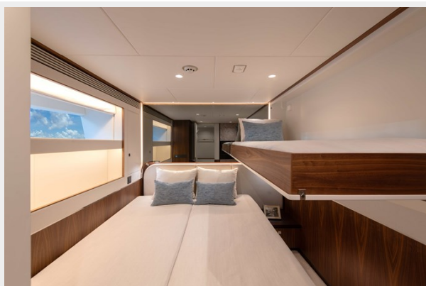
Guest stateroom with sliding beds and pocket door.