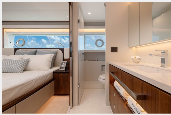
VIP bathroom with pocket doors and wet head.