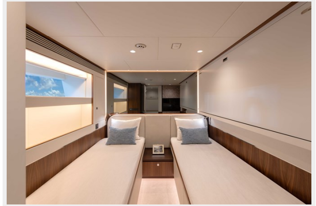
Guest stateroom with open sliding beds.