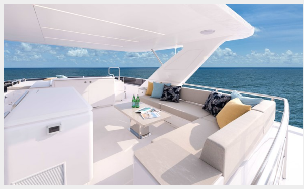
Tri deck with L shaped seating and storage.