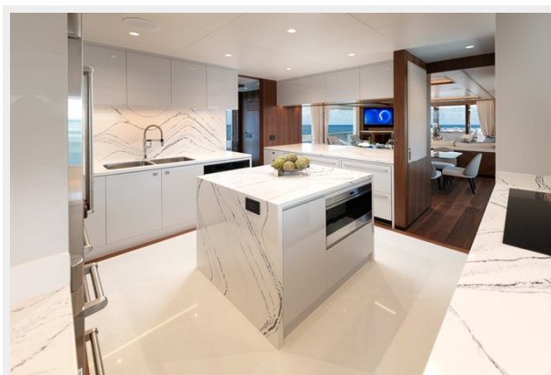
Galley with waterfall island and sinks.