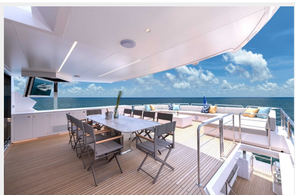
Large entertaining space on the boat deck.