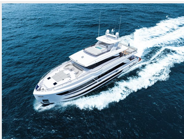
Running bow photo with sunpads.