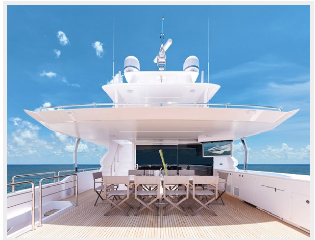
Formal seating for 10 on the boat deck.