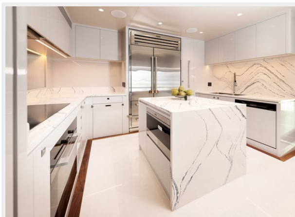
Large galley with beautiful Cambria Quartz.