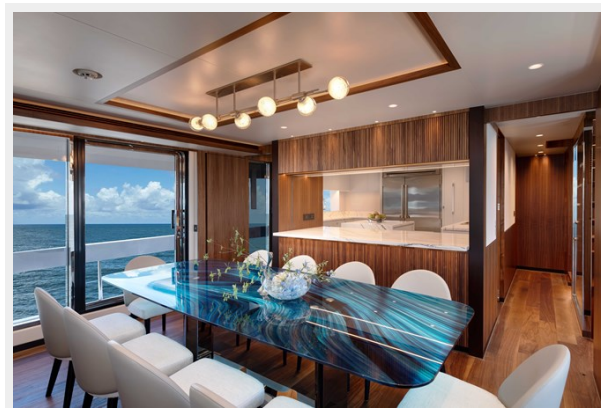
Forlam dining for 10 around hand painted dining table.