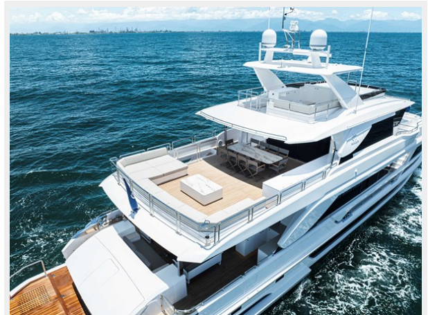
Boat deck with U shaped seating and table.