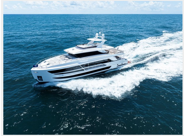
FD100 Hull 11 cruising over the open ocean.