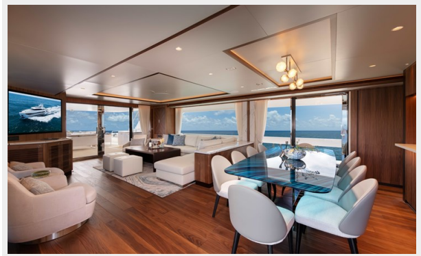
Aft facing salon with TV and seating.