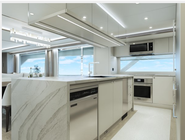
3D rendering of galley island with stone countertops.