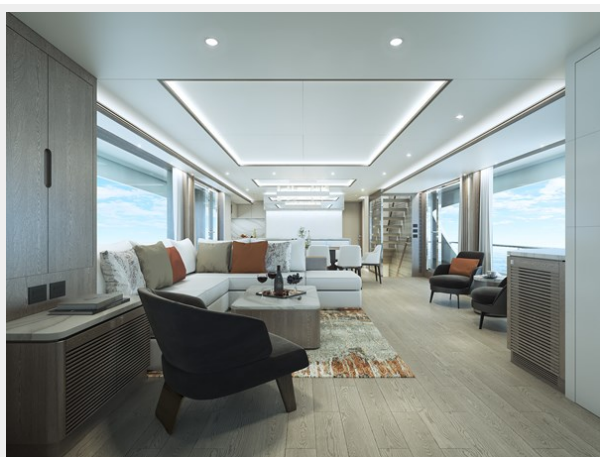
FD90 3D rendering of salon with open floorplan.