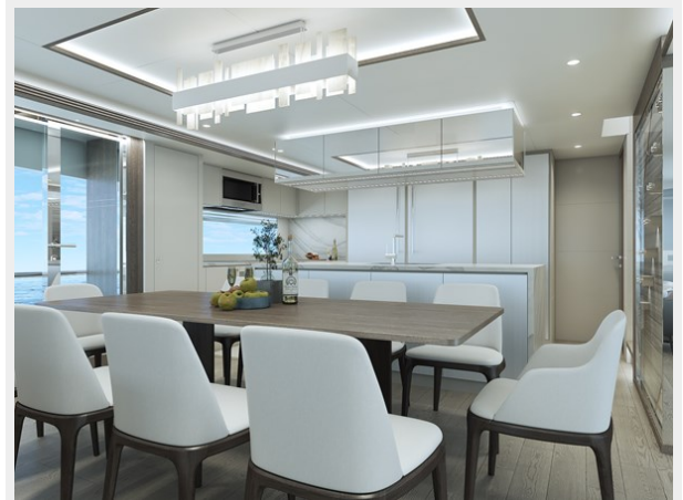
3D rendering of dining area looking into open galley.