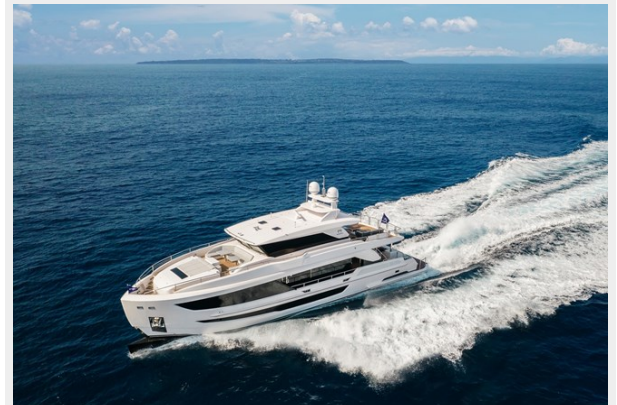
Horizon FD90 Sister Ship