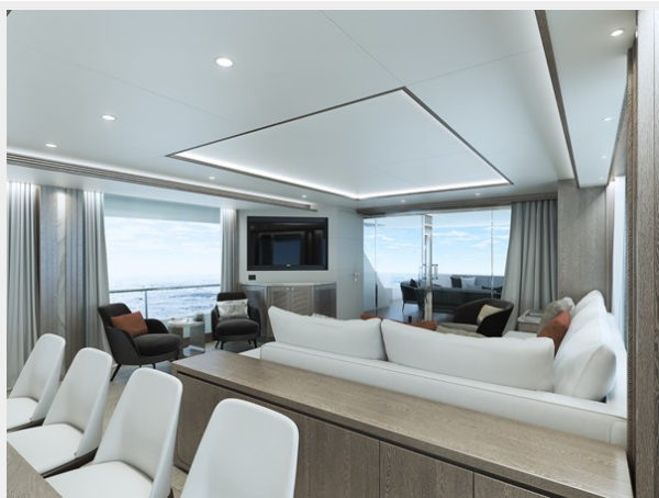
3D rendering of salon with TV and large storage cabinet.