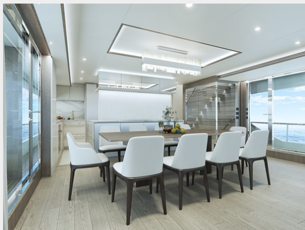
3D rendering of formal dining for 10 and elegant chandelier.