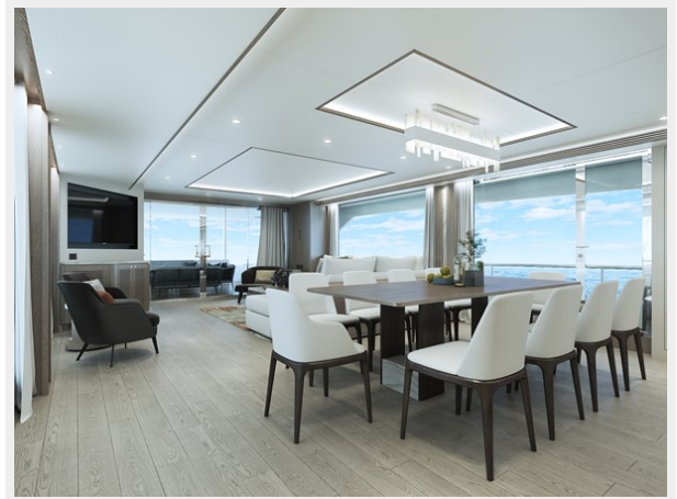
3D rendering of aft facing salon with TV.