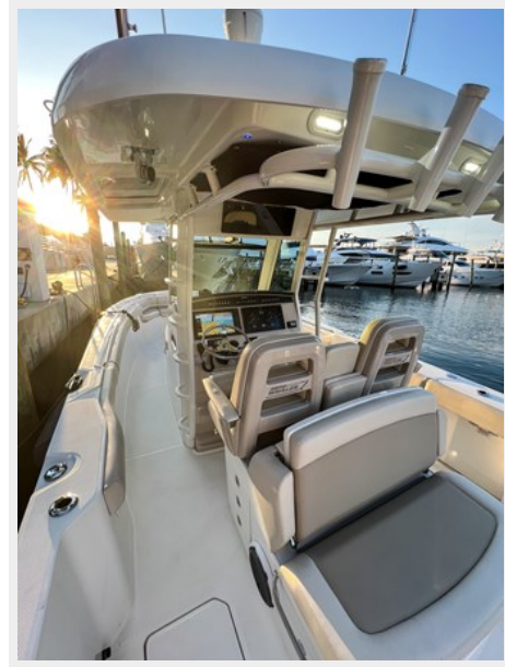
Port side deck