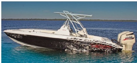
Built at the Glasstream yard in Panama City, Florida, the 280 ZS is a combination angling and pleasure center console that offers high-end performance with fishing amenities. The boat's stepped-bottom hull offers more deadrise at the transom and runs more than 70 mph when equipped with twin Suzuki DF300AP 300-horsepower engines. Power options range from the big Suzuki engines down to smaller 150-hp outboards, which still offer good performance and provide the safety of twin engines. Measuring 27-feet, 8-inch long, the Glasstream 280 ZS on display at the 2014 Miami International Boat Show was rigged with Suzuki Precision Maneuvering that allows the driver to dock with ease through joystick control.