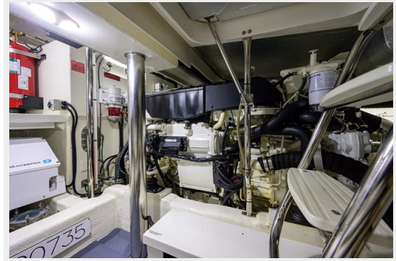
E12 Engine Room_Riviera_Finnish_Strong