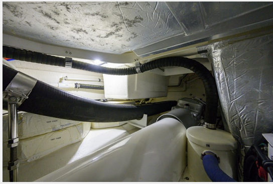
E14 Engine Room_Riviera_Finnish_Strong