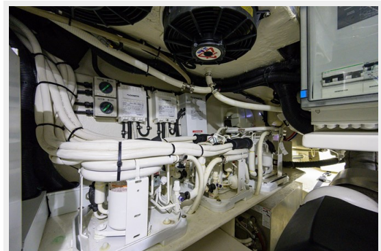
E9 Engine Room_Riviera_Finnish_Strong