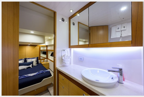
Master Stateroom Head Riviera Finnish Strong