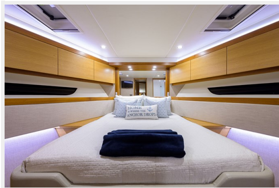
FS2 Forward Stateroom_Riviera_Finnish_Strong