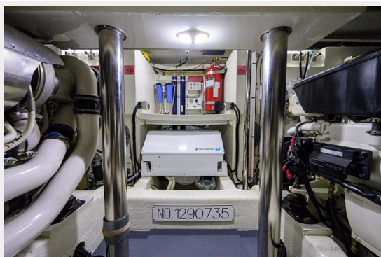
E11 Engine Room_Riviera_Finnish_Strong