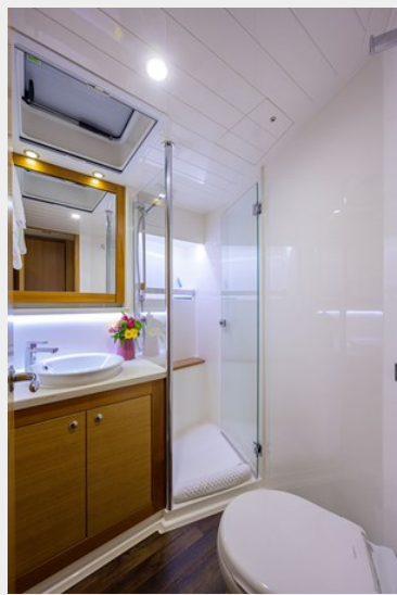
FH2 Forward Head Riviera Finnish Strong