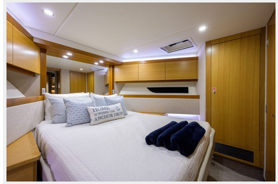
FS5 Forward Stateroom Riviera Finnish Strong