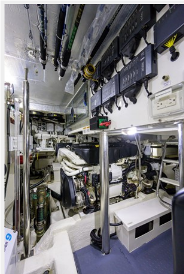
E6 Engine Room_Riviera_Finnish_Strong copy