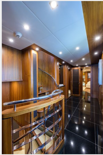
Main Deck Foyer