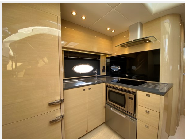
16 - Princess V48 Galley