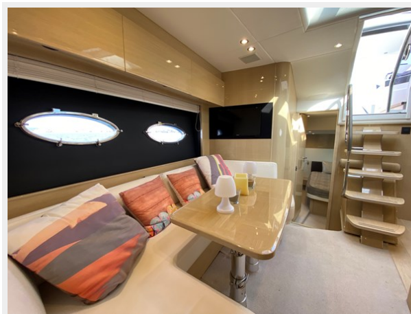
15 - Princess V48 Salon