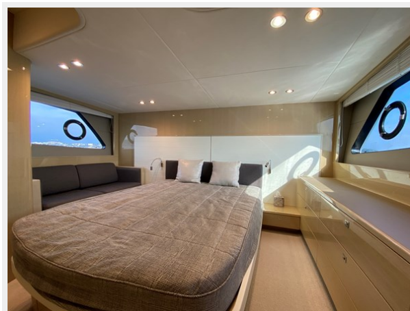
17 - Princess V48 Master Cabin