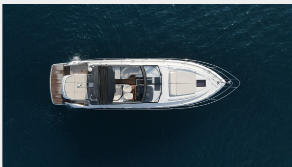
04 - Princess V48 Aerial view