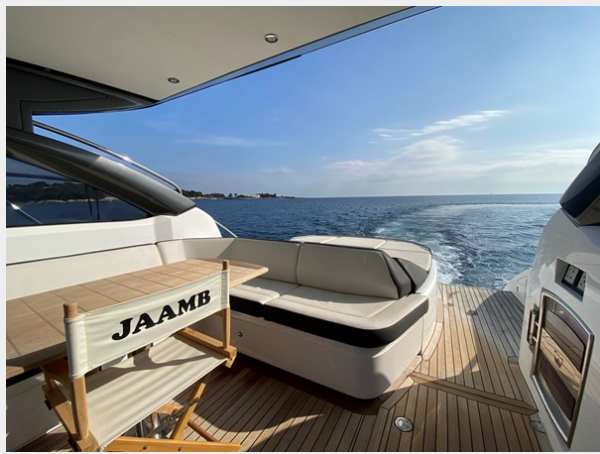
08 - Princess V48 Aft main deck