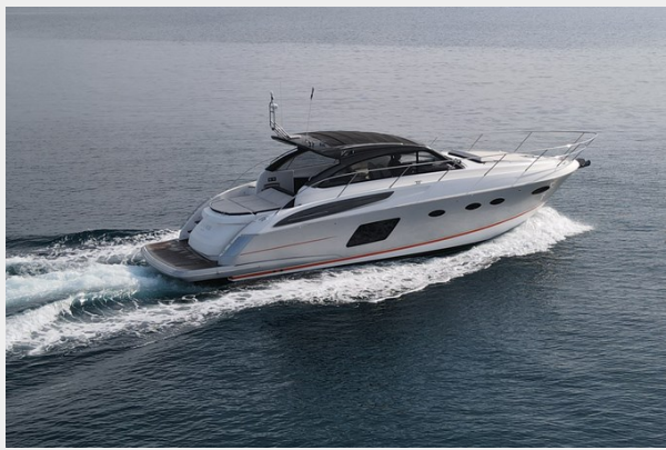
01 - Princess V48 Cruising2 - Cropped