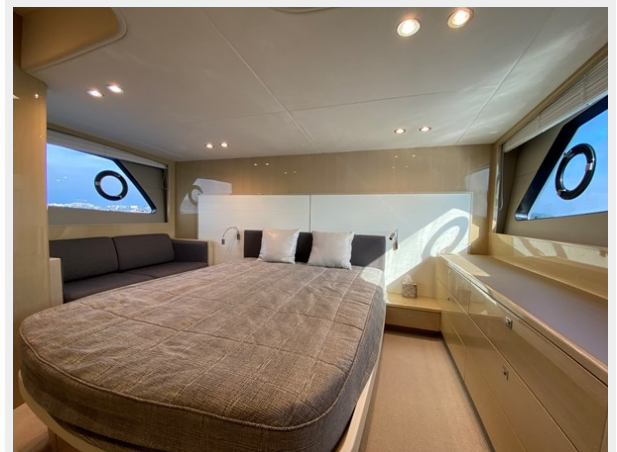
17 - Princess V48 Master Cabin