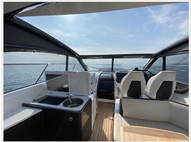
09 - Princess V48 Electric roof