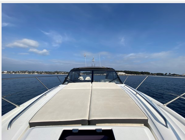
06 - Princess V48 Foredeck Sunbed2