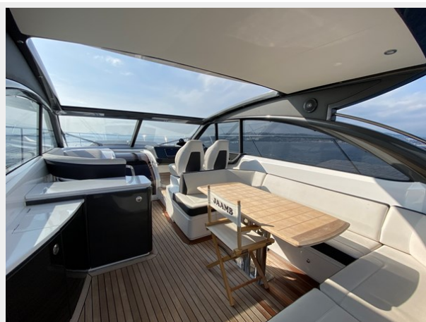
14 - Princess V48 Cockpit2