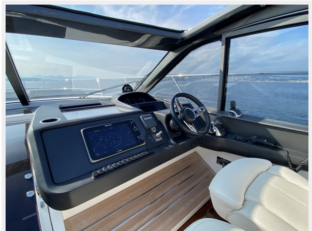
11 - Princess V48 Wheelstation