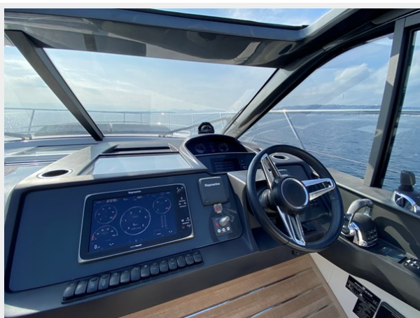
12 - Princess V48 Wheelstation2