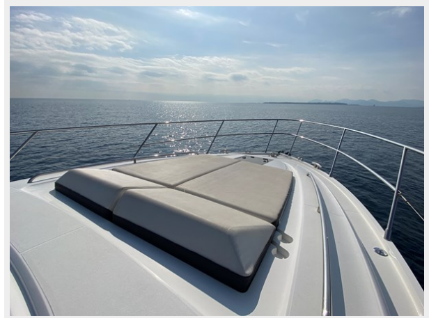
05 - Princess V48 Foredeck sunbed