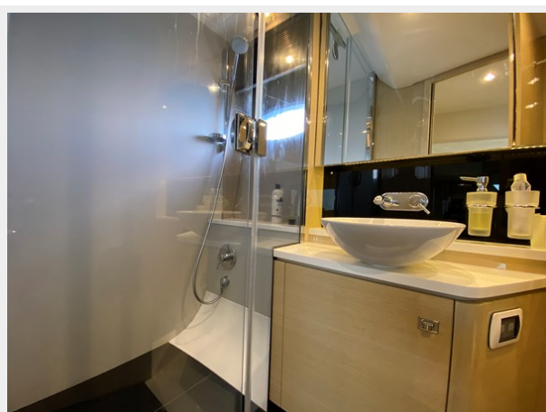
18 - Princess V48 Master bathroom