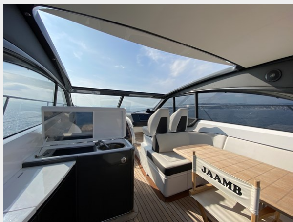
10 - Princess V48 Electric roof2