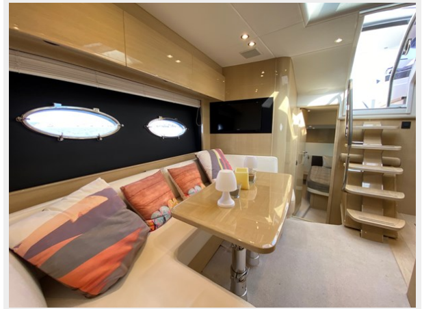
15 - Princess V48 Salon