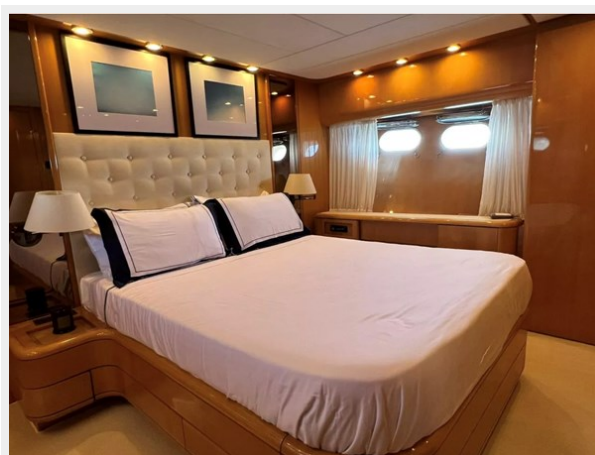
Capture d'écran 2023-01-17 à 10.51.38