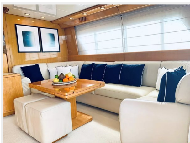
Capture d'écran 2023-01-17 à 10.50.36