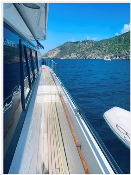
Capture d'écran 2023-01-17 à 10.50.13