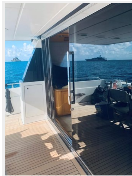
Capture d'écran 2023-01-17 à 10.50.27