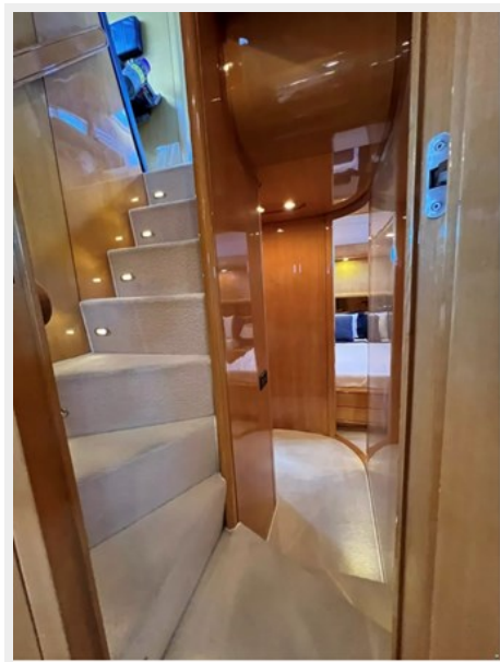
Capture d'écran 2023-01-17 à 10.51.00