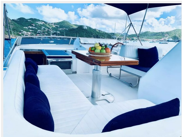
Capture d'écran 2023-01-17 à 10.51.45