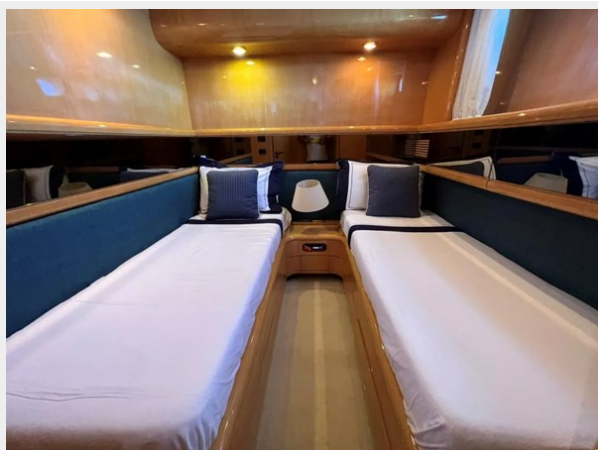
Capture d'écran 2023-01-17 à 10.51.51