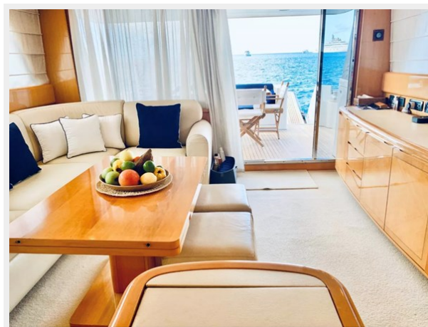
Capture d'écran 2023-01-17 à 10.50.44