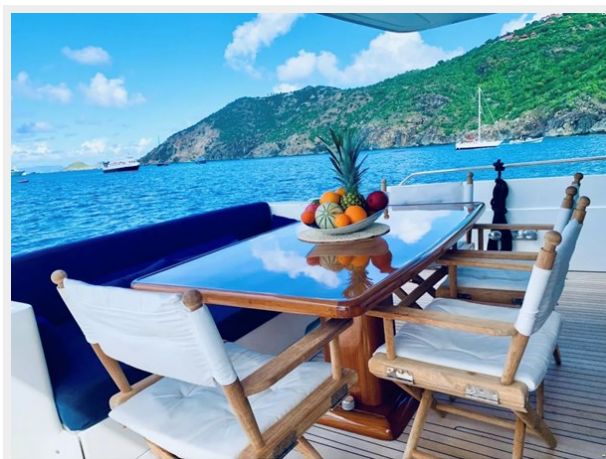
Capture d'écran 2023-01-17 à 10.50.51