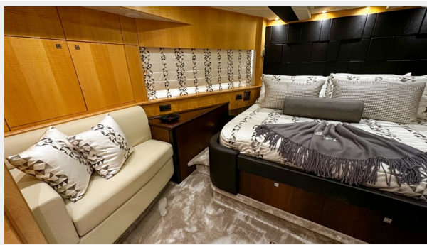
VIP Cabin 3