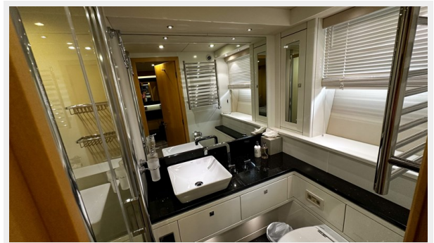
Guest Head Port