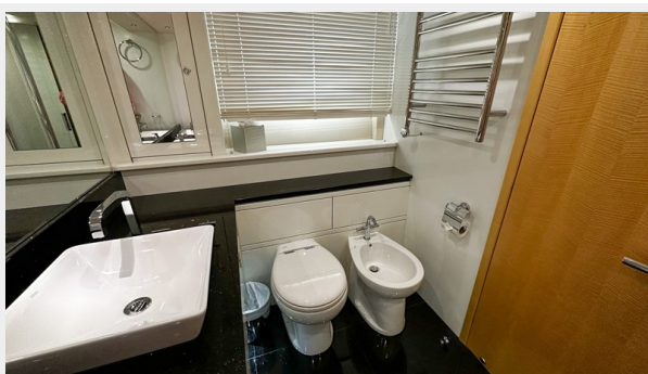
Master Head 2