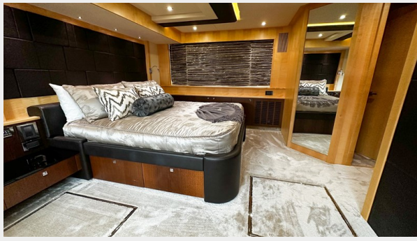
Master Cabin 3