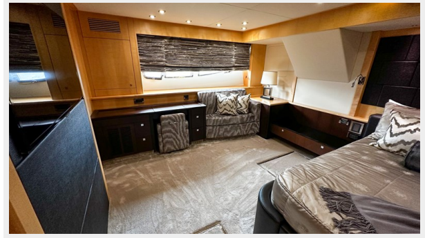
Master Cabin 2