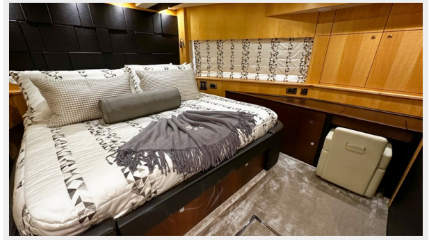
VIP Cabin 2