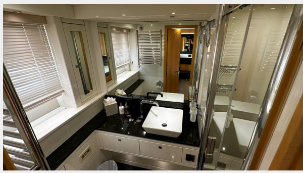
Guest Head Stbd