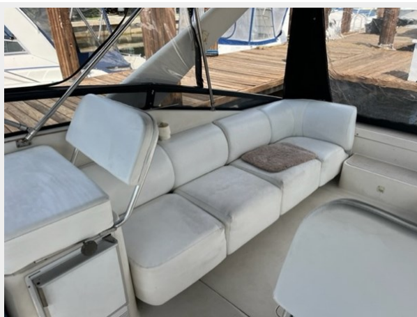
5. Cockpit Lounge