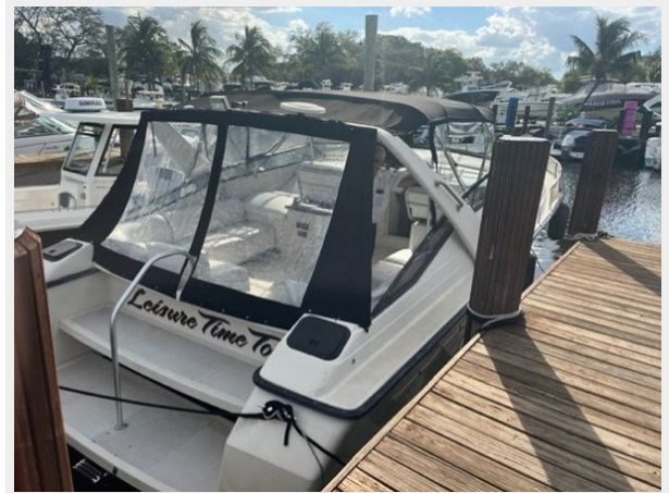
2. Aft Deck