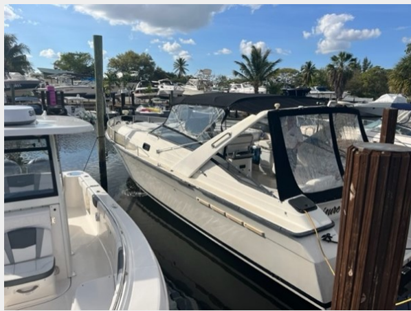
1. Port Exrterior