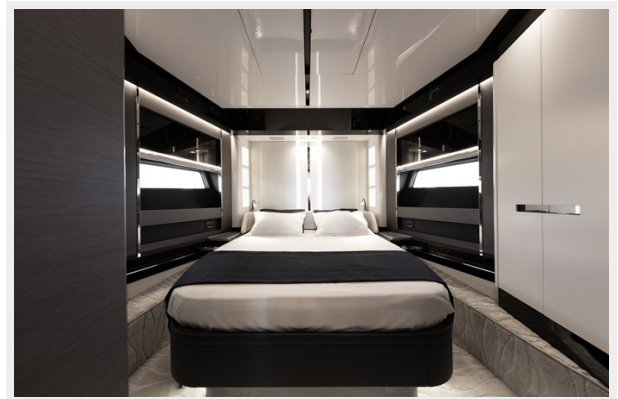
Never Give Up Azimut S8 VIP Cabin