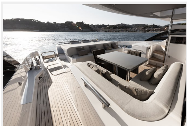
Never Give Up Azimut S8