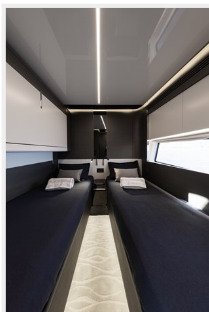
Never Give Up Azimut S8 Twin Cabins