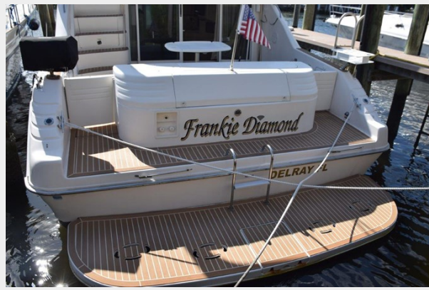
Lower Swim Platform with Fold Out Ladder