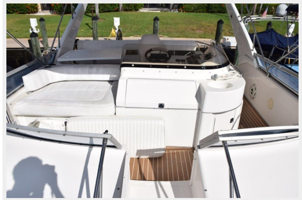
Bridge Entry from Bow