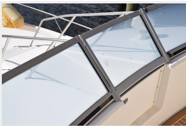
Closed Windshield and Gate Door Forward