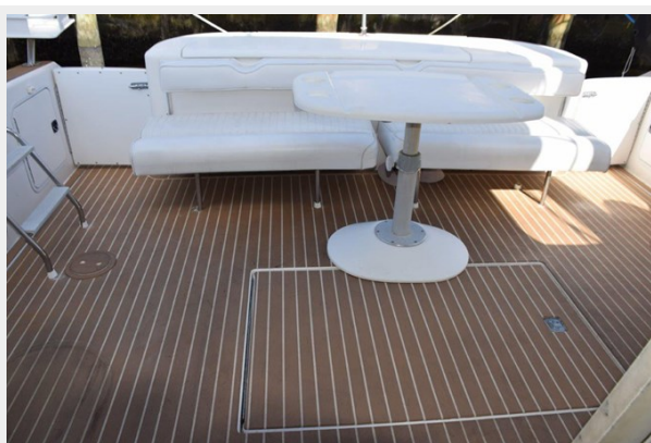
Cockpit Deck with Moveable Table