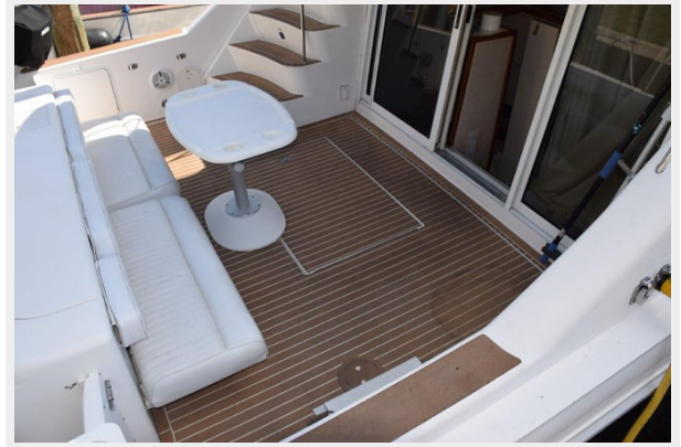
Cockpit and Sliding Door Entry to Cabin