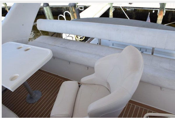
Bench Seating on Aft Flybridge