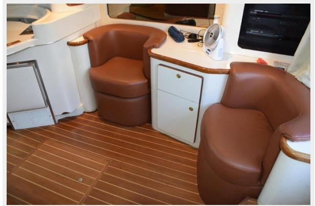
Starboard Salon Chairs