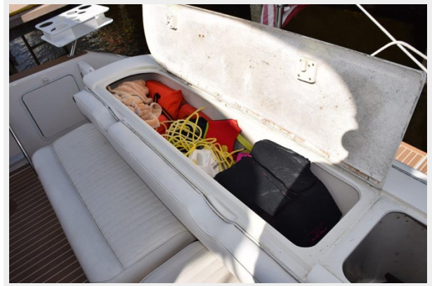
Aft Storage in Fishbox