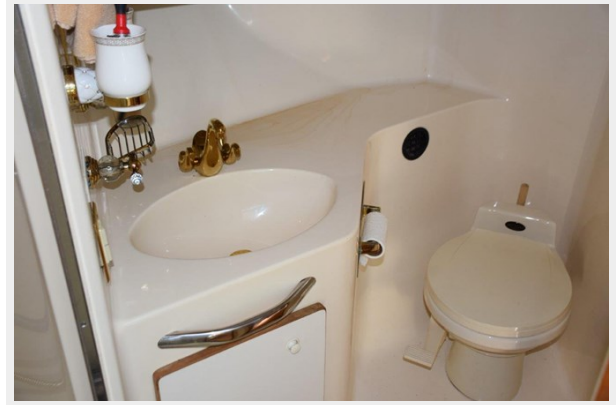
Master Head - Separate Shower