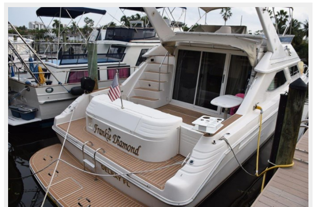
SeaDec on Cockpit, Platforms, Steps, and Flybridge