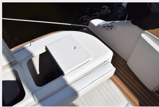
Drink Cooler or Livewell