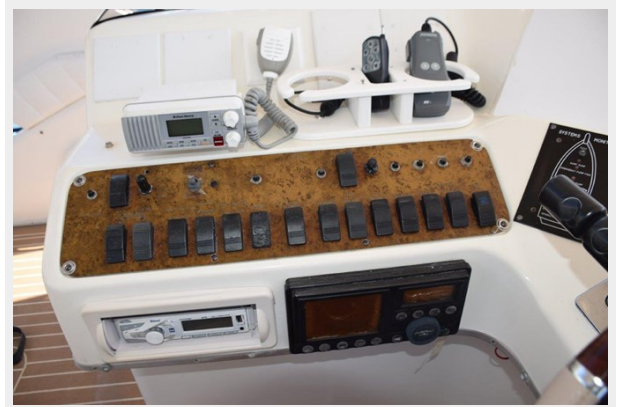
Helm Portside Console