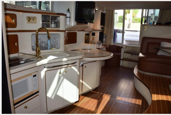
Starboard Side Cabin, Aft View