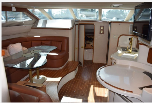
Salon with TV to Starboard Side