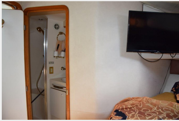
TV in Master, Head Entry Door