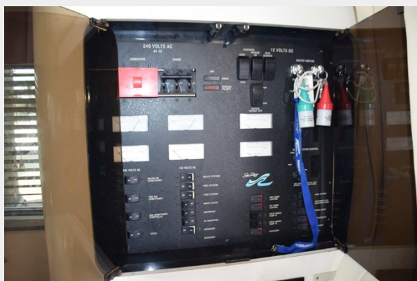
Electrical Panel in Aft Salon to Starboard