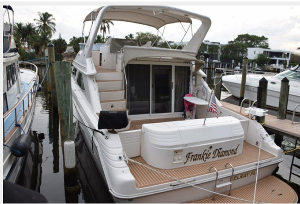
Dockside, note step to flybridge with Railing