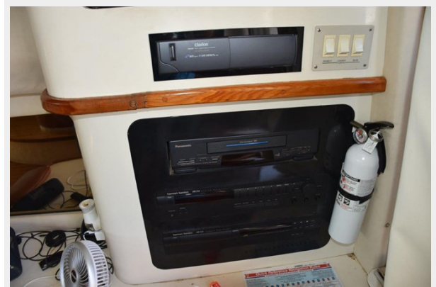
AV Below Electrical Panel