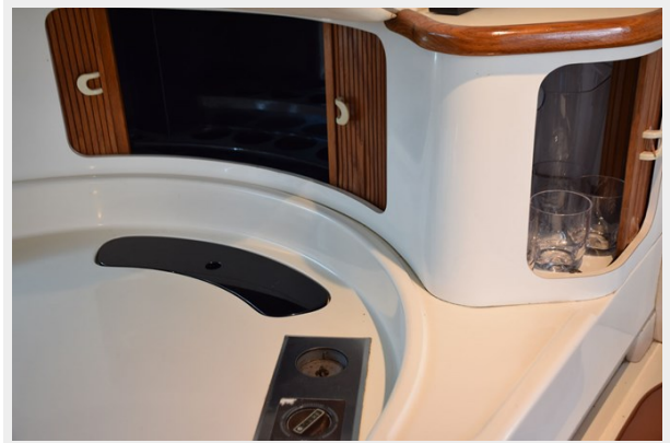
033 Serving Area and Cabinets, Starboard Salon