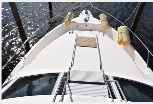
Steps Down to Bow