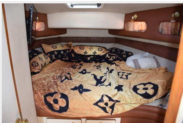
Master Stateroom Forward