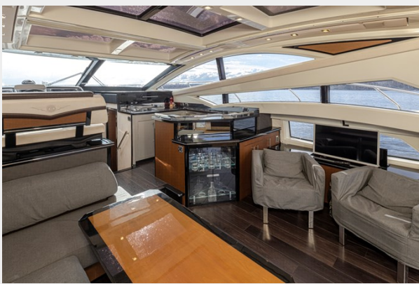
The Belly 28 L