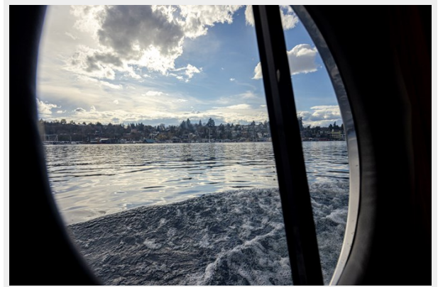
The Belly 45 L