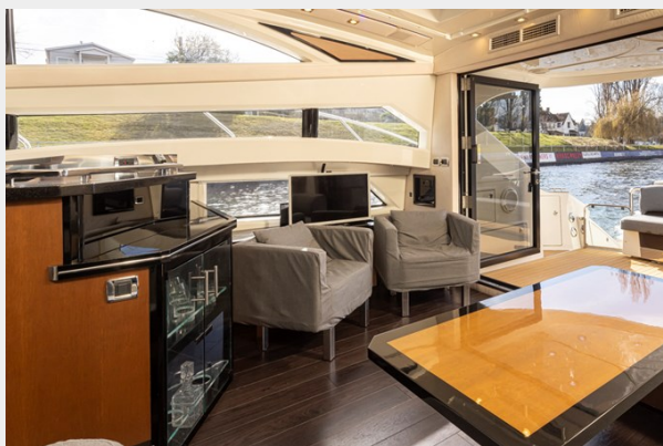
The Belly 20 L