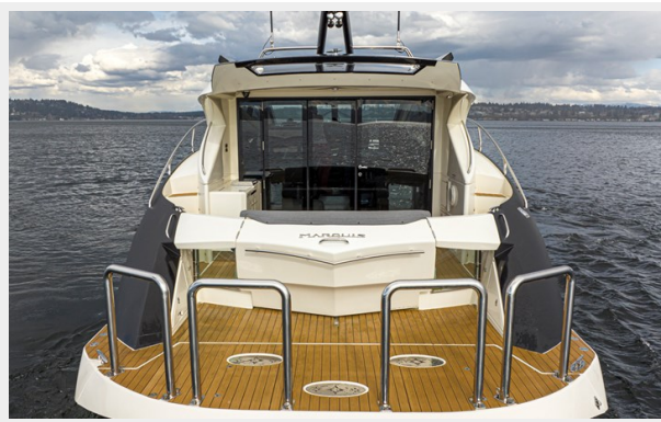
The Belly 12 L