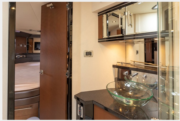
The Belly 42 L