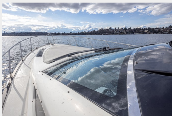
The Belly 38 L