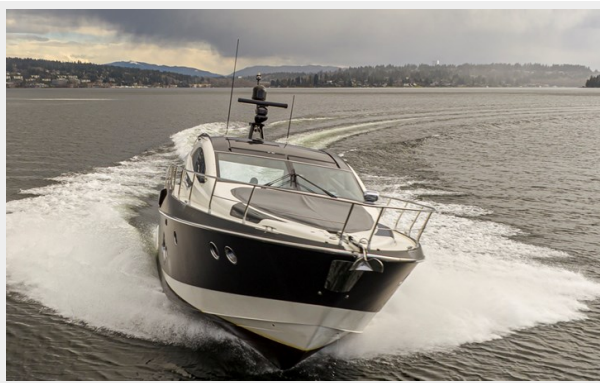
The Belly 03 L