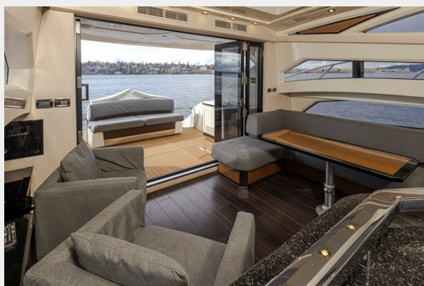
The Belly 32 L