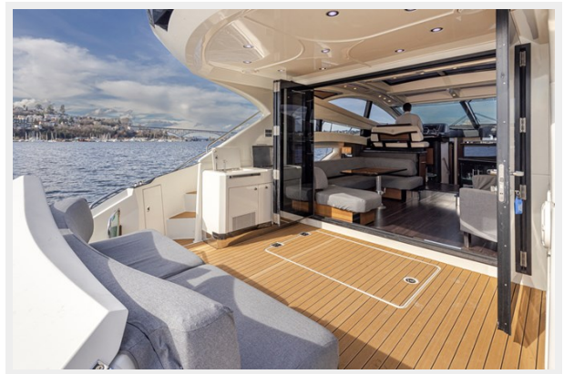
The Belly 13 L