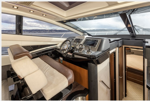
The Belly 30 L