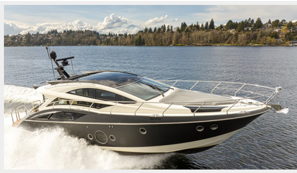
The Belly 08 L