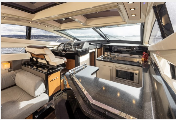
The Belly 23 L