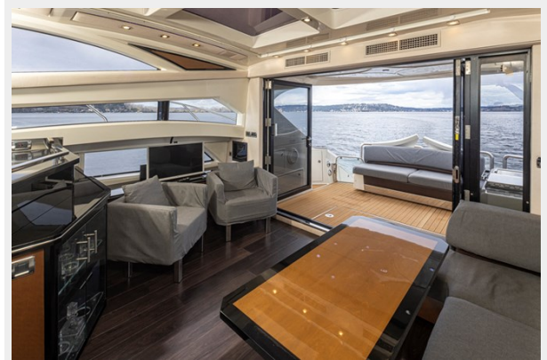
The Belly 33 L