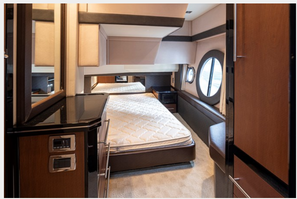
The Belly 44 L