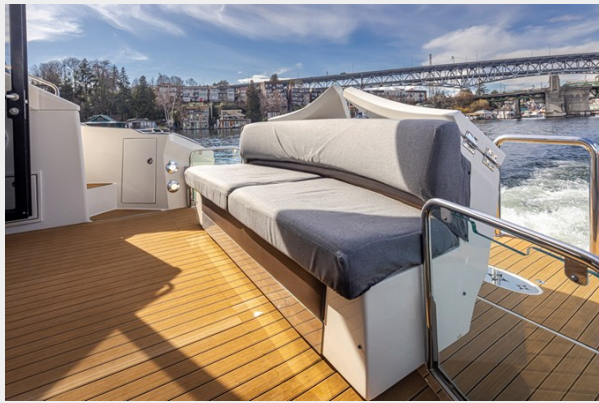
The Belly 16 L