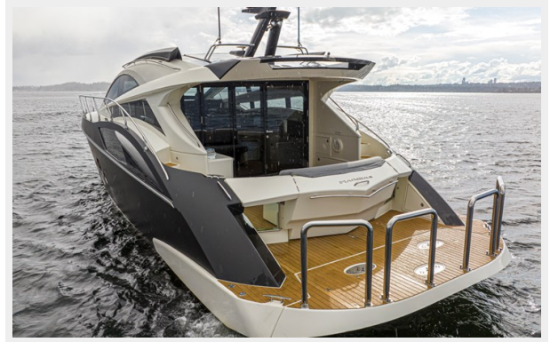
The Belly 11 L