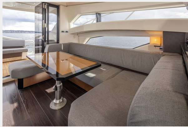
The Belly 36 L