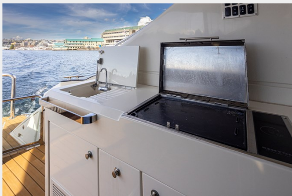
The Belly 18 L