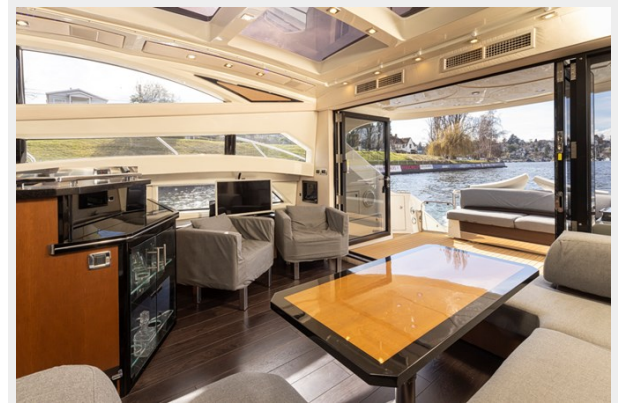
The Belly 19 L