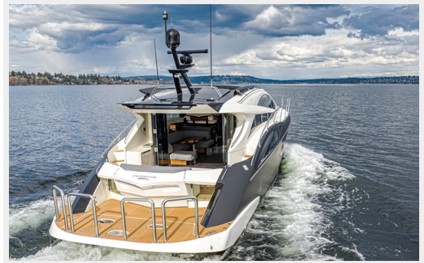
The Belly 00 L