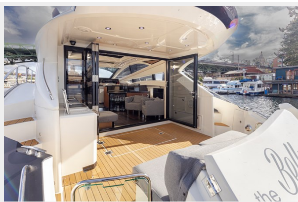
The Belly 14 L