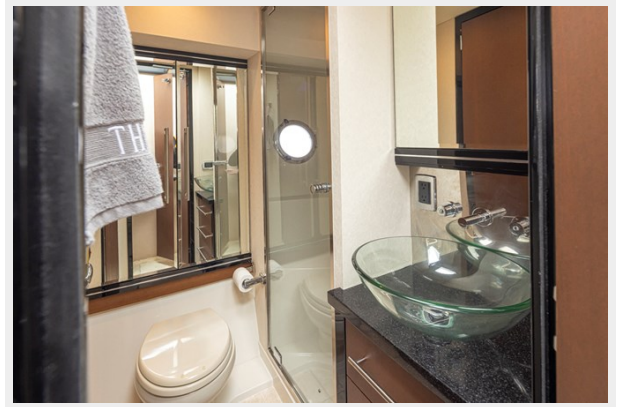
The Belly 43 L