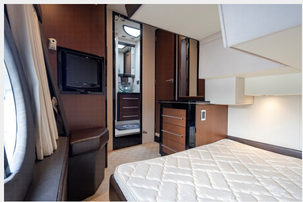
The Belly 46 L