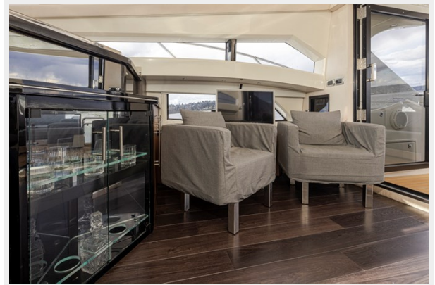
The Belly 37 L