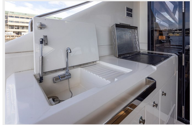
The Belly 17 L