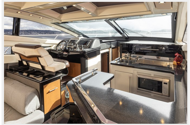
The Belly 24 L