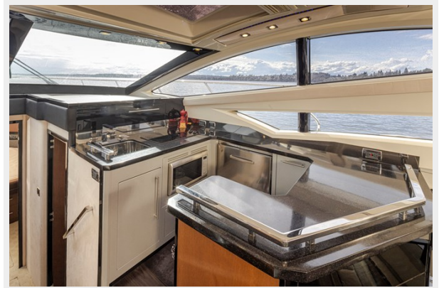
The Belly 27 L