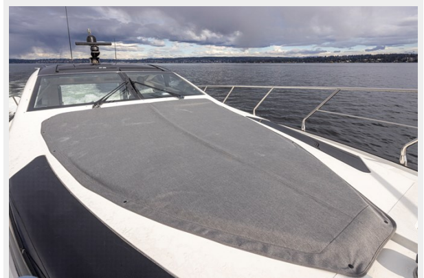
The Belly 39 L