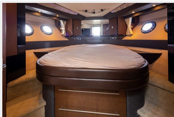
The Belly 40 L