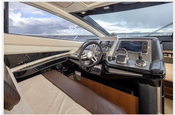
The Belly 31 L