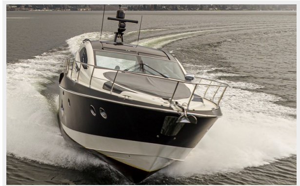
The Belly 04 L