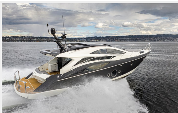
The Belly 06 L