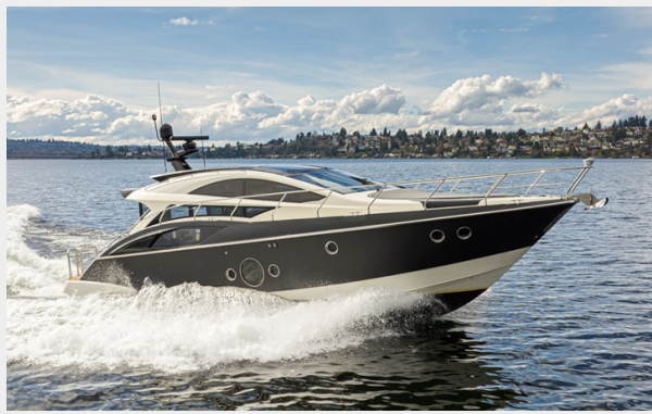
The Belly 01 L