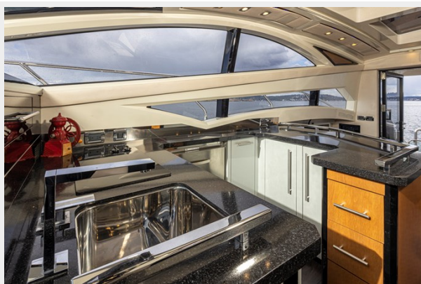
The Belly 34 L