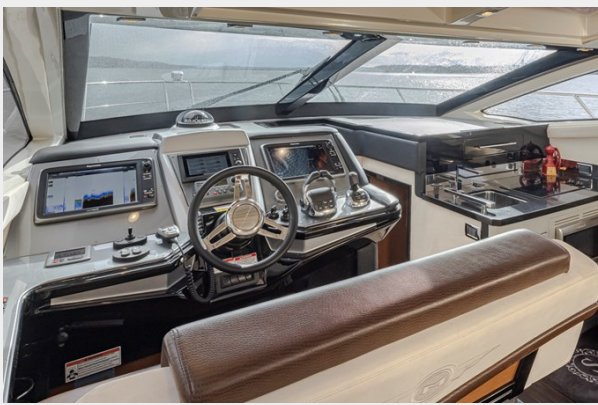
The Belly 26 L