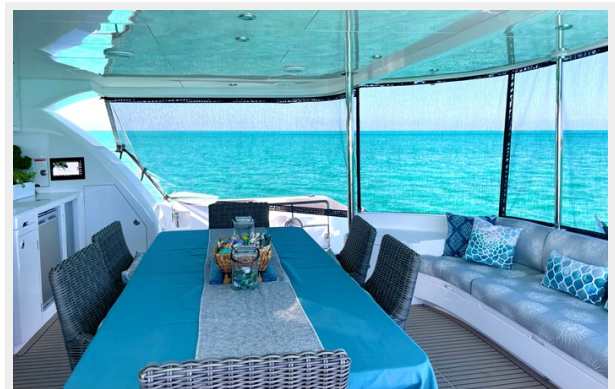
AFT DECK 2