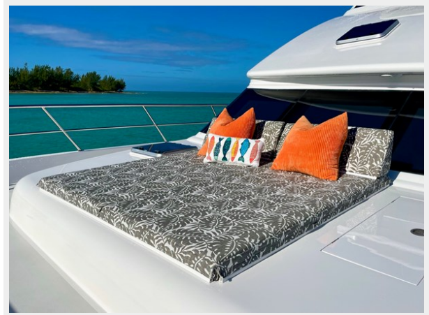
SUN LOUNGER 2