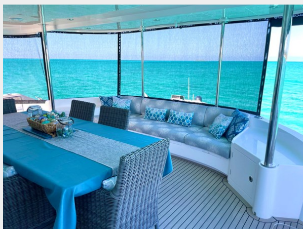
AFT DECK 1