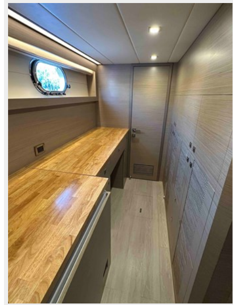
STB CABIN WORK BENCH