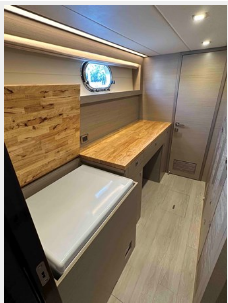
STB CABIN FREEZER