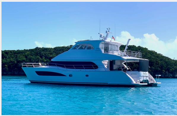
AT ANCHOR 2