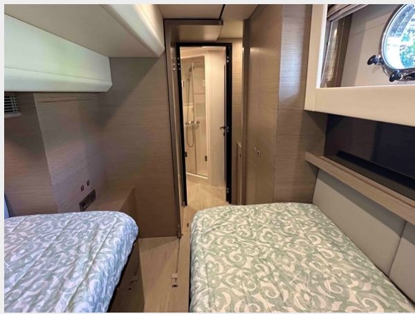
PORT TWIN LOOKING AFT